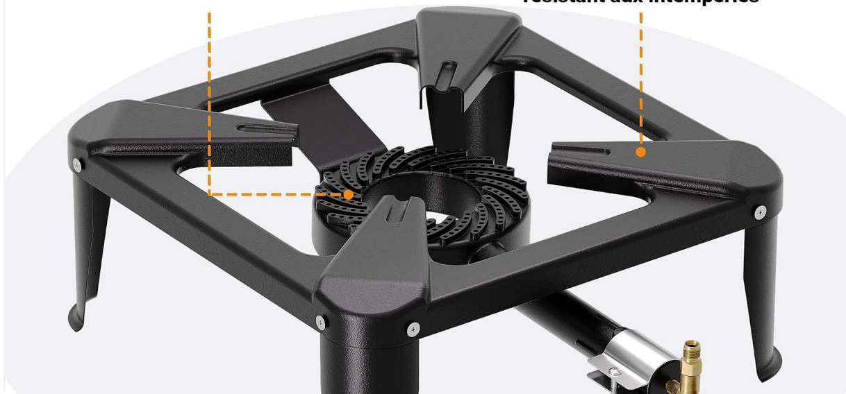
Image 3.1: Detailed view of the stove's solid construction, highlighting the heat-resistant burner and weather-resistant steel frame.