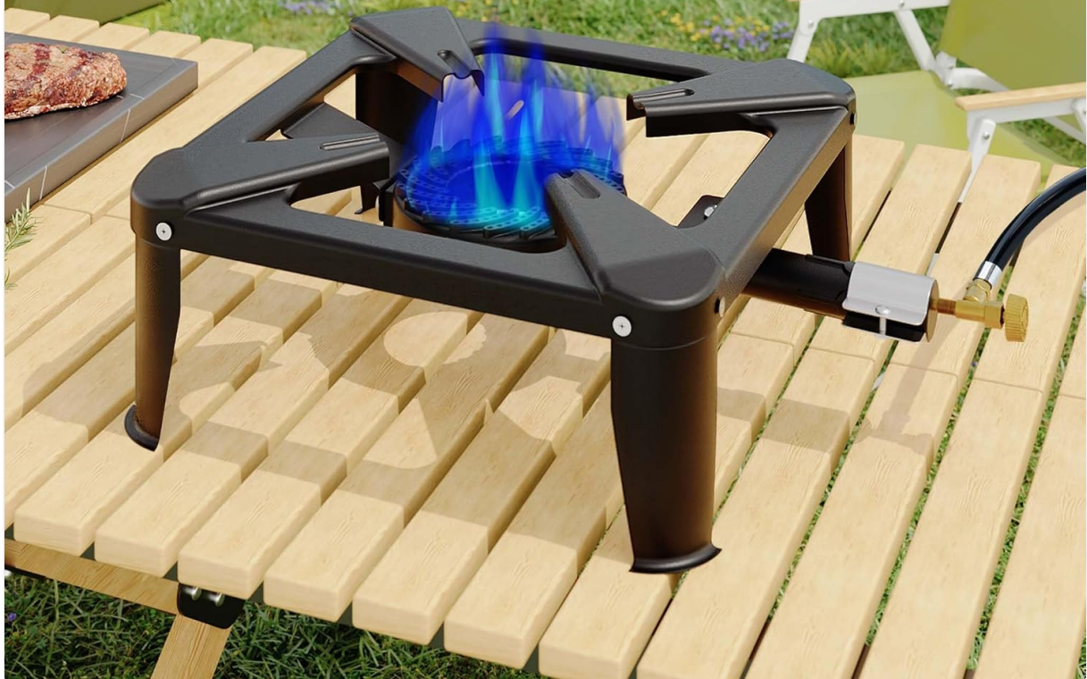
Image 5.1: The stove in operation, demonstrating its high energy efficiency and suitability for quick cooking during camping trips.