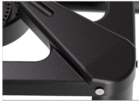
Acier revêtu de poudre et résistant aux intempéries