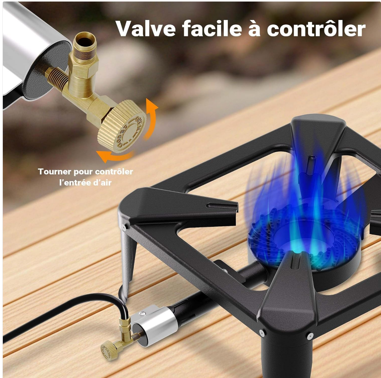
Image 4.1: The gas inlet valve, demonstrating how to adjust the air intake for optimal flame control.