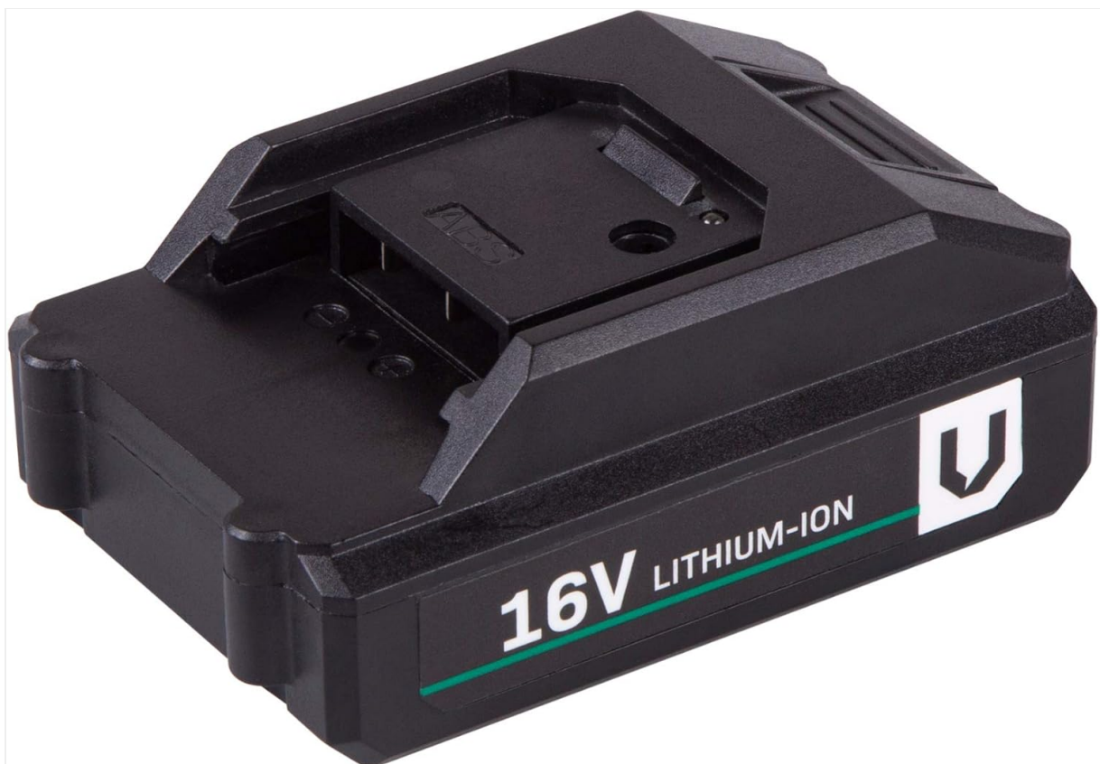
Figure 2: Angled view of the VONROC 16V 1.5Ah Lithium-Ion Battery, highlighting its compact design and connection interface.