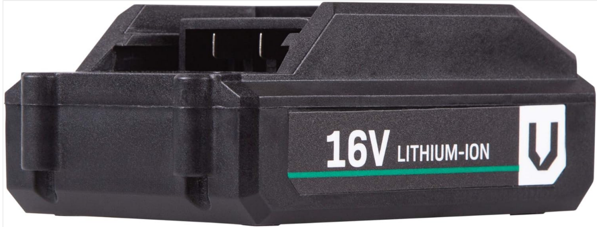
Figure 1: Side view of the VONROC 16V 1.5Ah Lithium-Ion Battery, showing the 16V Lithium-Ion branding and the VONROC logo.

The VONROC 16V 1.5Ah Lithium-Ion Battery (Model CD811AA) is a lightweight, rechargeable power source designed for various VONROC 16V cordless tools. It features lithium-ion technology, offering a long lifespan and no self-discharge, ensuring it's always ready for use.