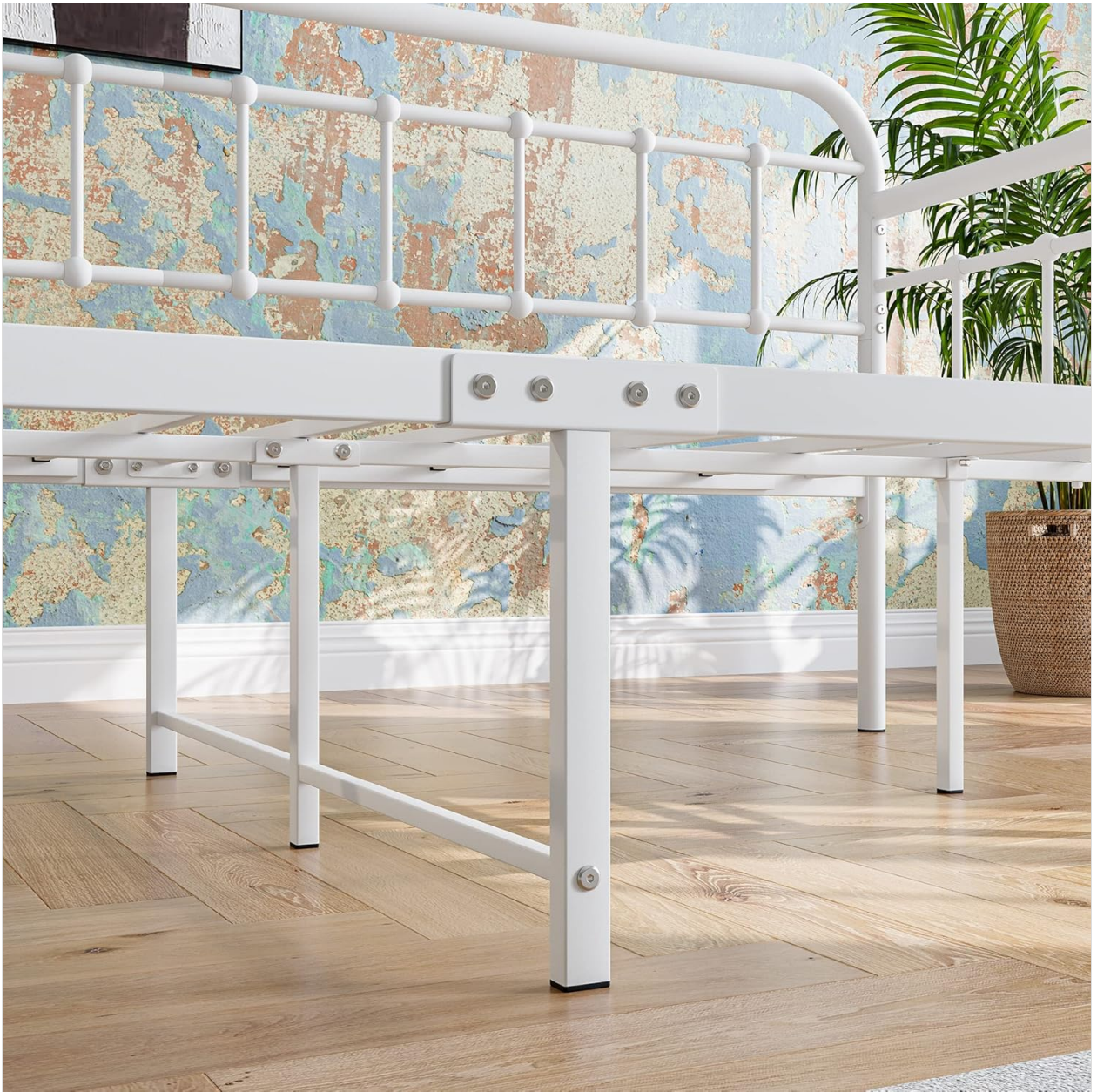
Image: Detail of a support leg attachment.