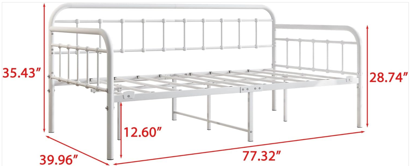
Image: Dimensional diagram of the daybed frame.