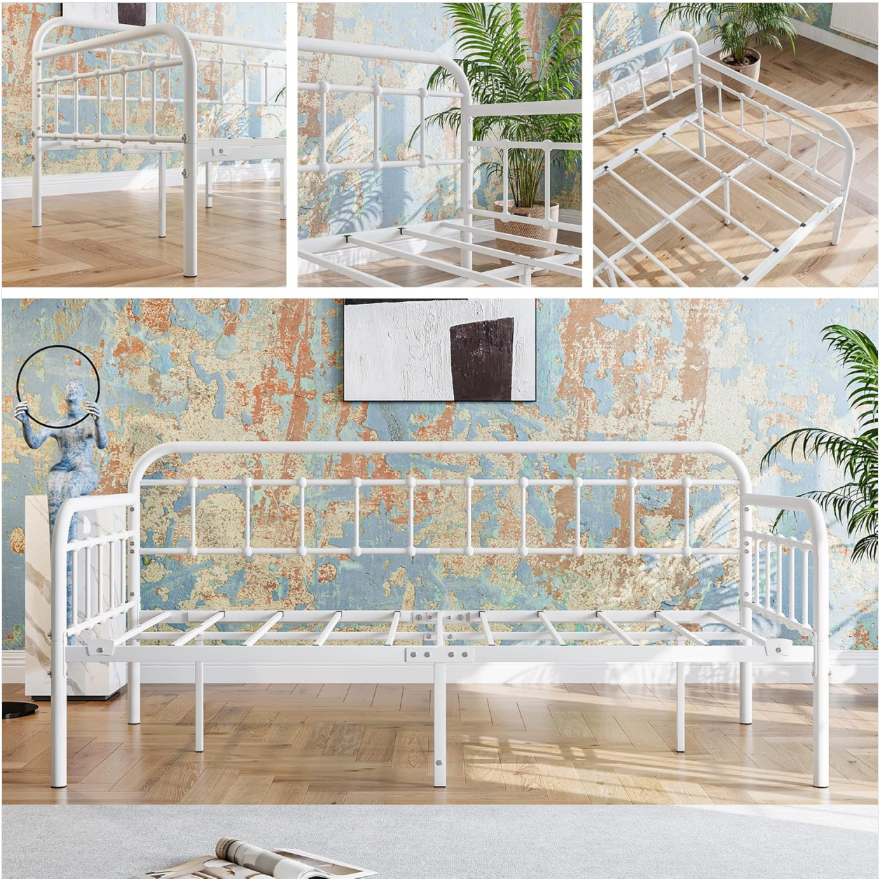
Image: Detail of a frame connection point.