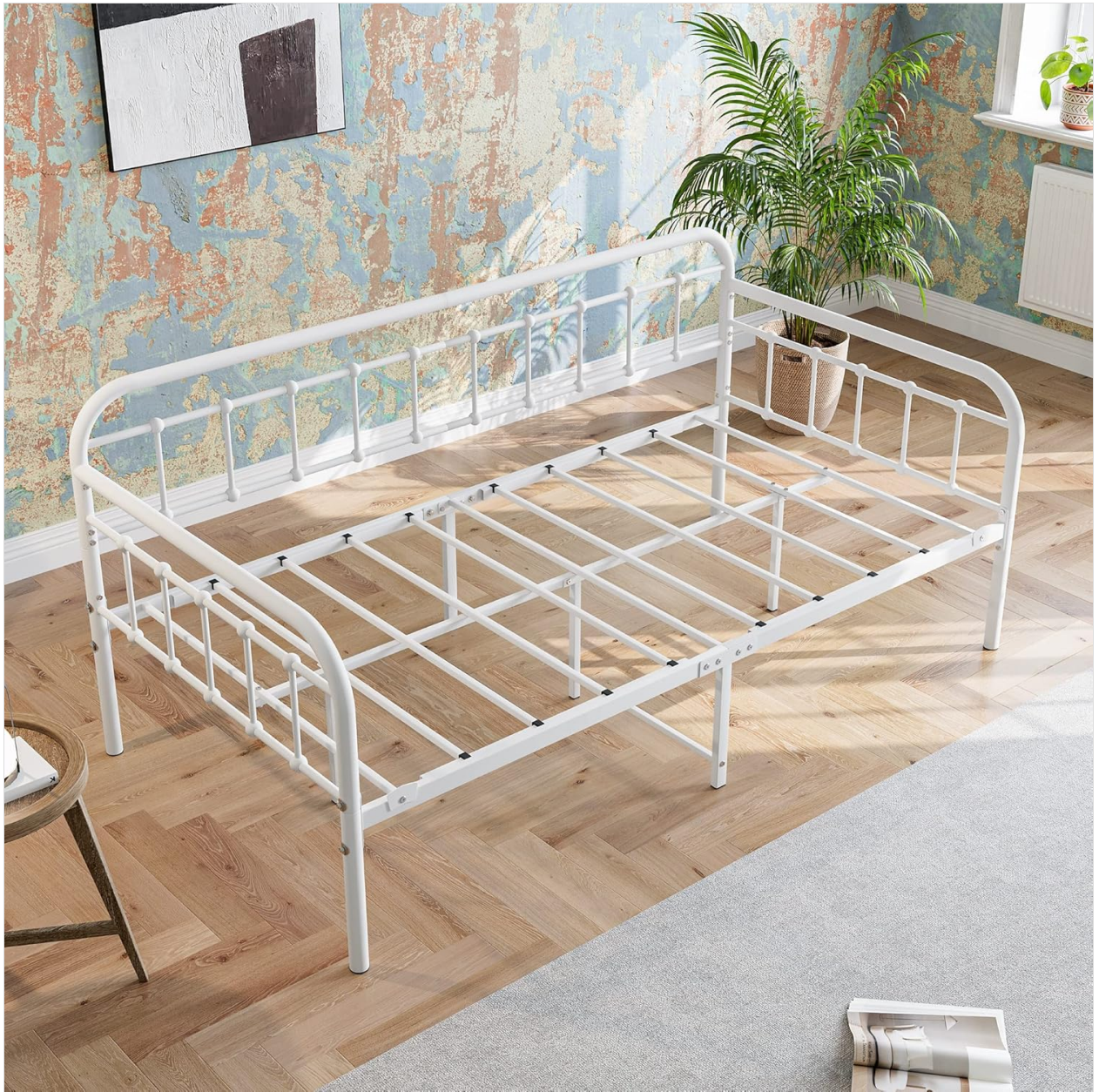
Image: The daybed frame with all slats installed, viewed from above.