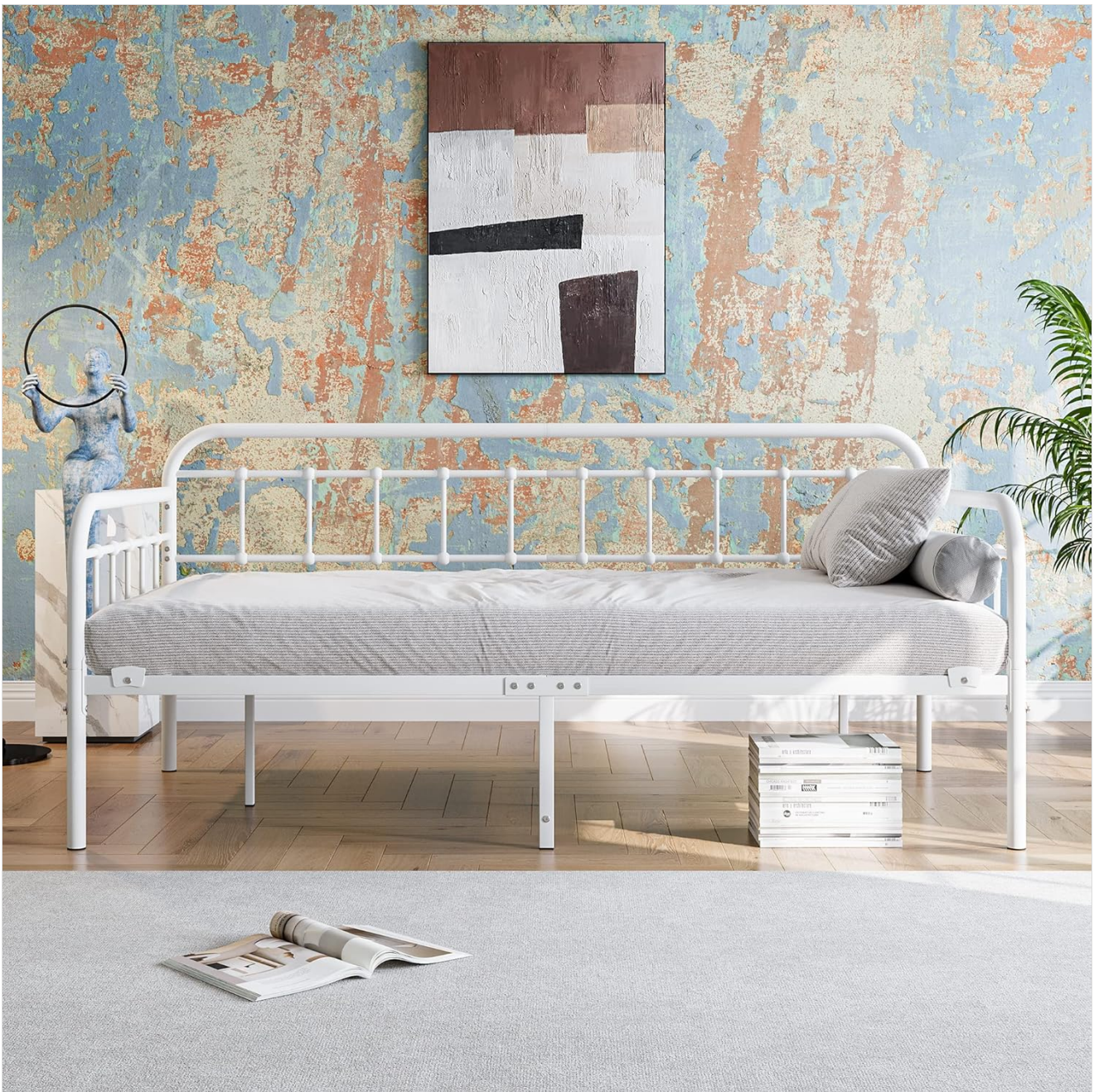
Image: The daybed configured as a sofa with pillows.