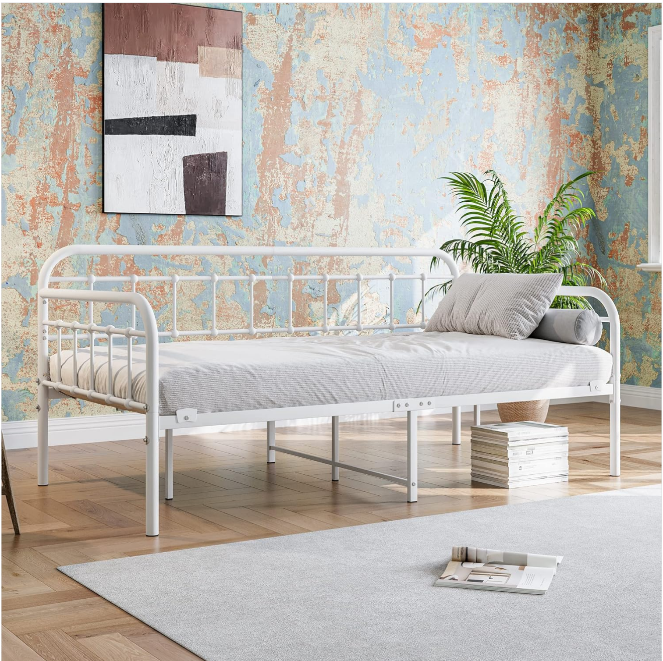
Image: The JURMERRY Metal Daybed Frame, fully assembled and ready for use.