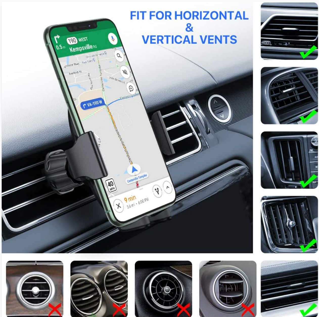
Figure 4: Fit for Horizontal & Vertical Vents