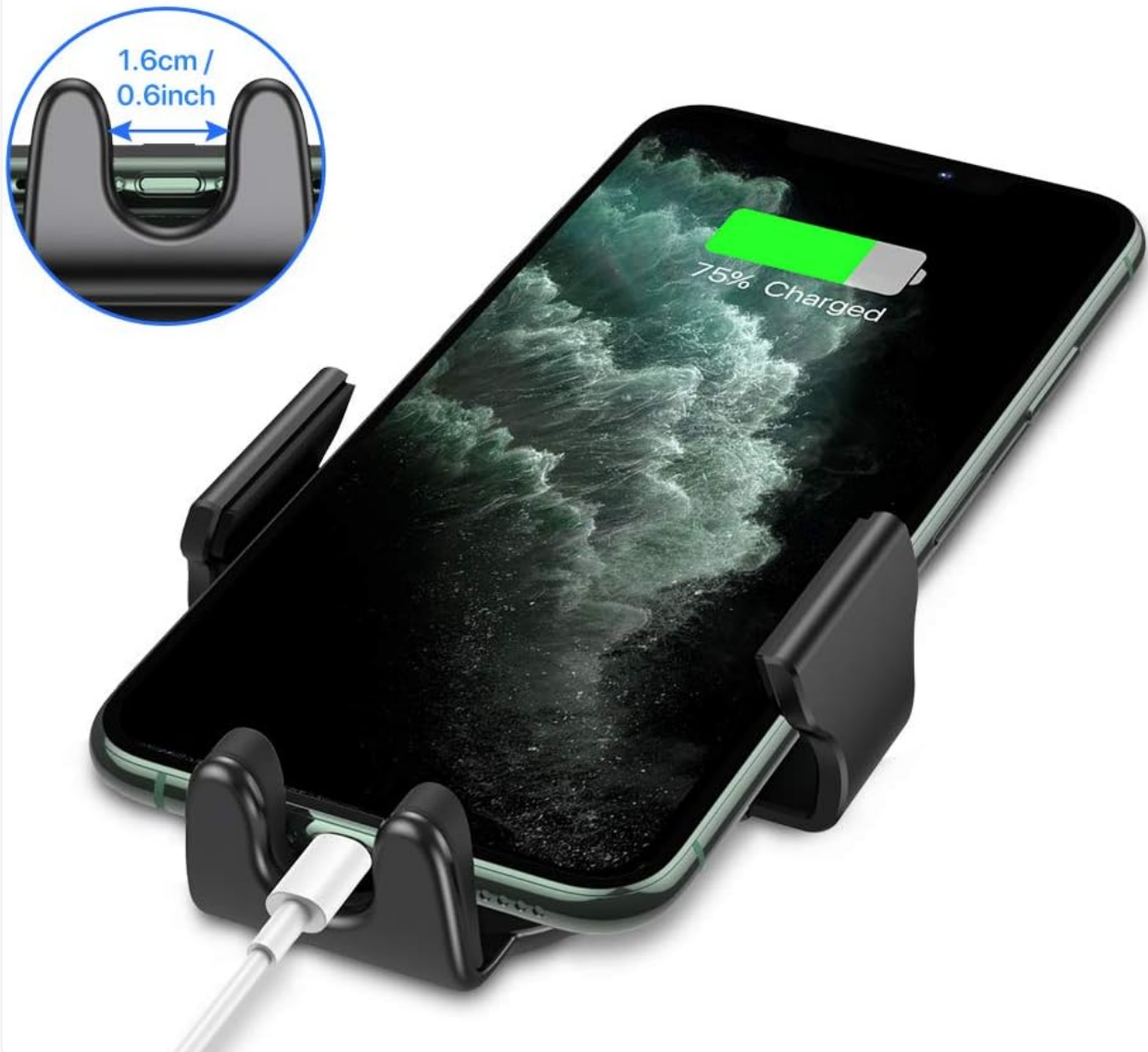
Figure 8: Phone in holder with reserved charging port

Hassle-free Charging When Using Navigation Apps