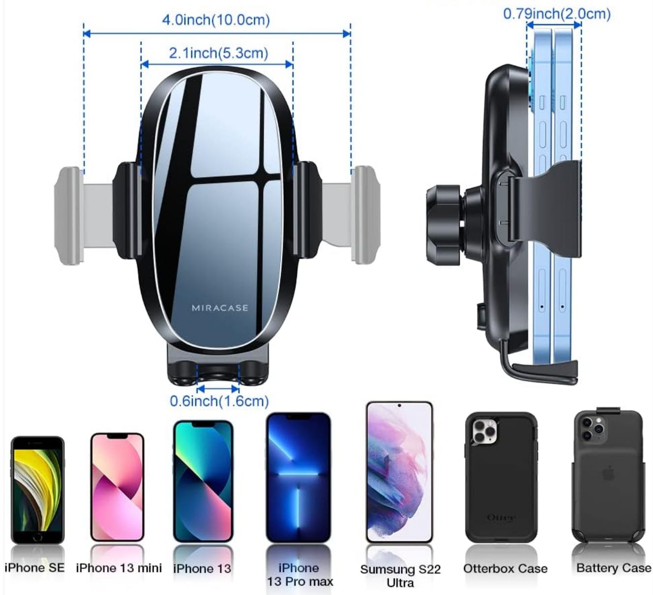
Figure 9: Universal Compatibility with various phone sizes and cases

Fit All Phones & Thicker Cases Size 4.0-7.0 inches