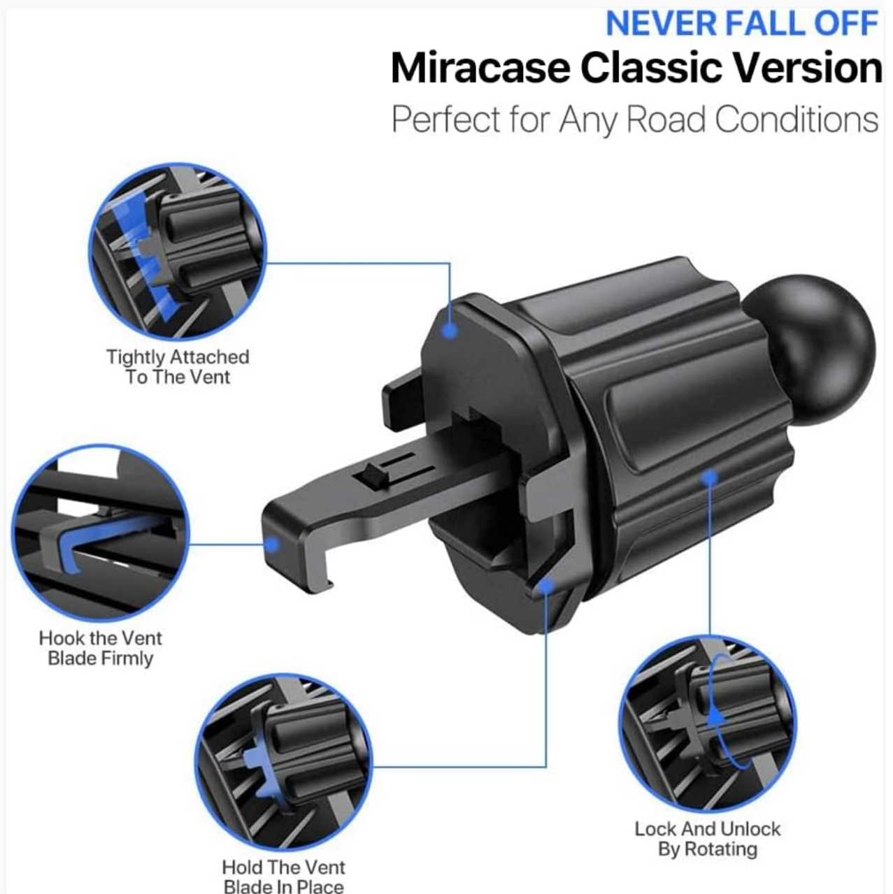
Figure 2: Detailed view of the Metal Hook Design