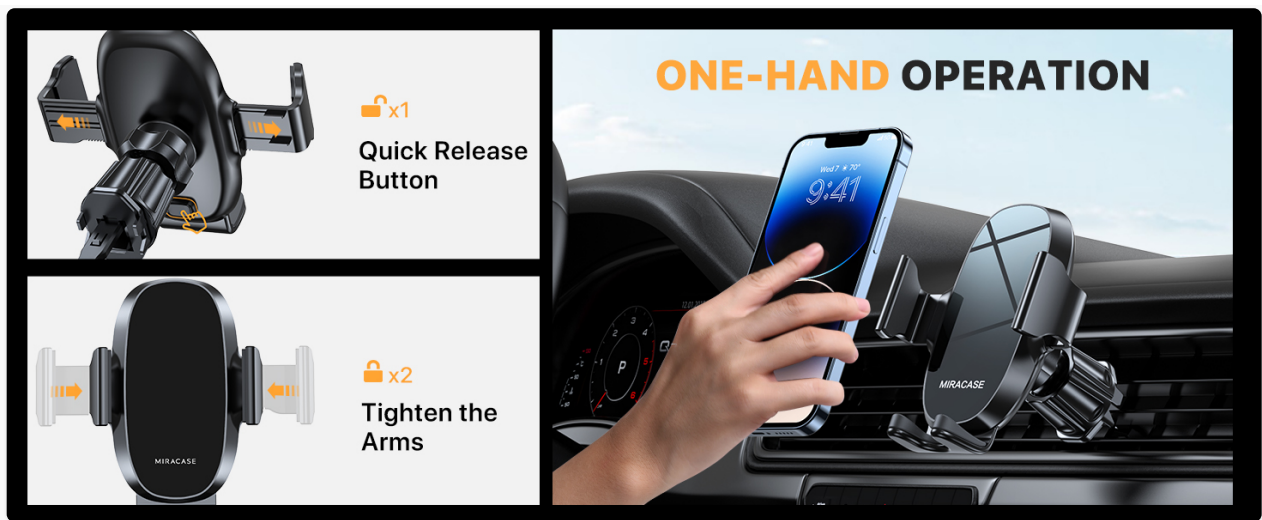
Figure 3: 2 Steps Easy to Install & Use