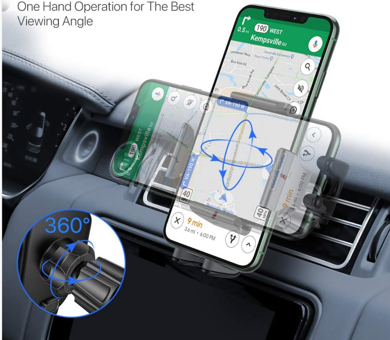
Figure 5: 360 Degree Rotation in a car interior

One Hand Operation for The Best Viewing Angle