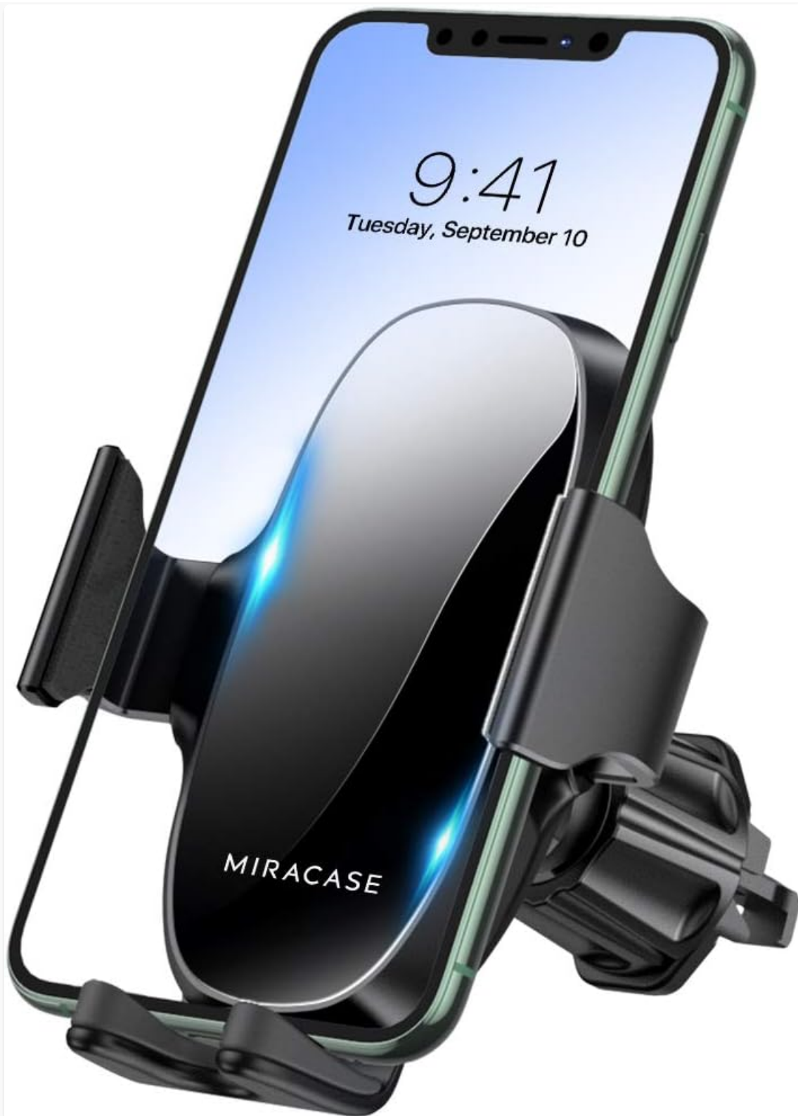
Figure 1: Miracase Phone Holder - Front View