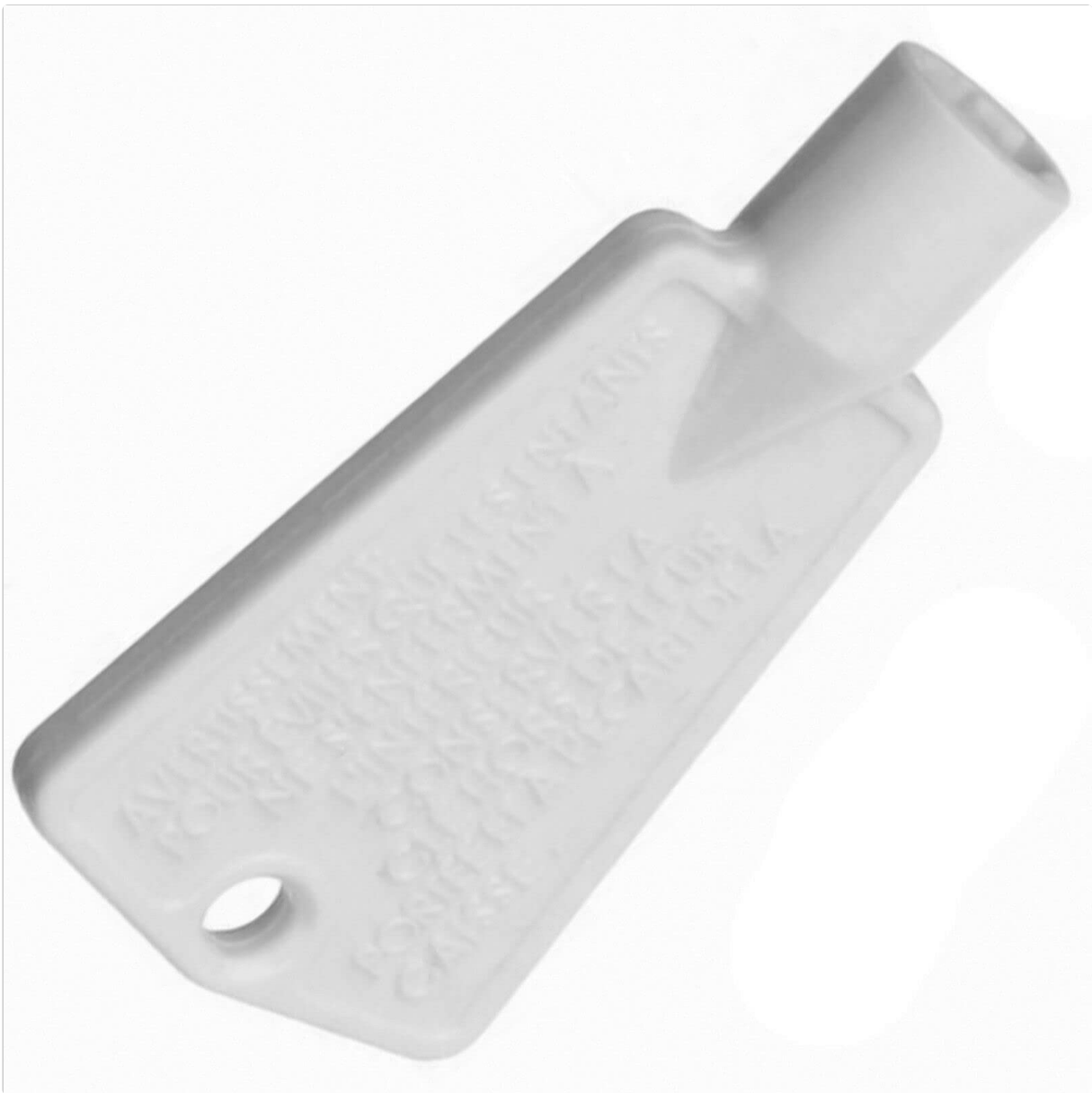
Image: The KOB Freezer Door Lock Key, a white plastic key designed for freezer door locks.