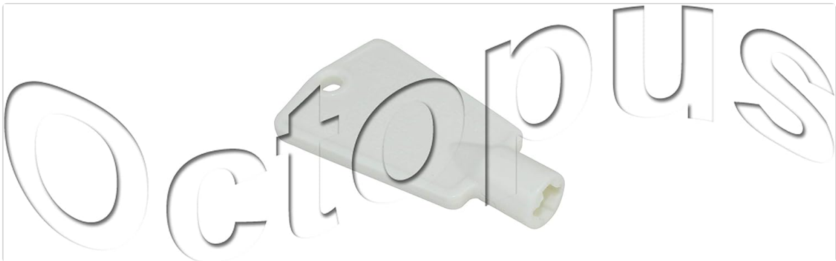
Image: The KOB Freezer Door Lock Key shown from a different angle, highlighting its functional design for operating a freezer lock.