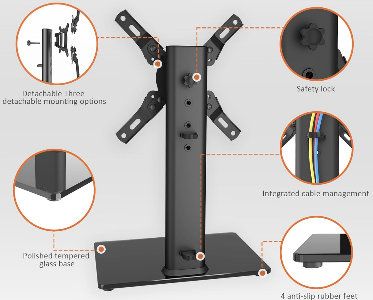
Figure 2: Exploded view of the stand's components and assembly points, including safety lock and anti-slip feet.

Made of High-quality Materials, with Cable Management System & Anti-slip Feet