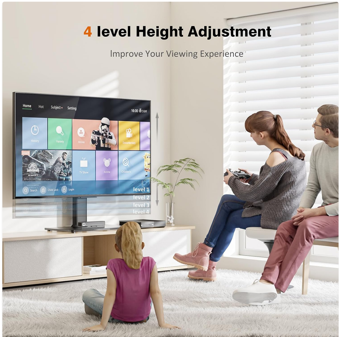
Figure 3: Illustration of the 4-level height adjustment feature, allowing users to optimize viewing experience.