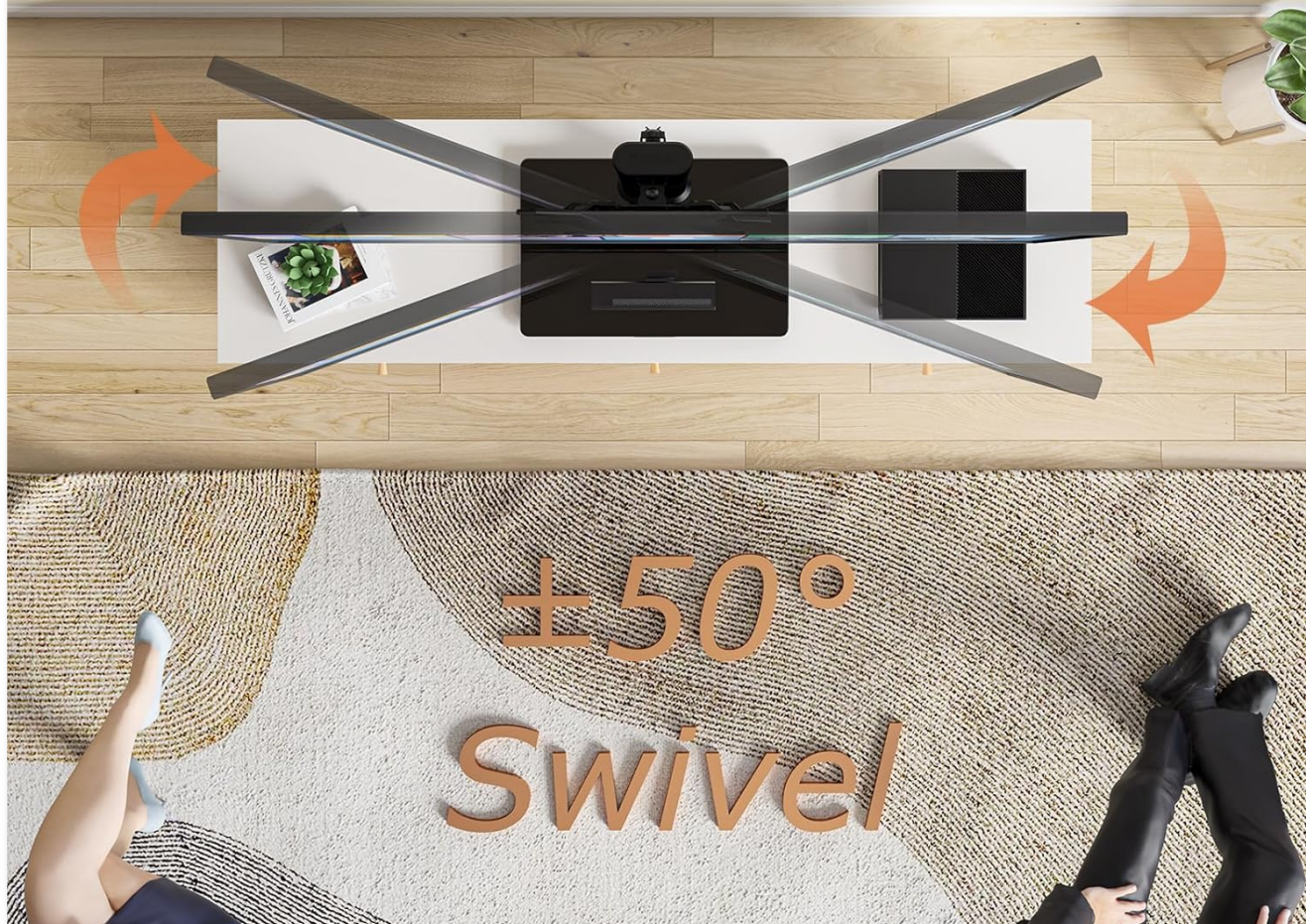
Figure 4: Visual representation of the ±50° swivel adjustment, enhancing viewing comfort.

Enjoy the Best comfortable Viewing Experience