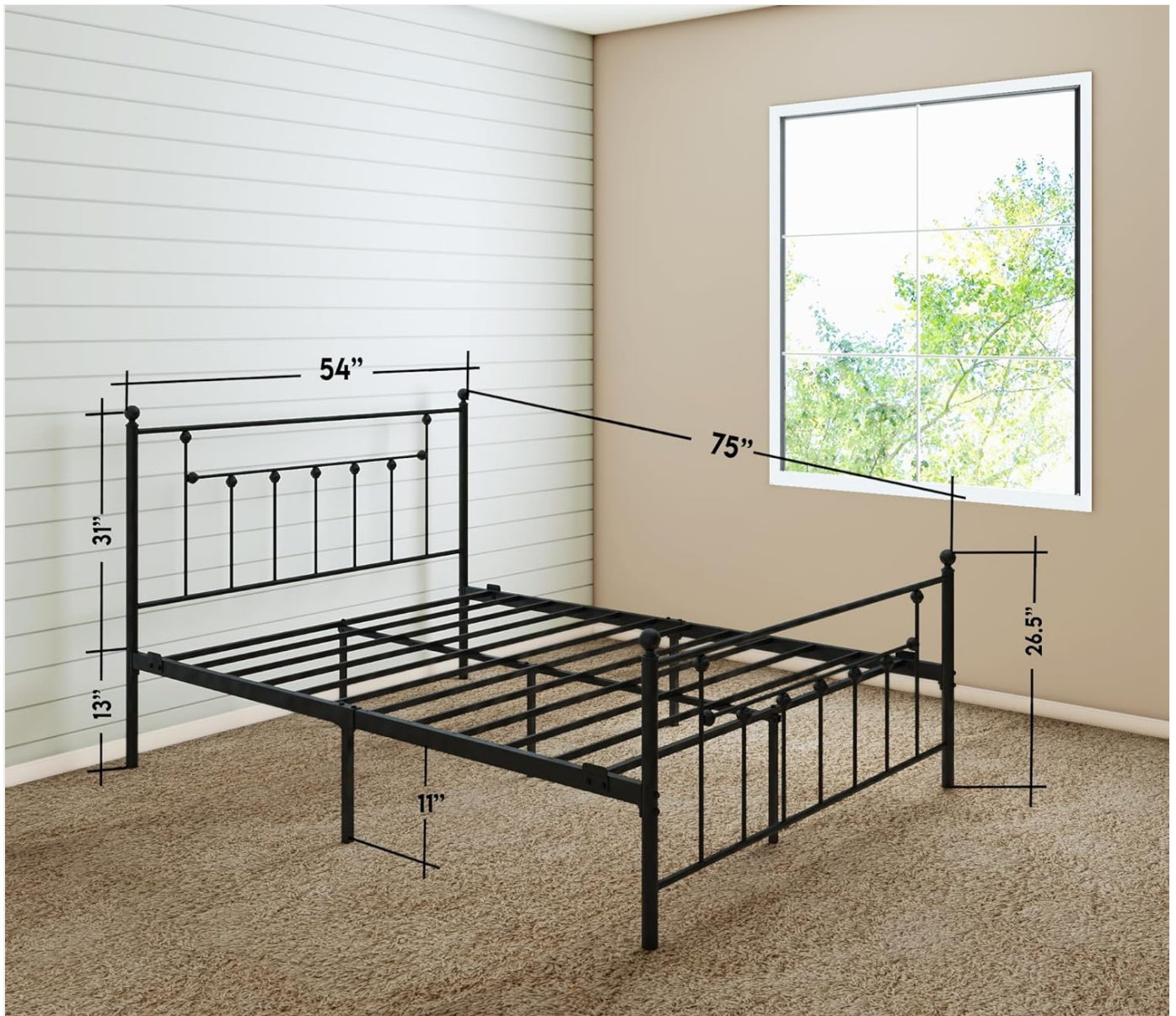
Image 4.1: Product dimensions for the Full size bed frame: 75"L x 54"W x 48.5"H.