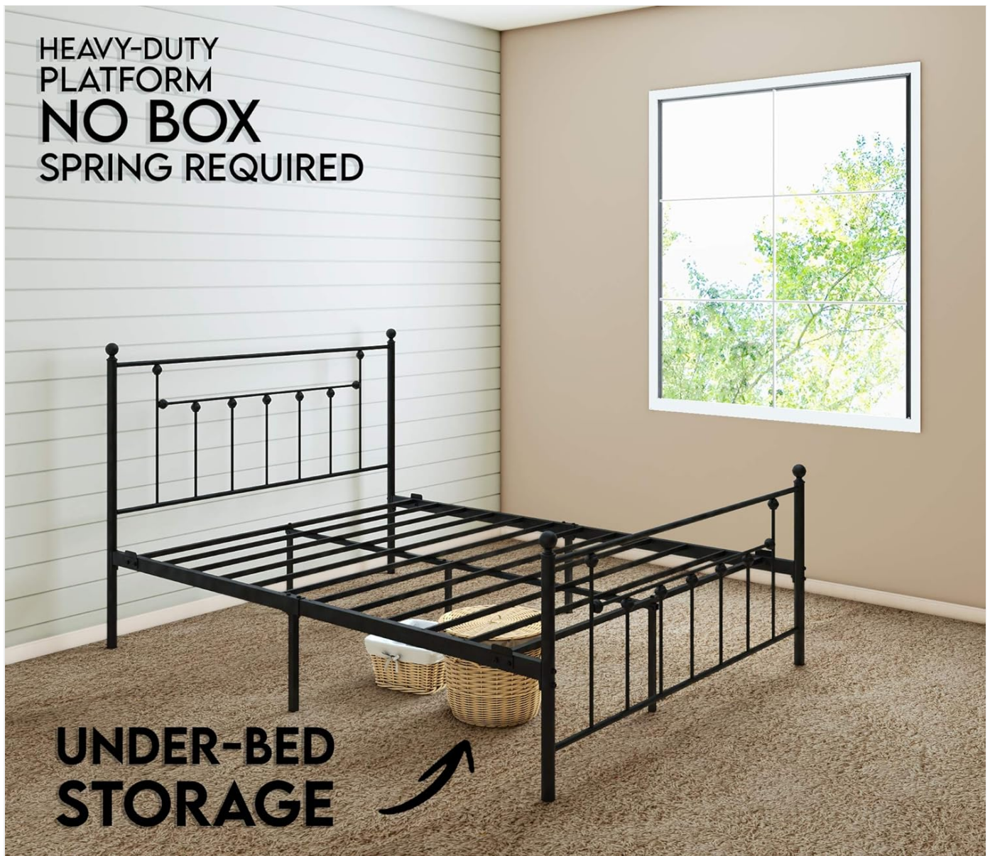
Image 5.1: The bed frame offers generous under-bed storage, ideal for organizing your bedroom.