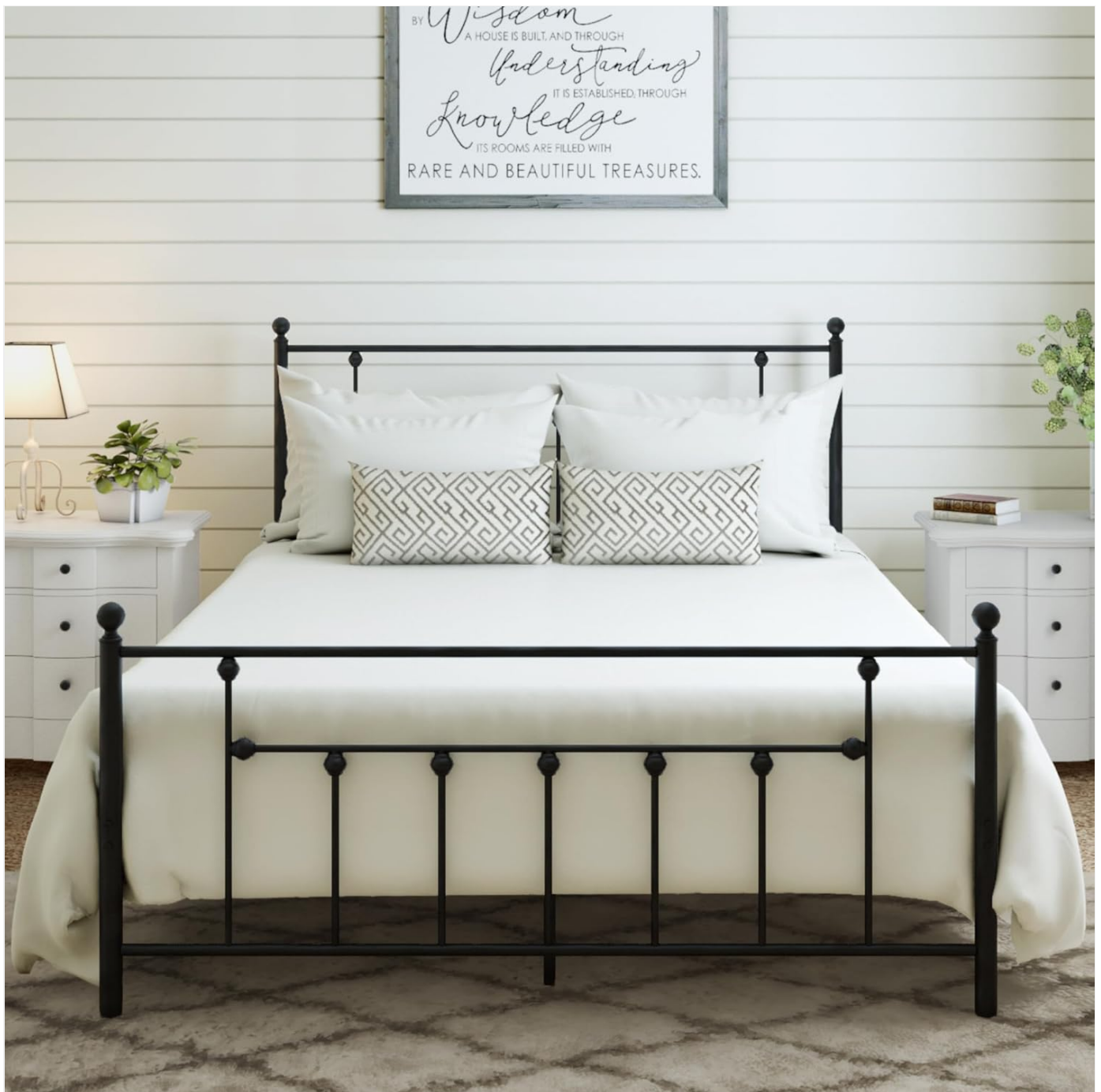
Image 1.1: Fully assembled AMBEE21 Golden Gate Beds Victorian Style Full Metal Platform Bed Frame in black finish.