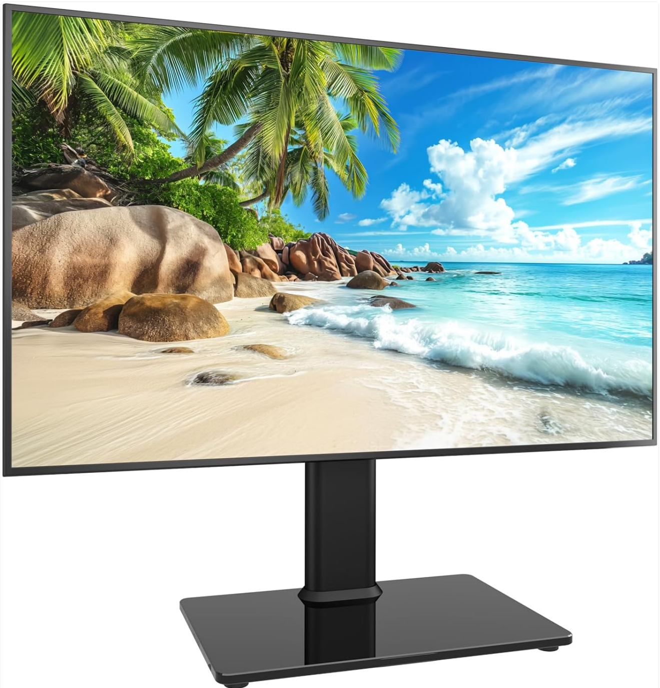
Figure 1: Hemudu HT07B-002P Universal Swivel Tabletop TV Stand.