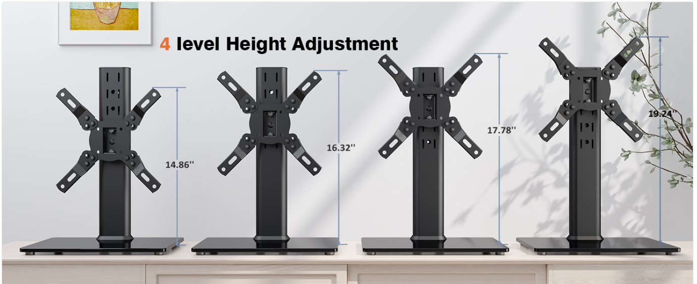
Figure 5: Illustration showing the 4 adjustable height levels of the TV stand.

The stand offers 4 levels of height adjustment. To adjust the height, loosen the screws on the VESA mounting plate that secure it to the main column. Carefully raise or lower the TV to the desired height, then re-tighten the screws securely. Ensure the TV is level after adjustment.