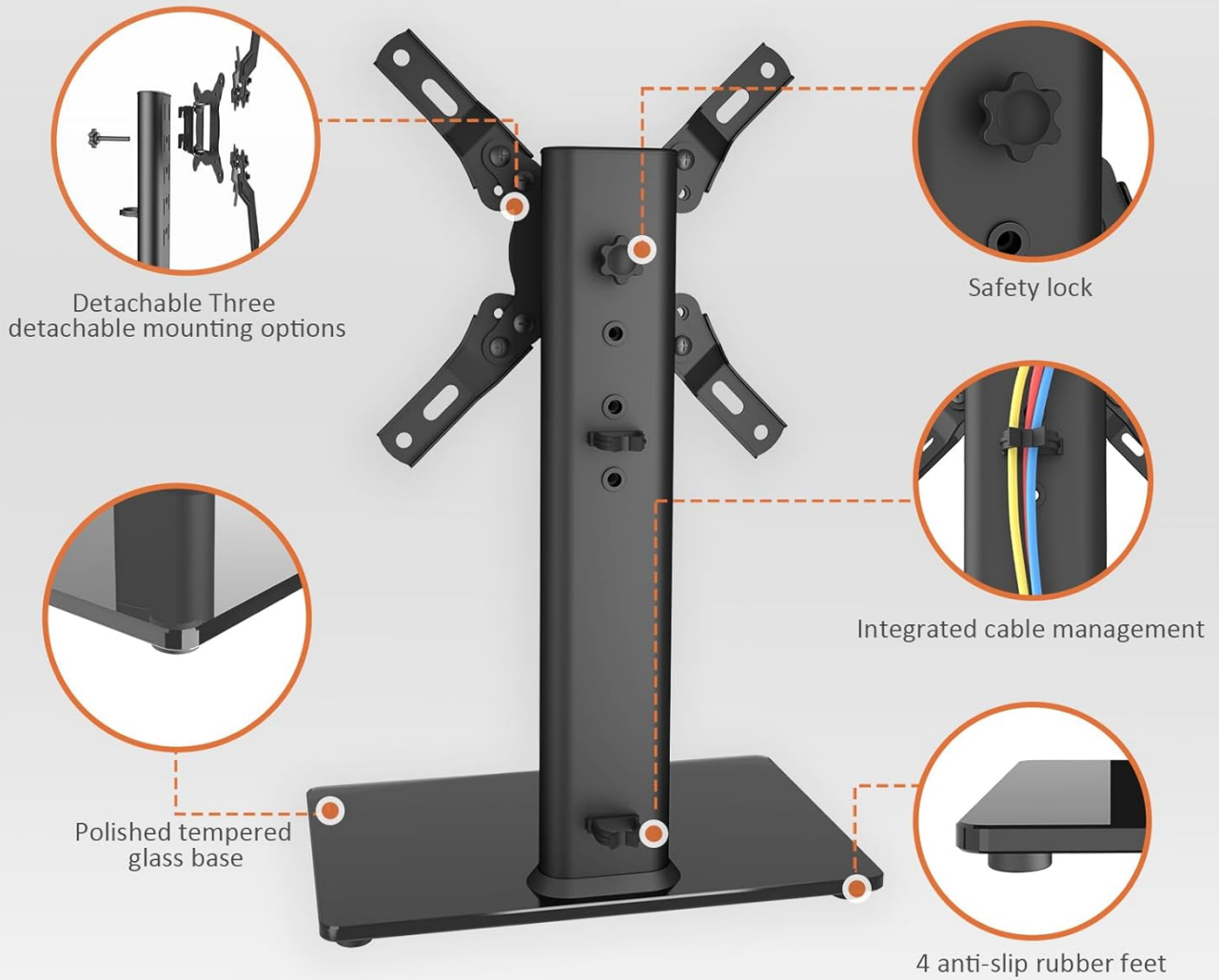
Figure 2: Key components of the TV stand, including the polished tempered glass base, safety lock, integrated cable management, and anti-slip rubber feet.

Made of High-quality Materials, with Cable Management System & Anti-slip Feet