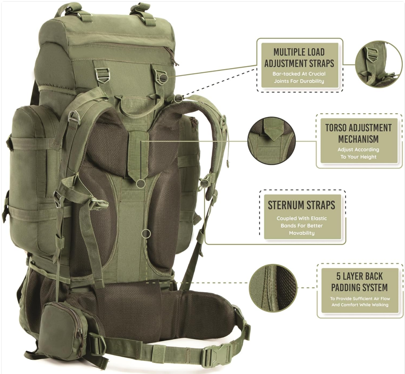
Image: Rear view of the rucksack highlighting the torso adjustment mechanism and padded back system.

The Colonel Rucksack features a torso adjustment mechanism to fit various body heights. Adjust the shoulder strap anchor points up or down to ensure the hip belt rests comfortably on your iliac crest (hip bones).