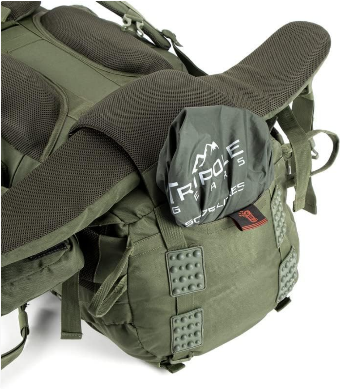
Image: The base of the rucksack with the rain cover partially pulled out from its storage pocket.