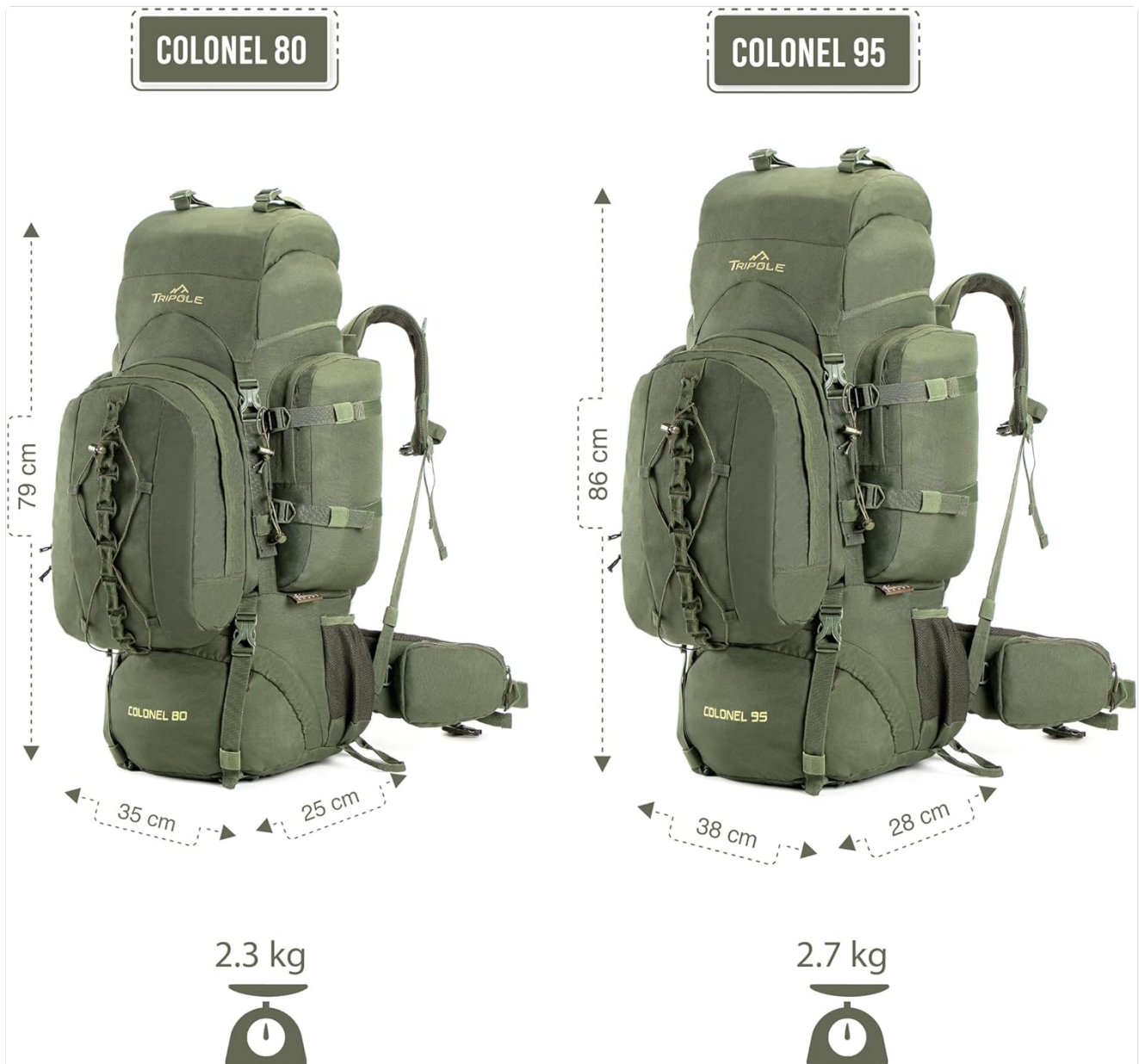
Image: Visual comparison of the Colonel 80 Litres and Colonel 95 Litres models, showing their respective dimensions and weights.