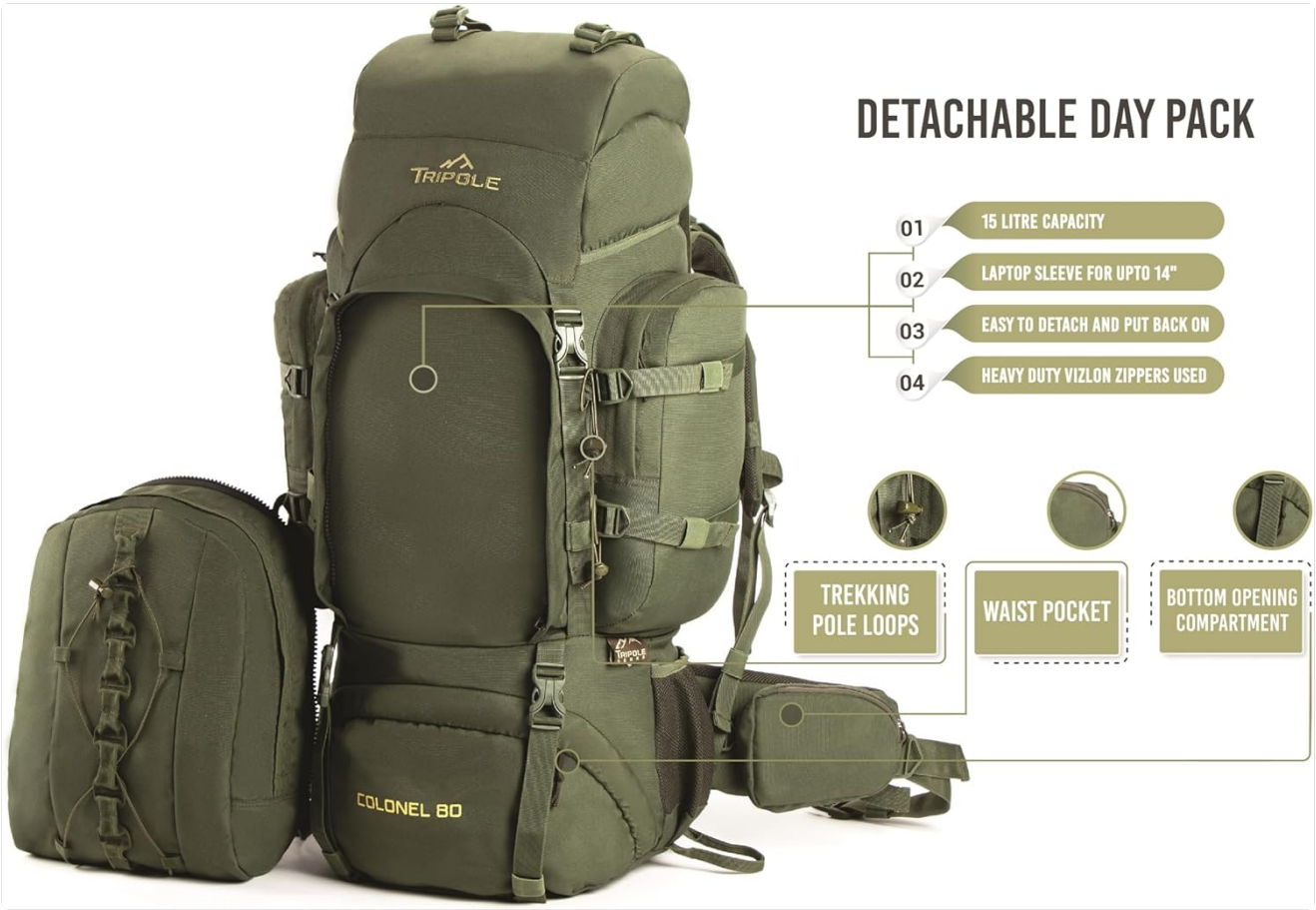
Image: The main rucksack alongside its detached day pack, illustrating the modular design.