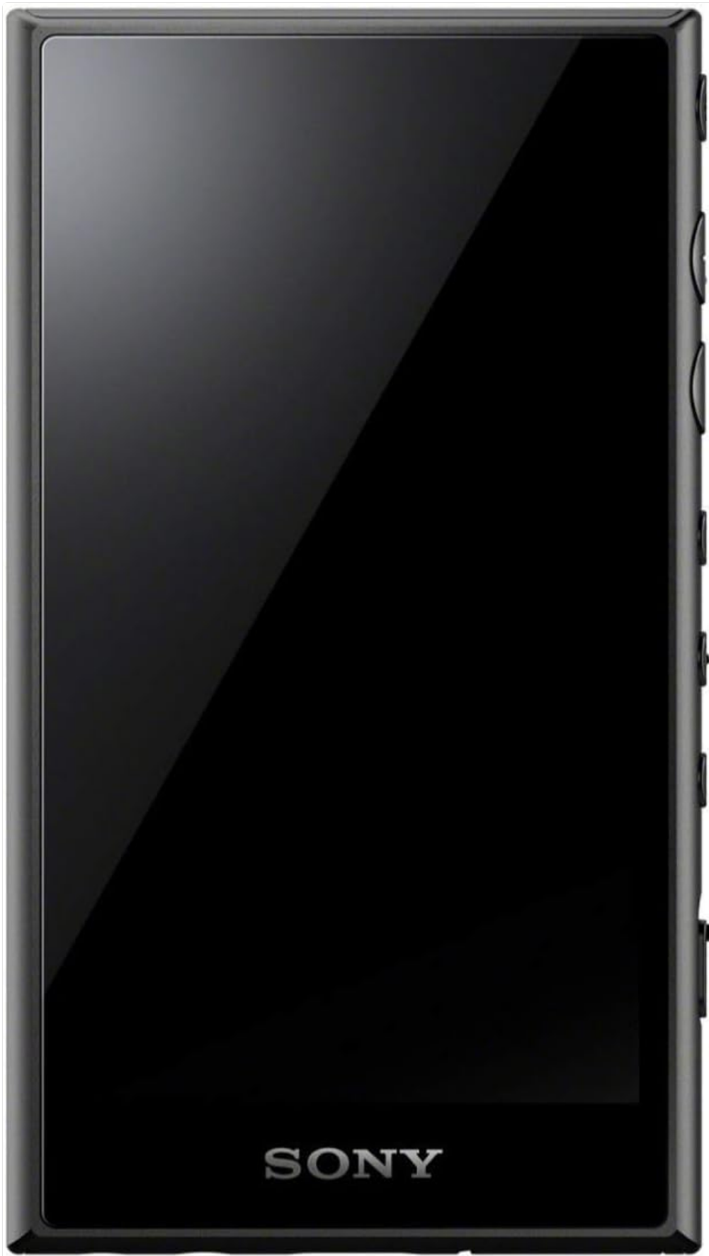
Front view of the NW-A105, featuring its touchscreen display.