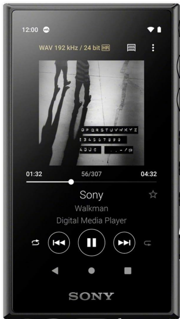
Music playback interface on the Walkman screen.