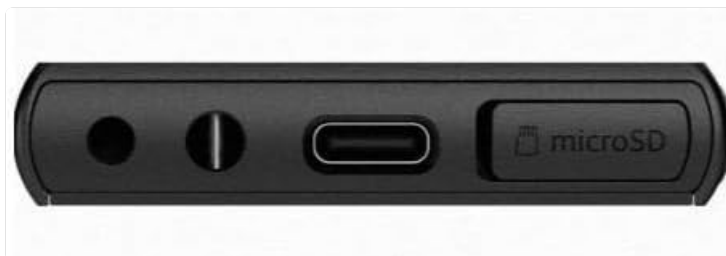
Bottom ports: headphone jack, USB-C, and microSD slot.