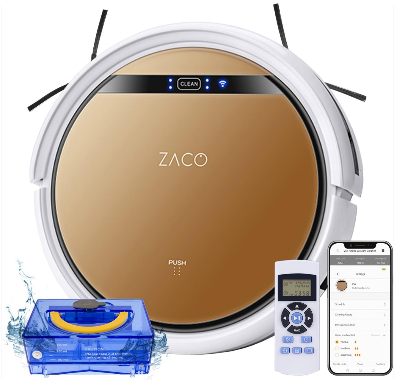
Image: A detailed view of the ZACO V5x robot vacuum cleaner from above, showcasing its sleek design, along with its remote control, water tank, and a smartphone displaying the ZACO Home app interface.