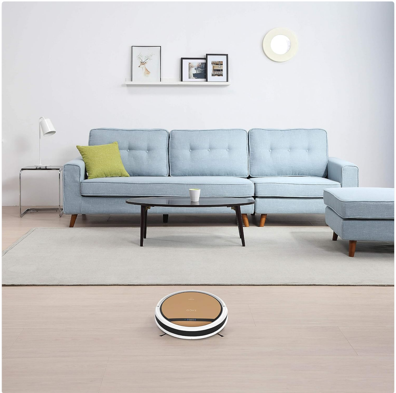
Image: The ZACO V5x robot vacuum cleaner is shown actively cleaning a light-colored hard floor in a modern living room setting, demonstrating its ability to navigate open spaces.