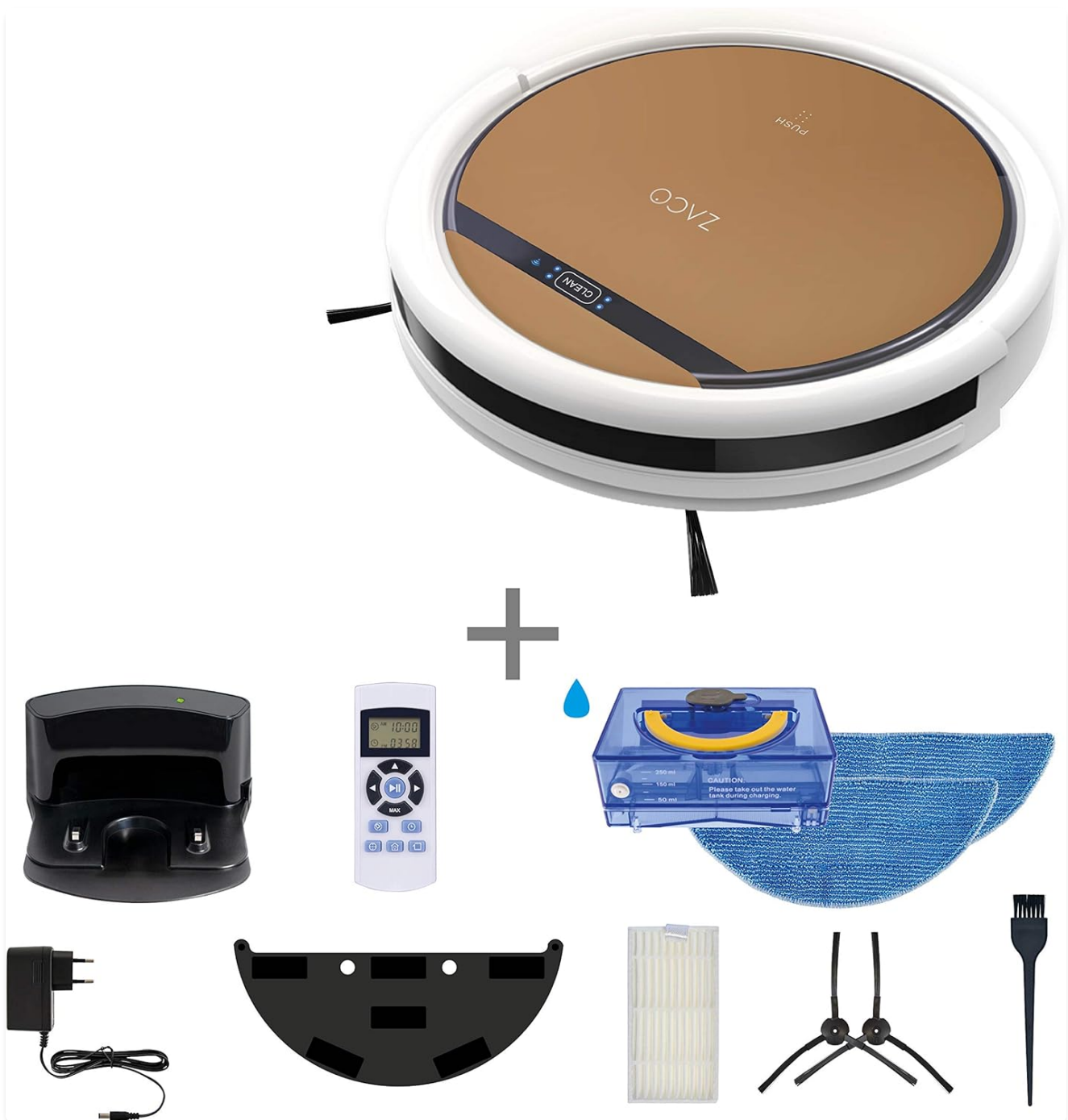
Image: The ZACO V5x robot vacuum cleaner with all its included accessories laid out, such as the charging station, remote control, water tank, mop cloths, and cleaning tools.