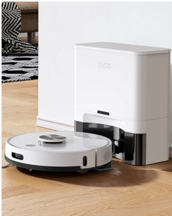
Image: The ZACO V5x robot vacuum cleaner is shown charging at its dock, with an overlay indicating its 120-minute operating time and power specifications (22W, 2400mAh).