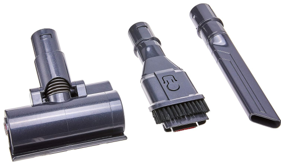
Figure 3: A selection of accessory brushes, including the long brush (crevice tool) and square brush (upholstery tool), for specialized cleaning tasks.