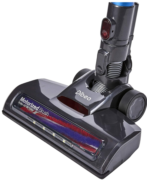
Figure 2: The motorized brush head, featuring a roller brush and LED lights for enhanced visibility during cleaning.