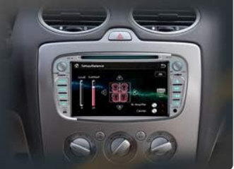
Figure 1.1: Applicable Ford models for the AWESAFE car radio. Please verify your vehicle's model and year for compatibility.

For Ford/Mondeo 2008-2011 For Ford/Focus 2008-2011 For Ford/S-Max 2008-2011 For Ford/C-Max 2008-2011 For Ford/Galaxy 2010-2012