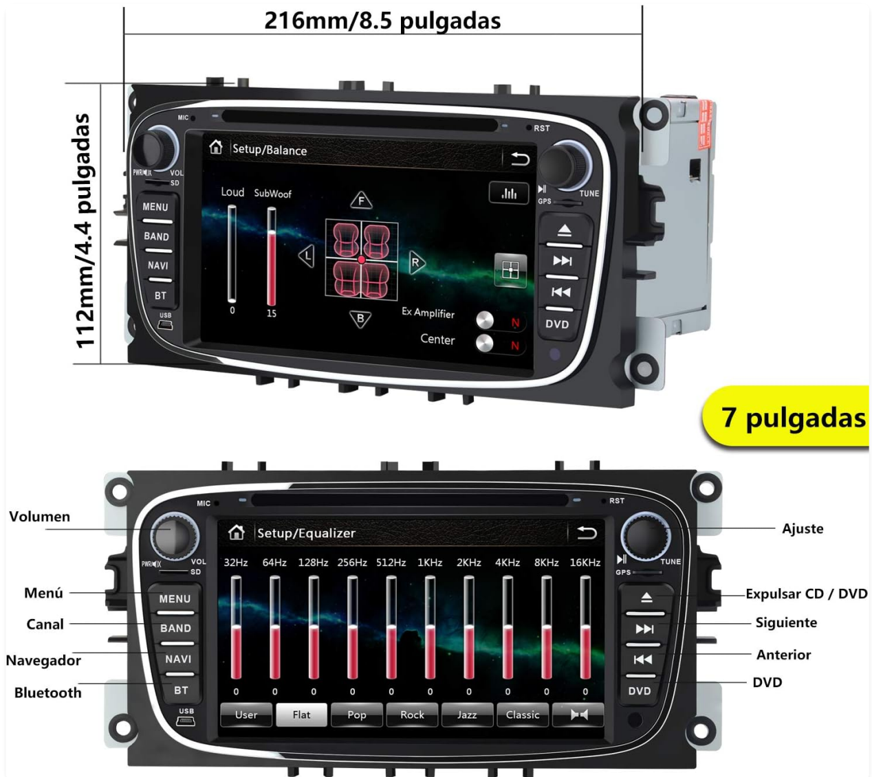
Figure 3.1: Front panel controls and equalizer interface. The unit features a 7-inch display.

This section details the primary functions and controls of your AWESAFE car radio.