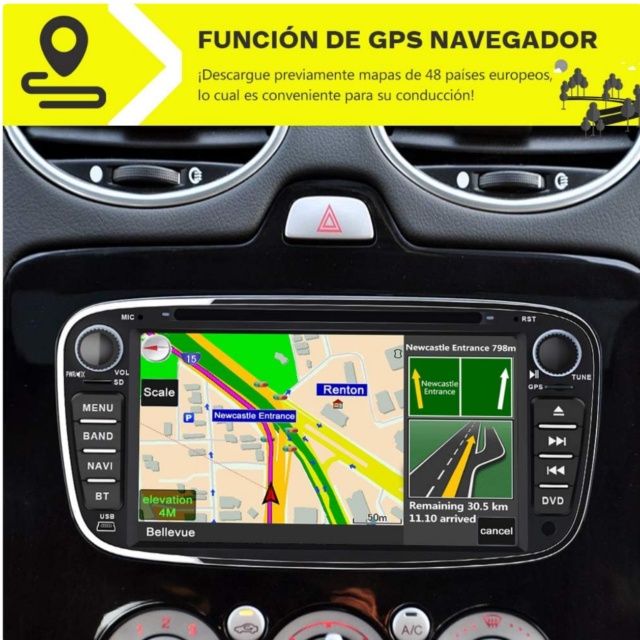
Figure 3.3: GPS navigation display. Features pre-loaded maps and route guidance.