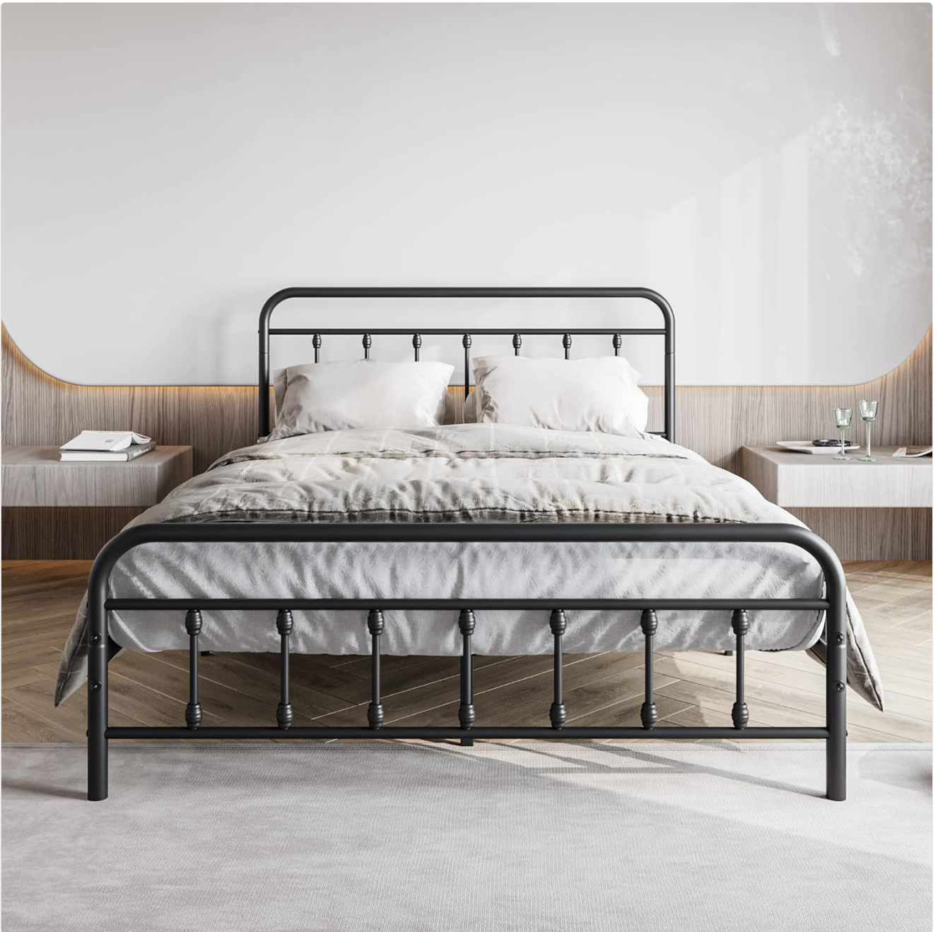
Image: Elegant Home Products Vintage Queen Size Metal Bed Frame with mattress and bedding in a bedroom setting.