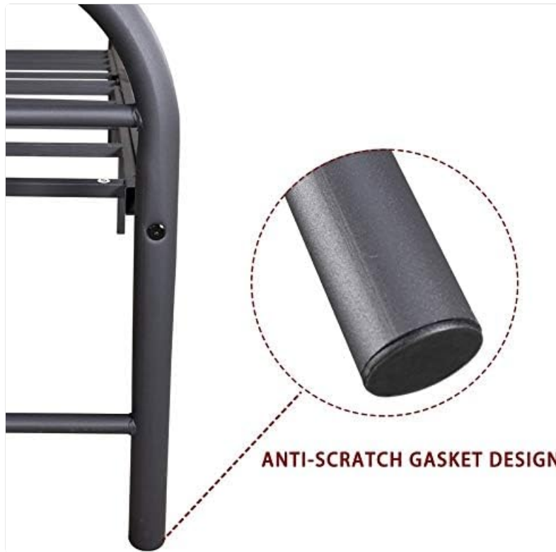
Image: Close-up of the anti-scratch gasket design on a bed frame leg.