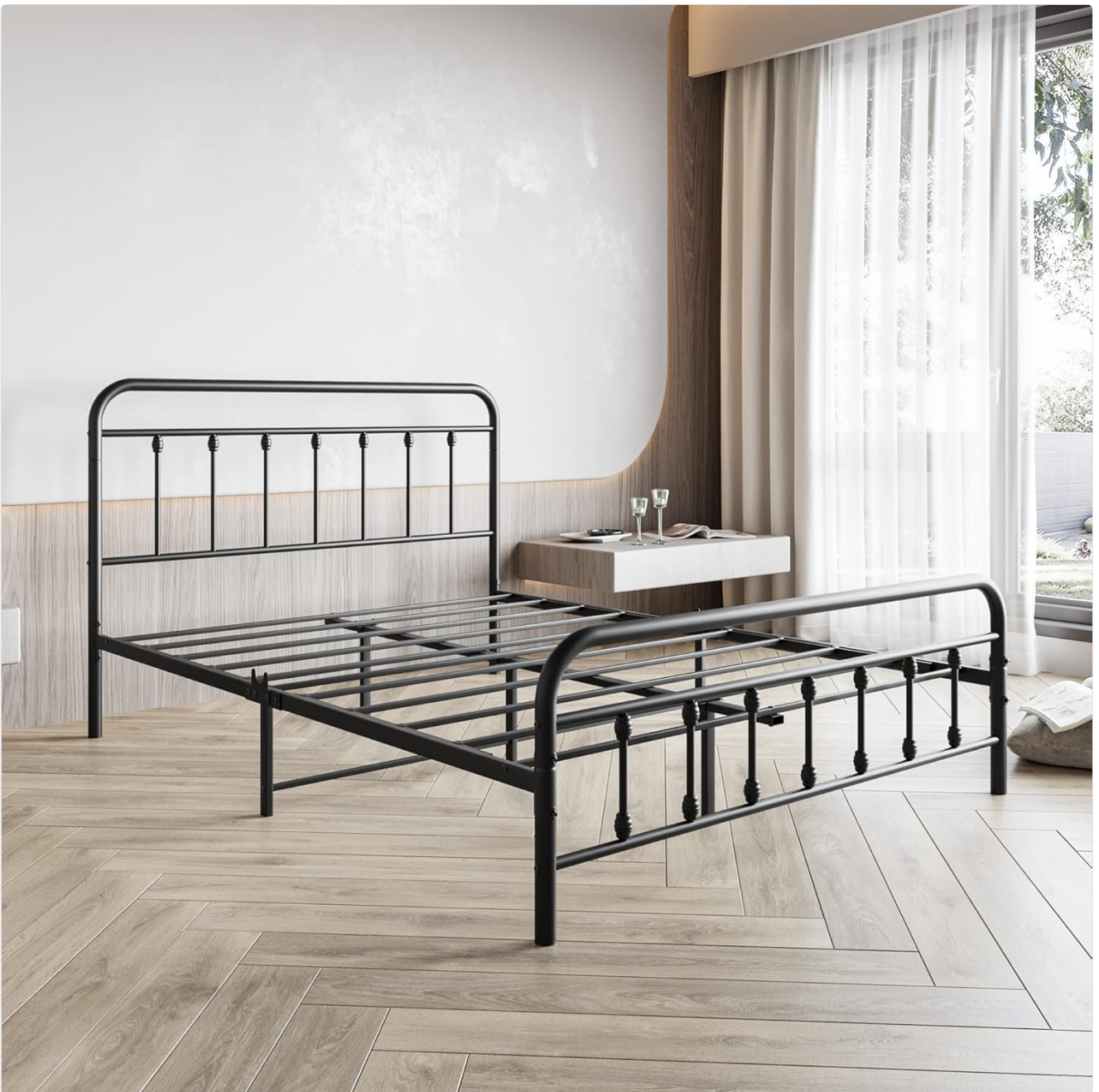
Image: Assembled Elegant Home Products Vintage Queen Size Metal Bed Frame without mattress.

For detailed visual guidance, refer to the step-by-step diagrams provided in your product's assembly manual.