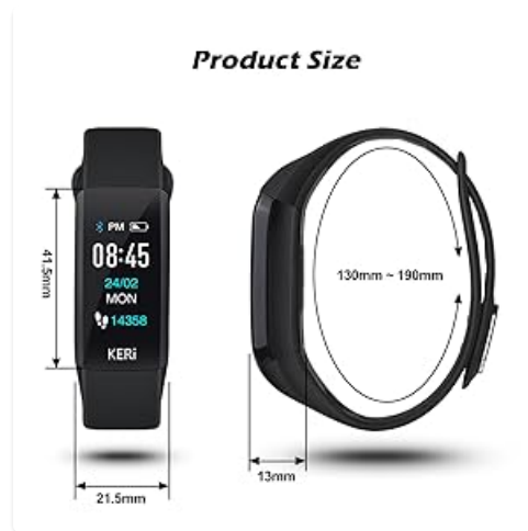
Image: A diagram illustrating the dimensions of the Audar Smart Band KERi, including screen size and band length.