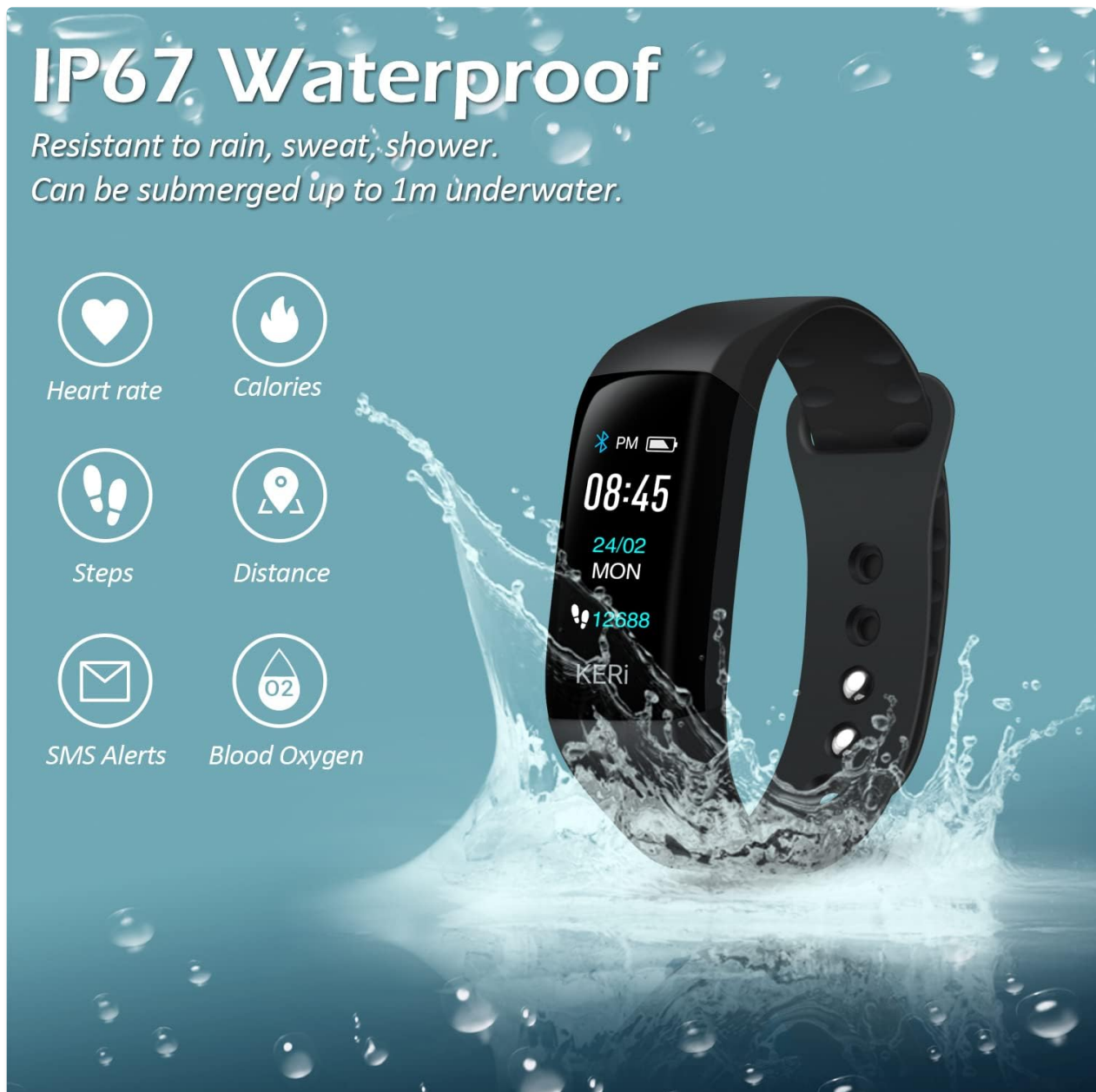
Image: The Audar Smart Band KERi being splashed with water, illustrating its IP67 waterproof capability. Icons for heart rate, calories, steps, distance, SMS alerts, and blood oxygen are also visible.

The Audar Smart Band KERi is IP67 waterproof.