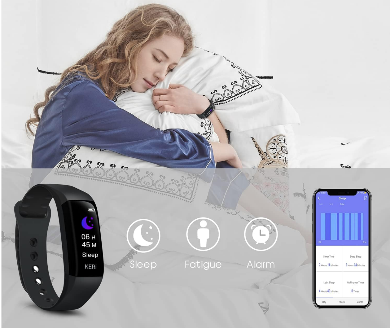
Image: A person sleeping with the Audar Smart Band KERi on their wrist, showing the band's display indicating sleep duration and an accompanying smartphone app displaying sleep analysis.

Sleep quality and fatigue state management