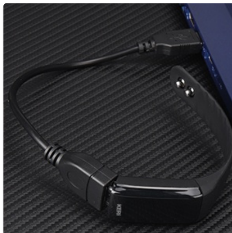
Image: A detailed view of the Audar Smart Band KERi's integrated USB charging port, showing how it connects to a power source.