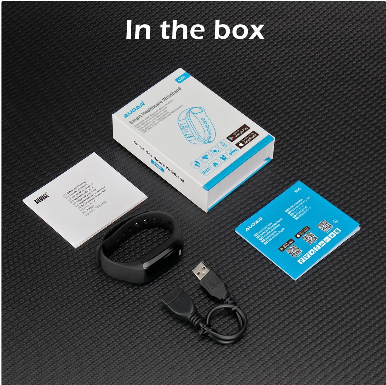
Image: The contents of the Audar Smart Band KERi product box, showing the smart band, charging cable, and instruction manuals.

For detailed warranty information regarding your August Audar Smart Band KERi, please refer to the warranty card included in your product packaging or visit the official August website. Warranty terms and conditions may vary by region and retailer.