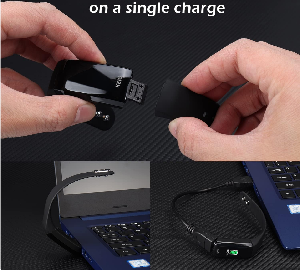
Image: The Audar Smart Band KERi being plugged into a USB port for charging. The image highlights the integrated USB connector on the device.