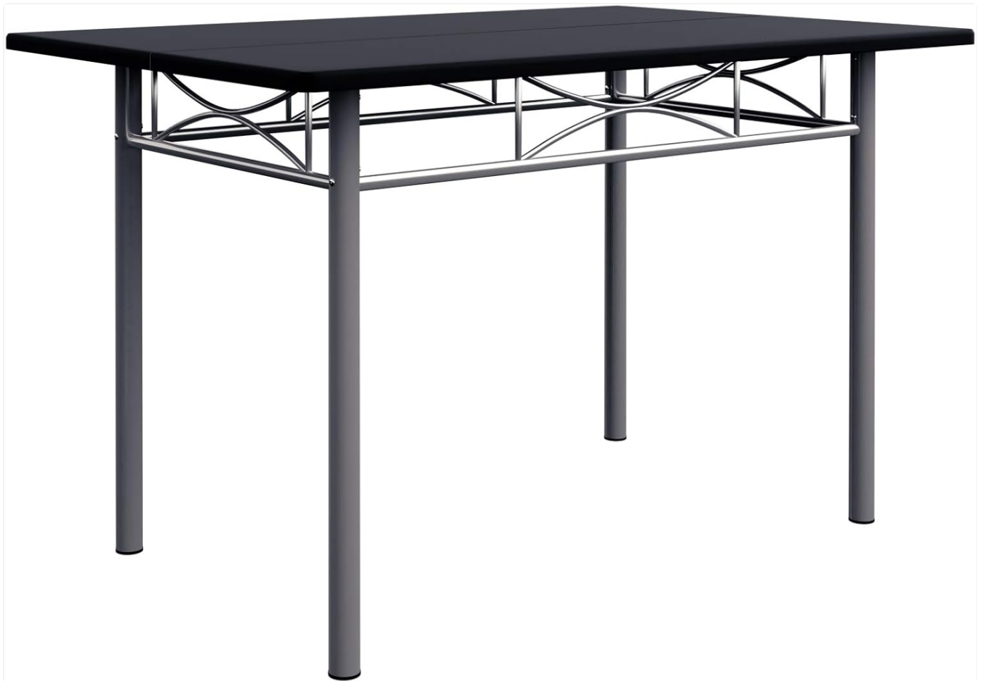
Image 4.1: The Casaria Paul dining table, showing its black MDF top and silver-colored powder-coated steel frame with decorative cross-bracing.