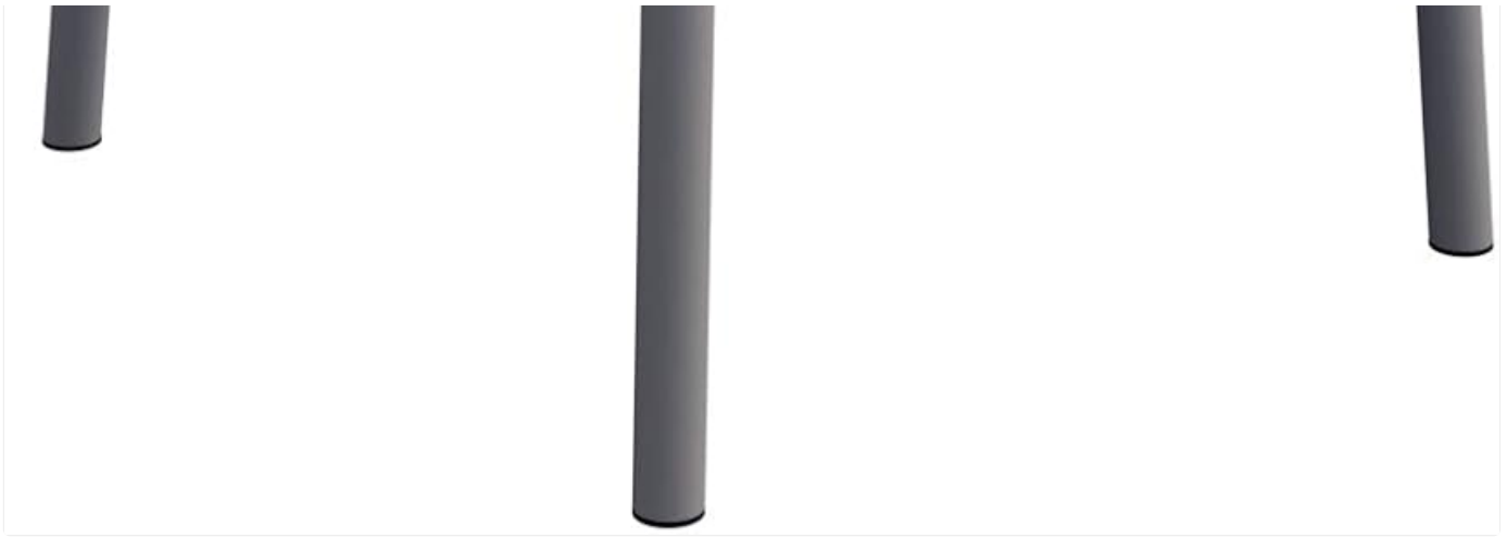
Image 4.2: A single Casaria Paul dining chair, highlighting its black MDF seat and silver-colored powder-coated steel frame with decorative backrest and leg bracing.