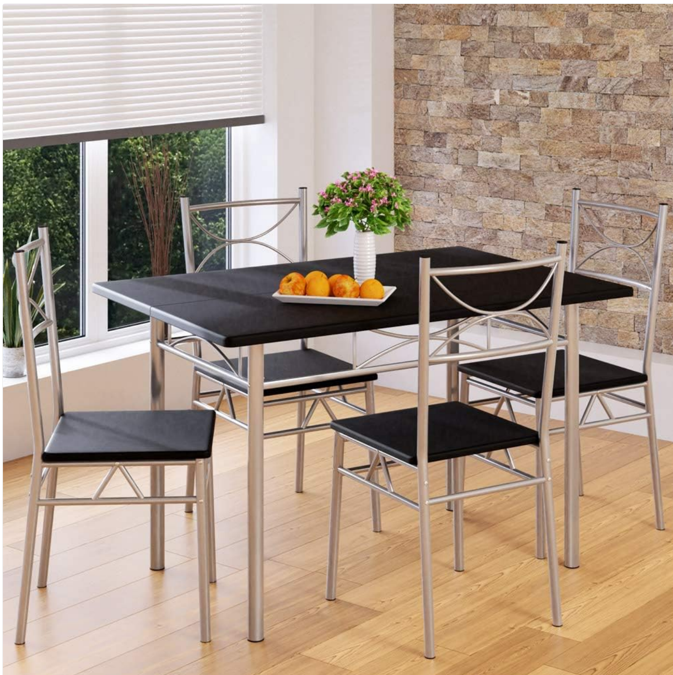
Image 1.1: The Casaria Paul Dining Set, featuring a black table and four chairs with silver-colored metal frames, placed in a modern dining room setting.