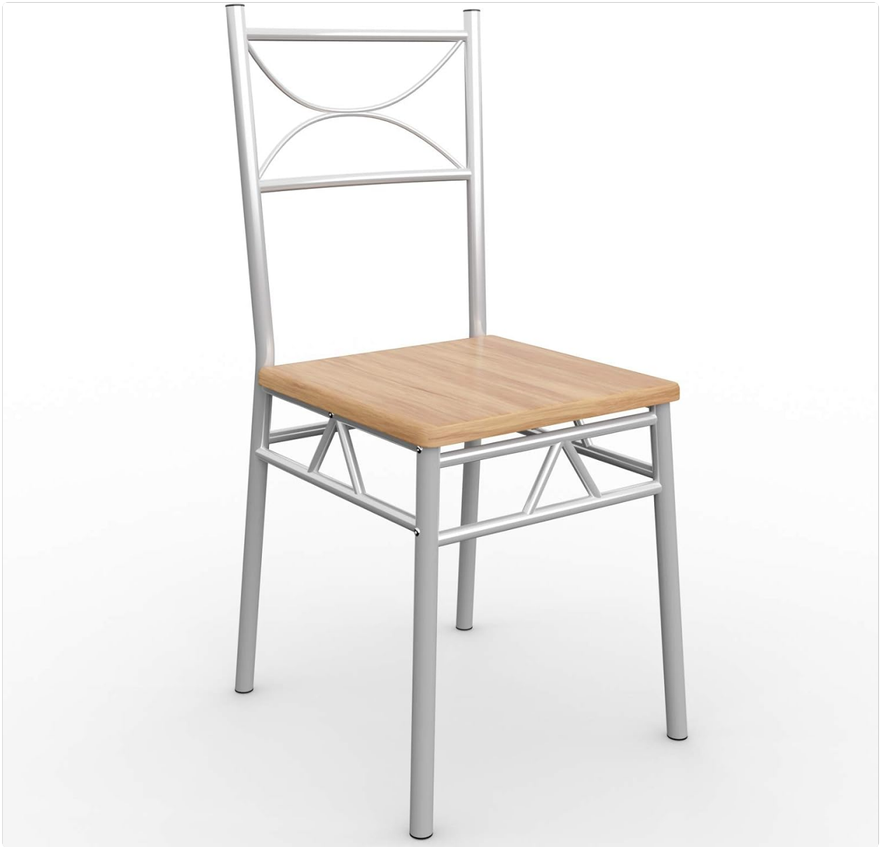
Image: Detail of a single Casaria Paul dining chair, showcasing its Faggio seat and metal frame design.