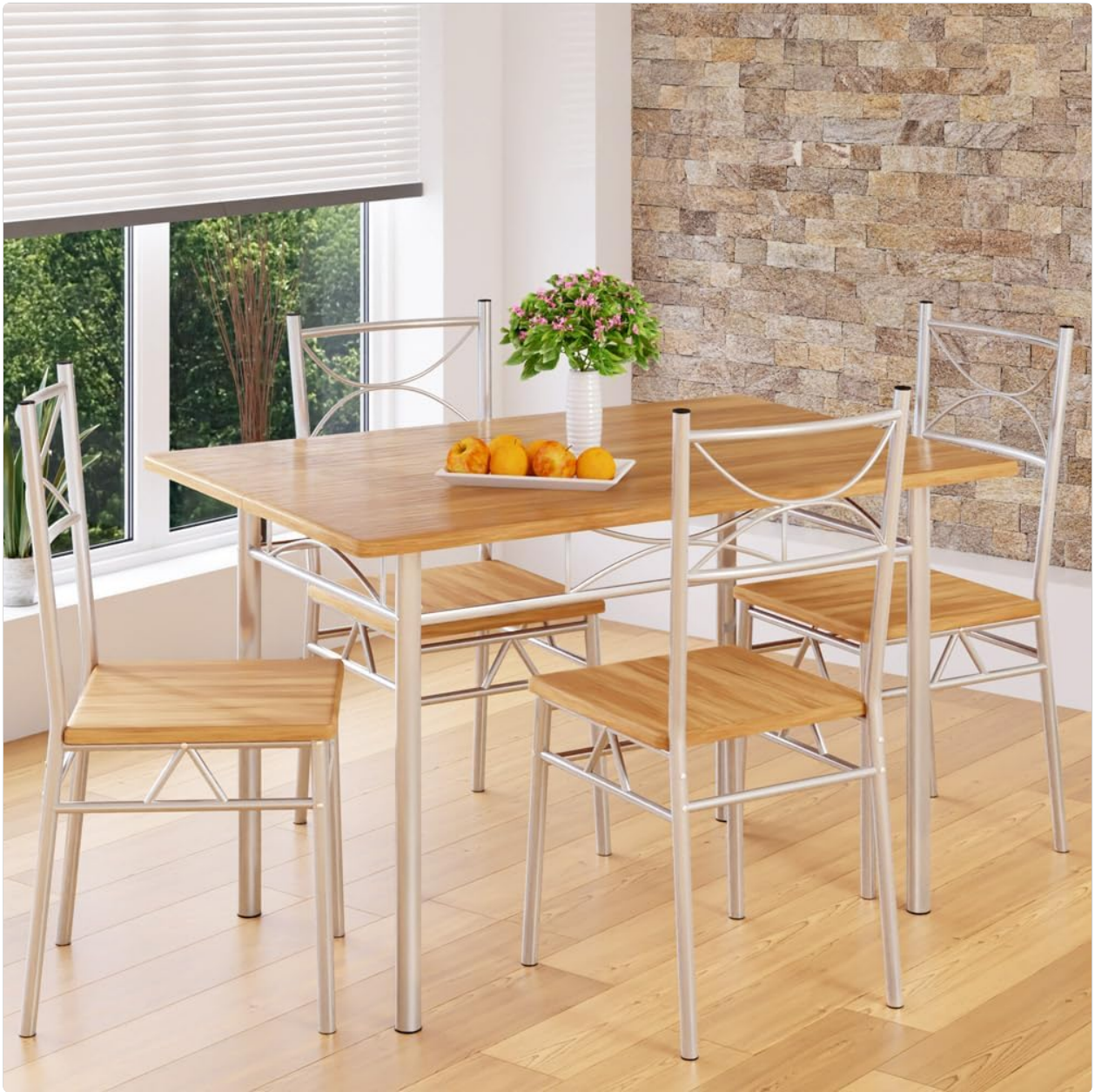
Image: The Casaria Paul Set, featuring a rectangular Faggio-colored table and four matching chairs with metal frames, arranged in a contemporary dining space.