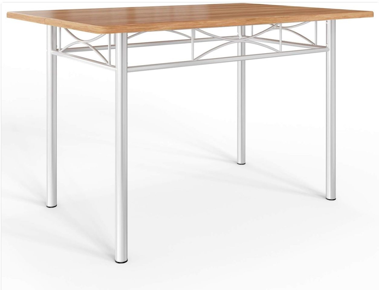
Image: Detail of the Casaria Paul dining table, highlighting the Faggio tabletop and the metal frame structure.