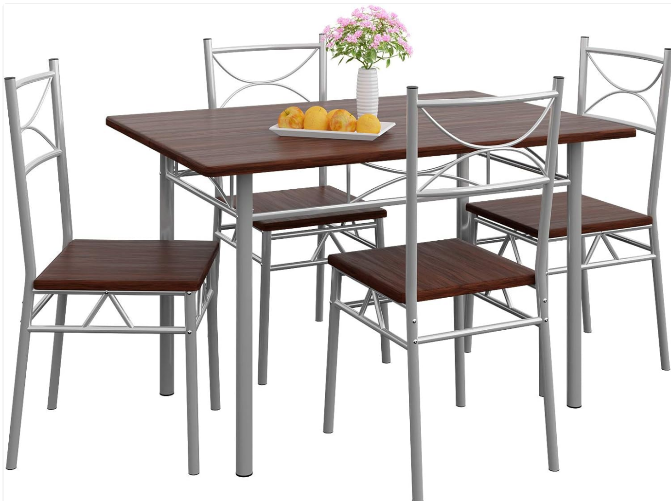
Image: The Casaria Paul 5-Piece Dining Table Set, featuring a rectangular table and four matching chairs, presented in a

This manual provides detailed instructions for the assembly, use, and maintenance of your Casaria Paul 5-Piece Dining Table Set. This set includes one dining table and four chairs, designed for use in kitchens, dining rooms, or conservatories. Please read these instructions carefully before assembly and retain them for future reference.