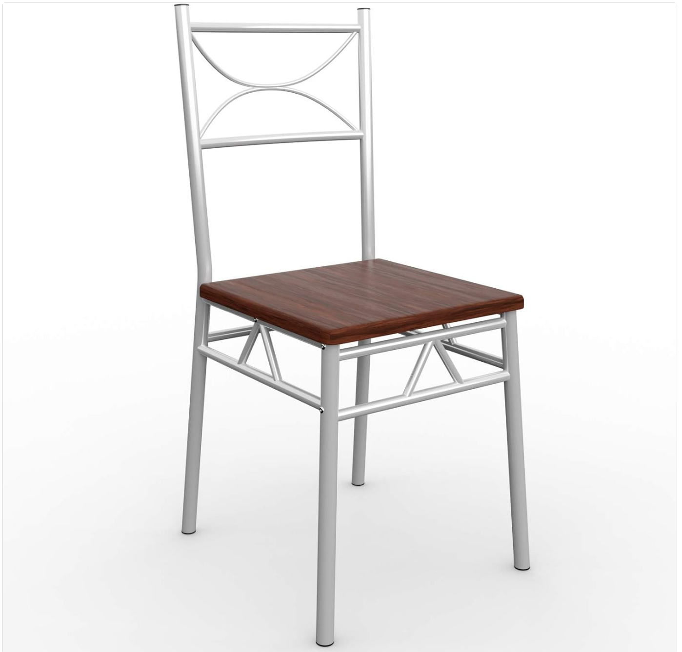
Image: A single Casaria Paul dining chair, showcasing its dark oak seat and the distinctive silver-colored metal frame with decorative backrest.