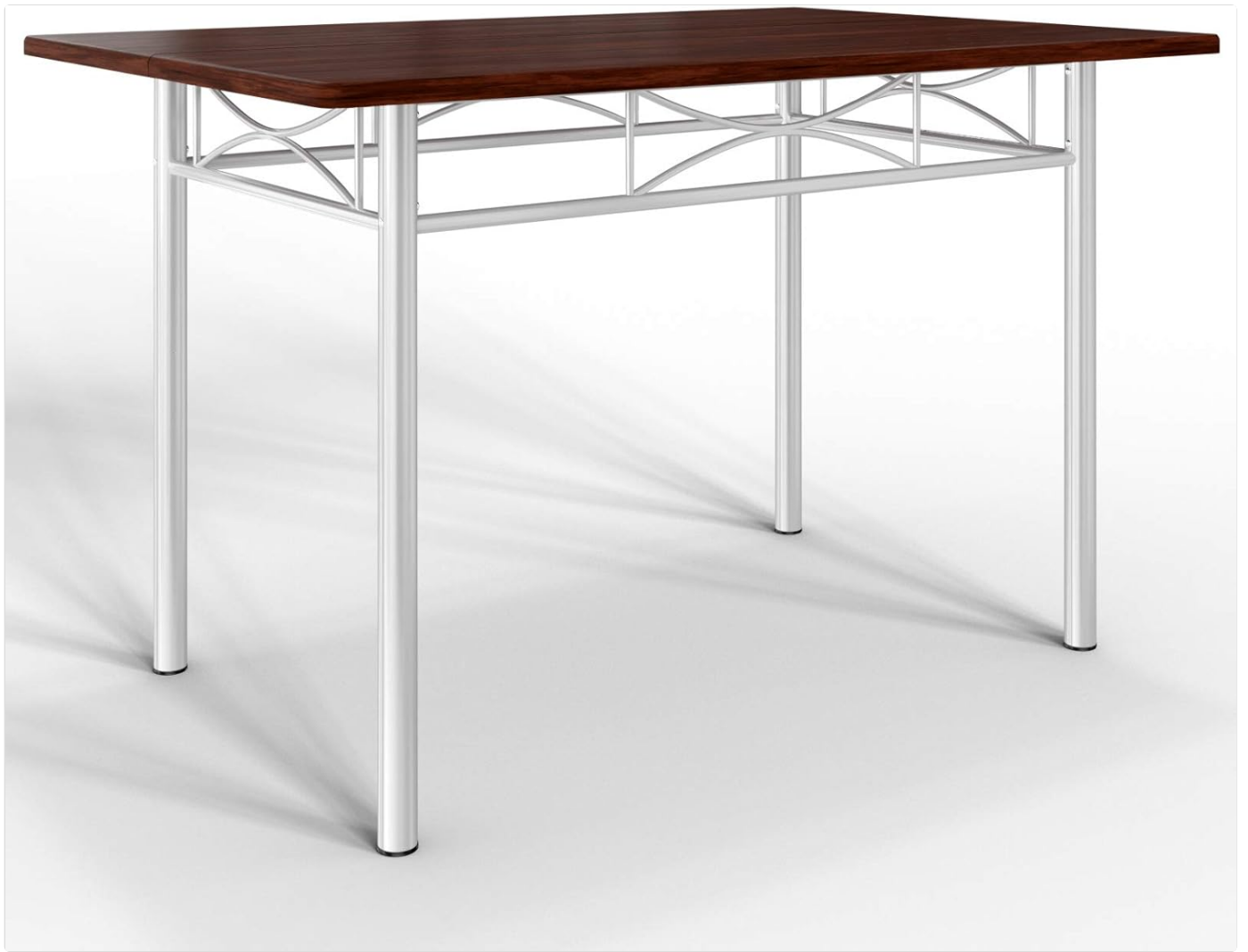
Image: A detailed view of the Casaria Paul dining table, highlighting the dark oak finish of the tabletop and the intricate design of the silver-colored metal frame beneath.