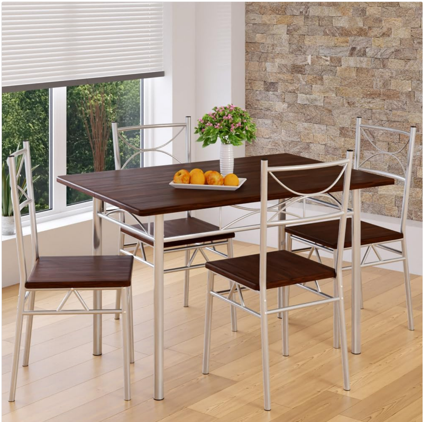
Image: The Casaria Paul dining table set positioned in a modern kitchen or dining area, demonstrating its compact size and aesthetic integration into a home environment.