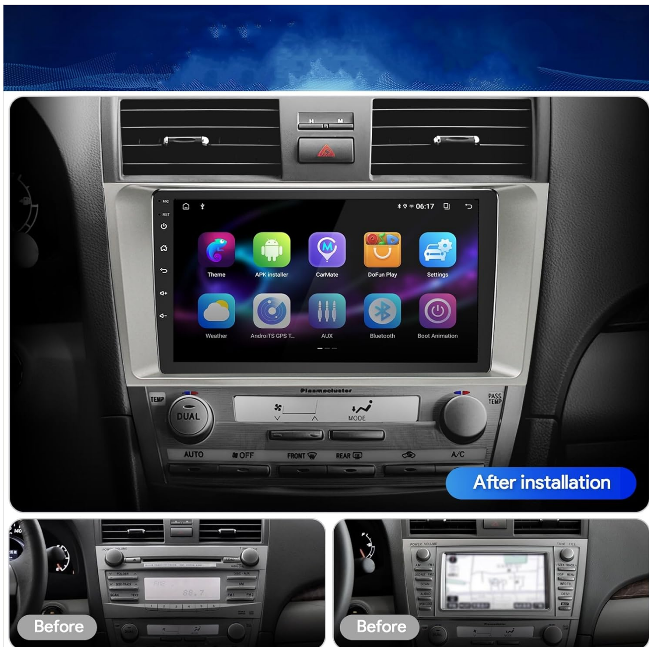
Figure 2.3: Before and after installation view of the BINIZE Car Stereo in a Toyota Camry.