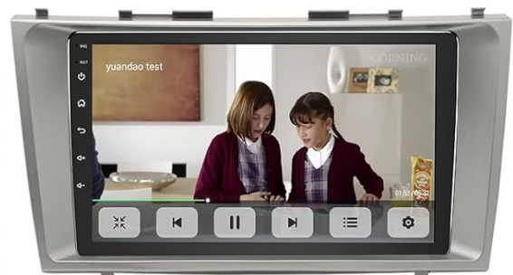
Figure 3.6: Music and Video playback interfaces.

Support movie playback, you can download your favorite movies in advance