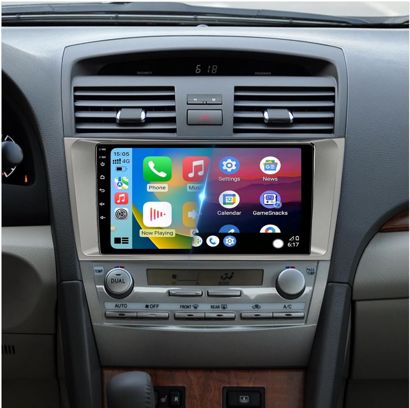
Figure 2.2: BINIZE Car Stereo installed in a compatible Toyota Camry dashboard.