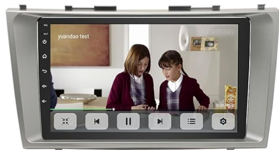
Figure 3.1: Main interface of the BINIZE Android 13 Car Stereo.

Support movie playback, you can download your favorite movies in advance