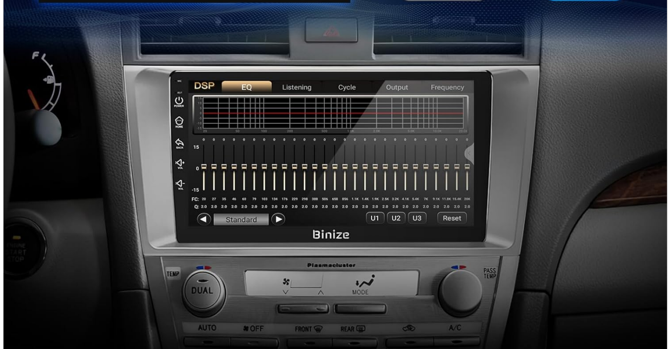
Figure 3.7: DSP and Equalizer settings.

Your browser does not support the video tag.