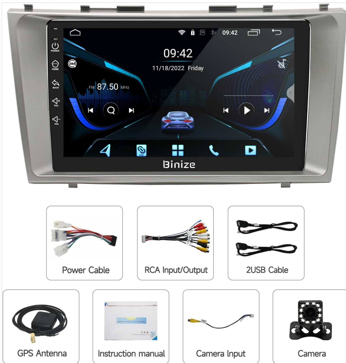
Figure 2.1: Included components of the BINIZE Android 13 Car Stereo.