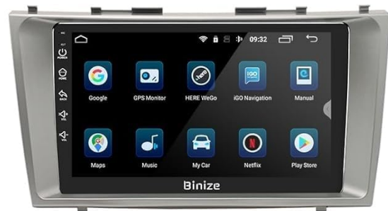
Figure 3.4: GPS Navigation interface.