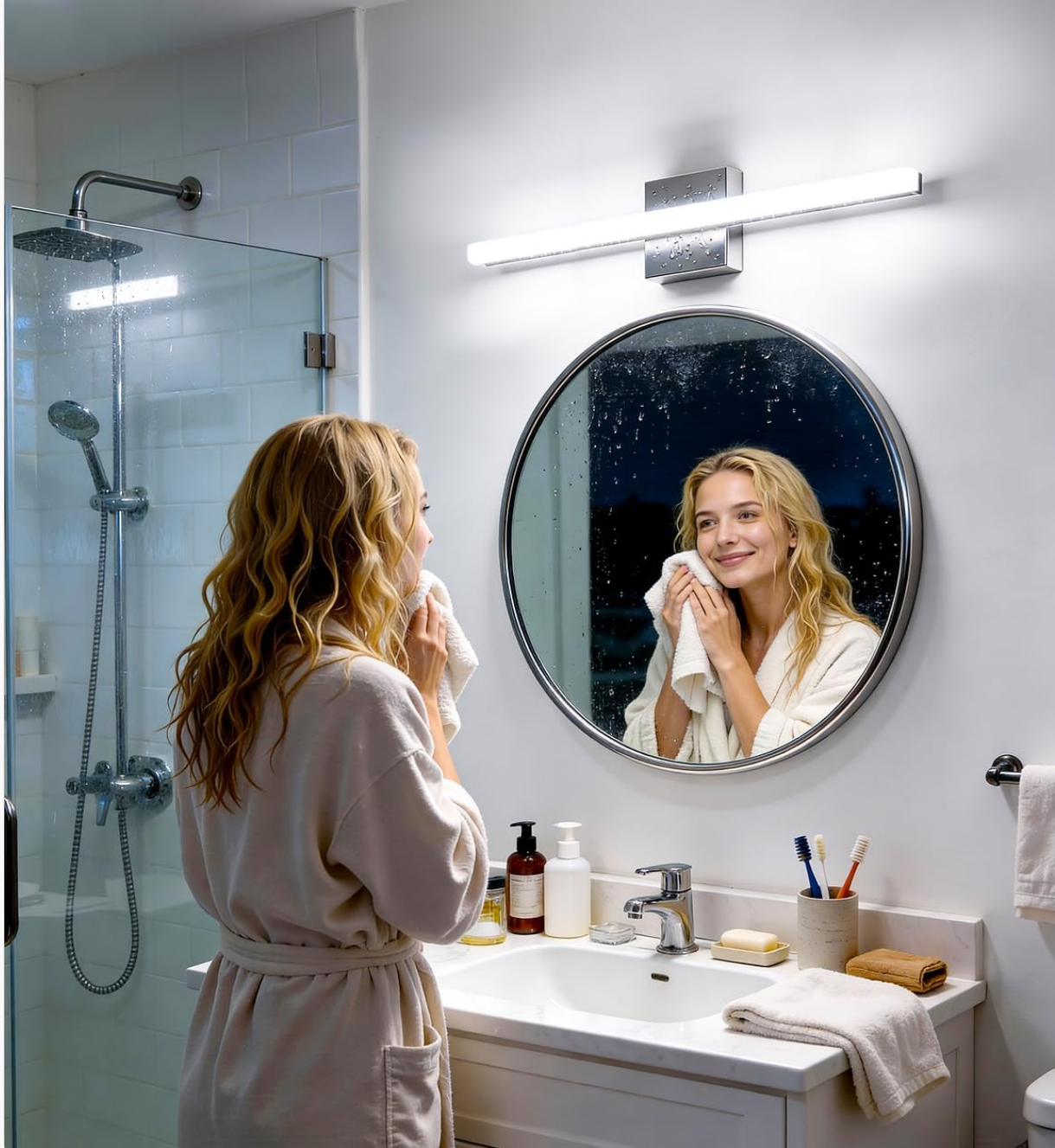
Figure 6: The IP44 splash-proof design ensures durability in wet environments.