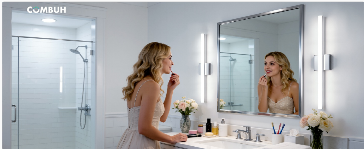
Figure 5: The vanity light provides soft, uniform illumination for daily tasks.

provide a consistent 6000K cool white light.