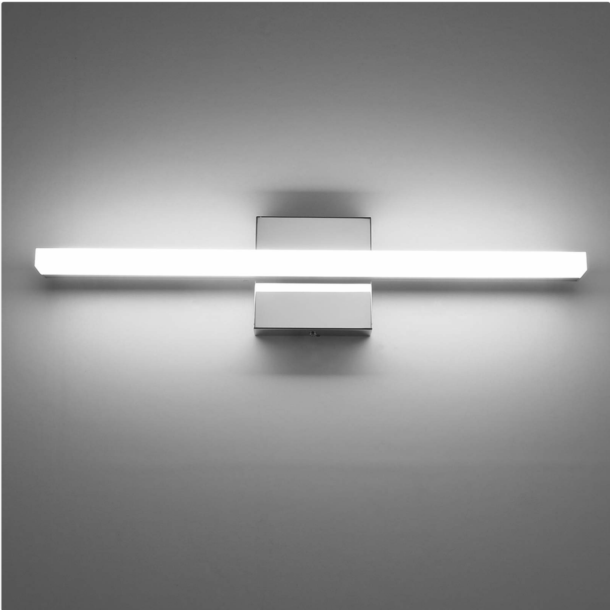
Figure 1: Combuh 24-inch LED Vanity Light Bar.

The Combuh LED Vanity Light Bar is designed to provide modern, cool white illumination for bathrooms and vanity areas. Featuring a sleek design, durable construction, and energy-efficient LED technology, this fixture is suitable for indoor use only.