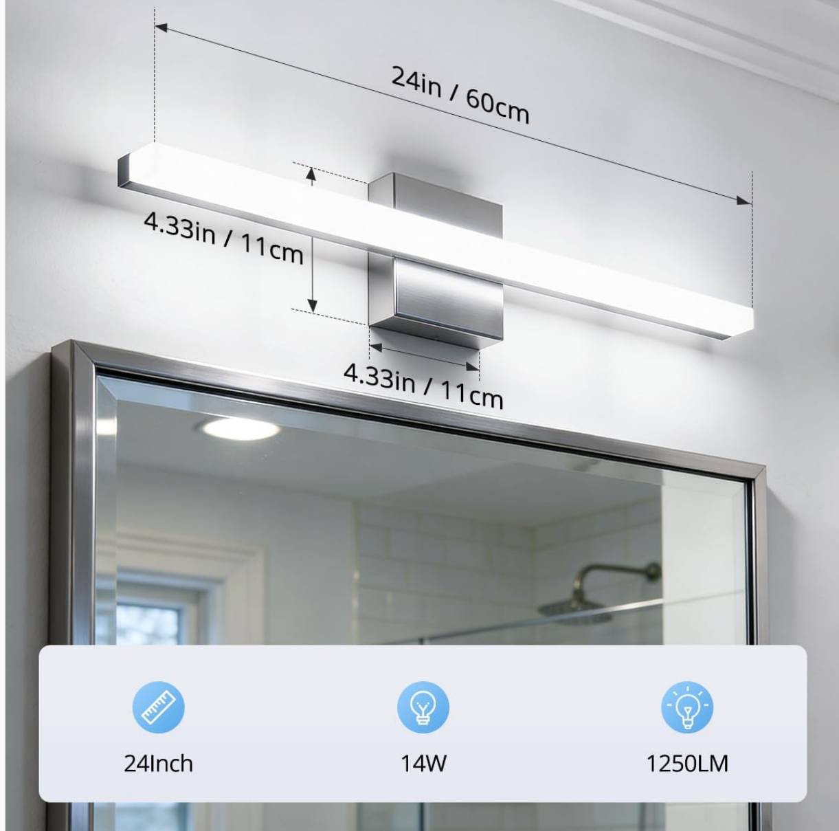
Figure 3: Product dimensions and key specifications.