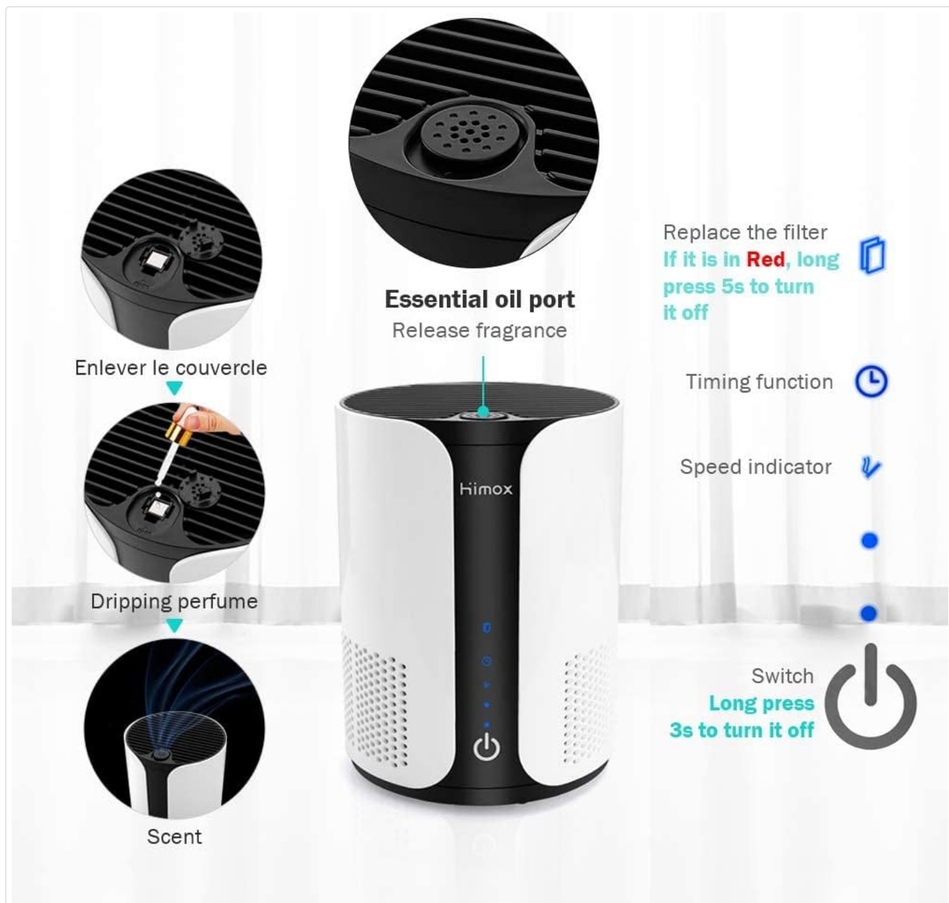
Illustration of how to add essential oils to the dedicated port on the top of the air purifier for aromatherapy.