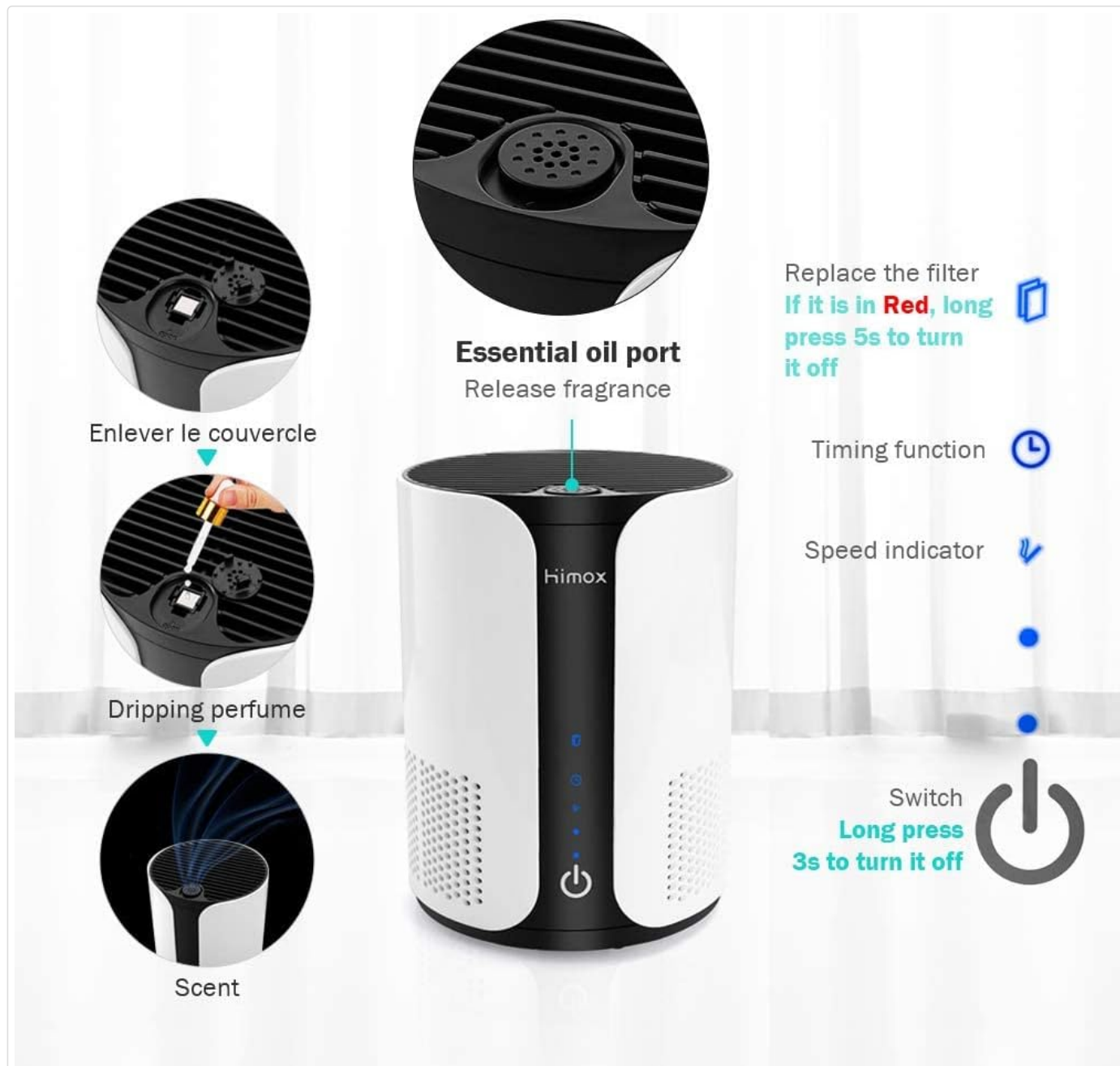
Diagram illustrating the control panel functions including the filter replacement indicator, timing function, speed indicator, and power switch, along with the essential oil port.