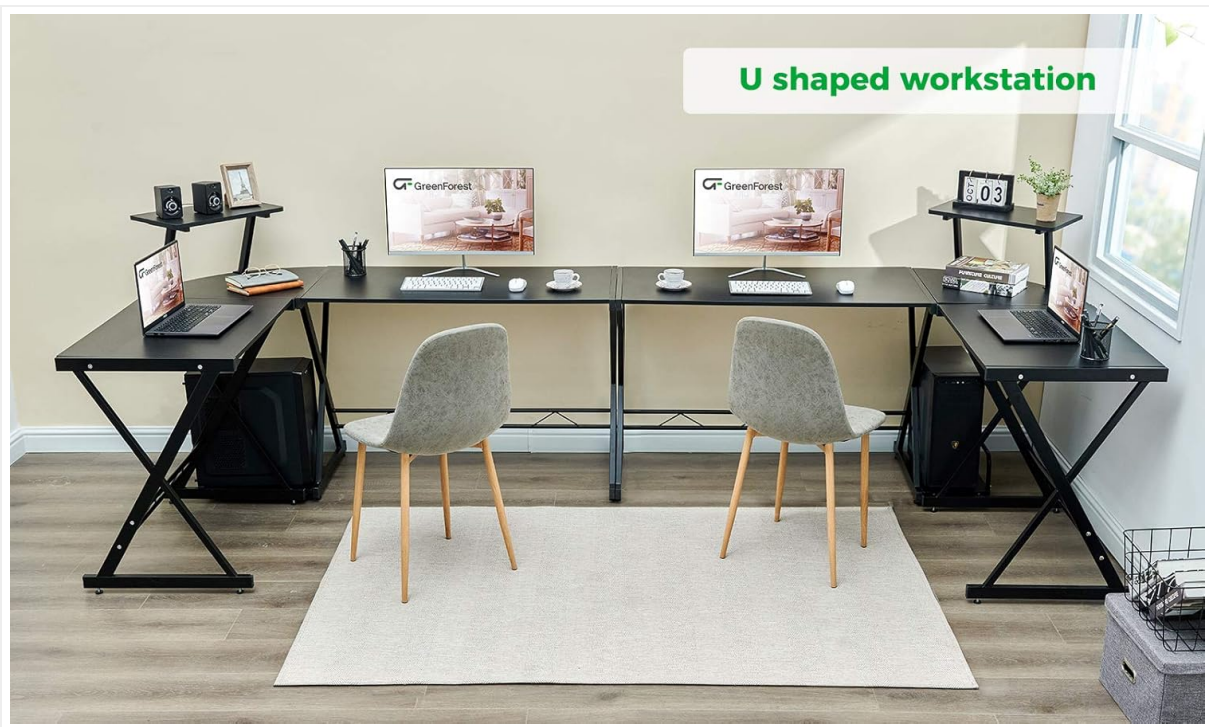
Image: Two GreenForest L-shaped desks combined to form a U-shaped workstation, demonstrating the modularity.