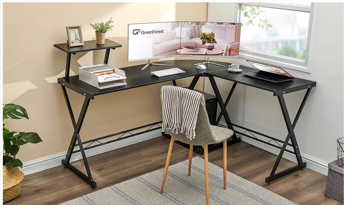
Image: Overview of GreenForest L Shaped Gaming Desk components. Ensure all parts are present before starting assembly.