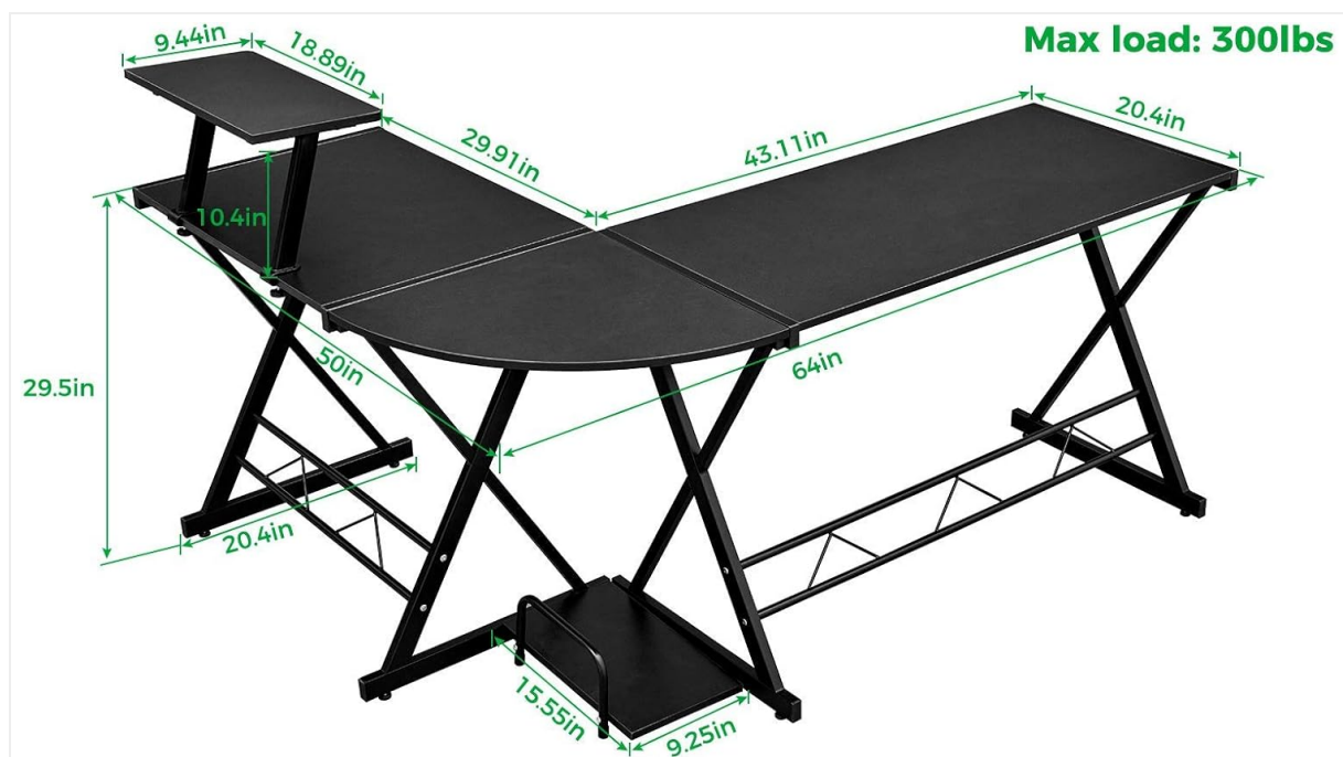
Image: Detailed dimensions of the GreenForest L Shaped Gaming Desk, including the monitor stand and CPU stand.