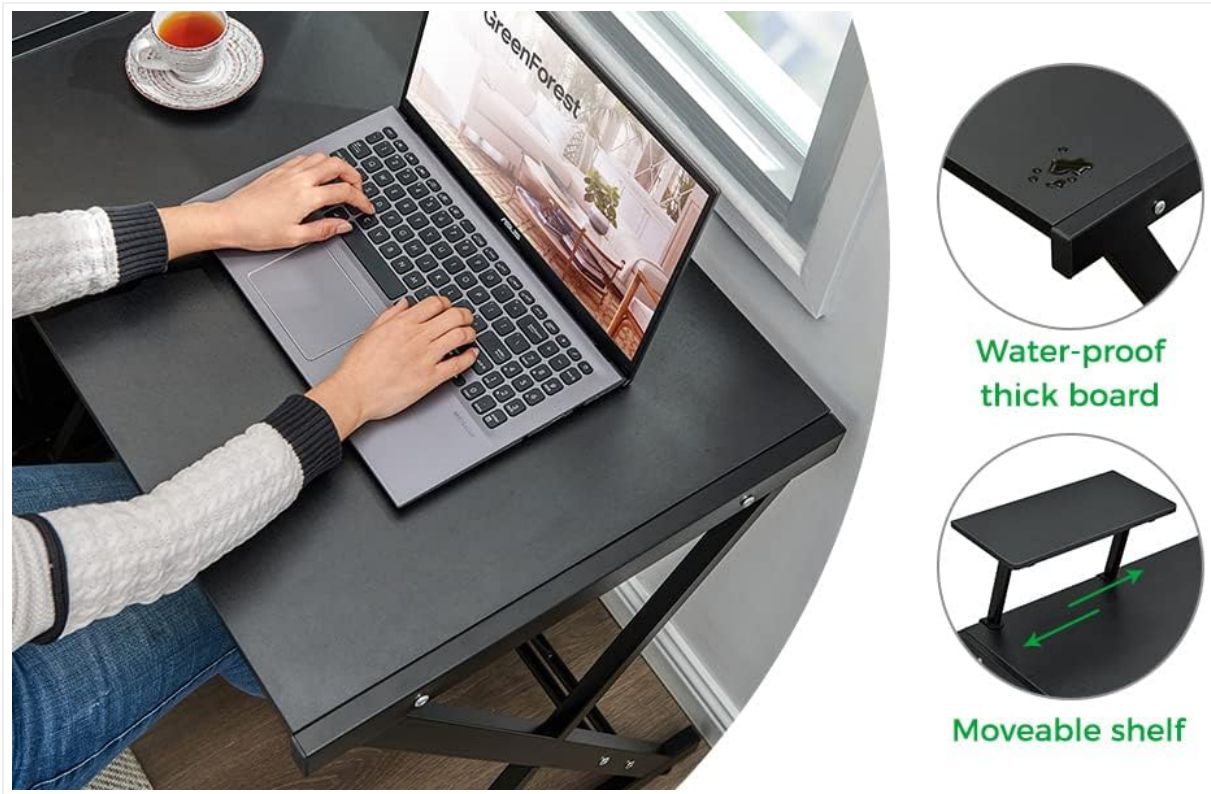
Image: Detail showing the movable monitor shelf and the waterproof thick board material of the desk surface.

Attach the monitor stand to the desired location on the desk. The monitor stand is movable and can be installed on any side. Place the CPU stand on the floor beneath the desk, ensuring it is stable.