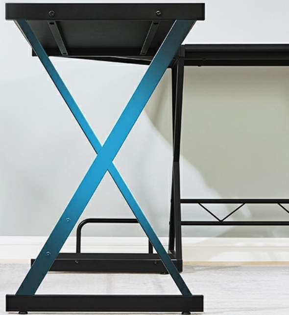
Image: The desk frame features thickened X-shaped legs for stability. Ensure these are correctly assembled.

L shaped desk with 4 thickened "X" legs (40x20mm) that give strong support for the desktop and also give more setup possibilities.