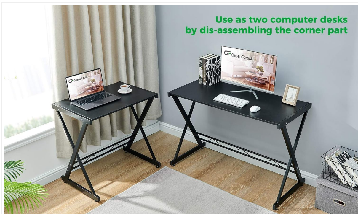
Image: The L-shaped desk can be separated into two distinct straight desks by removing the corner section.