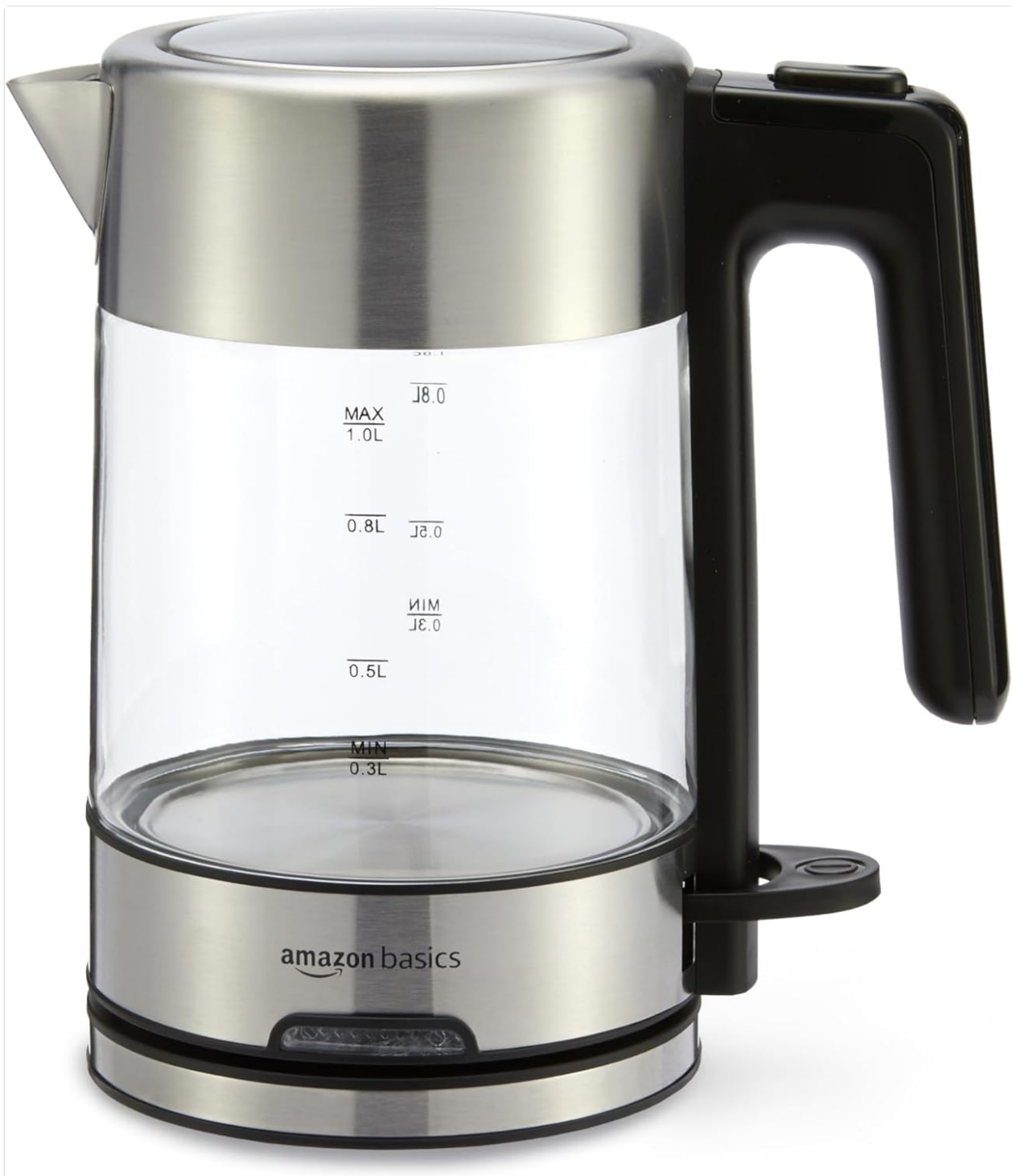
Image: The Amazon Basics Electric Kettle, showing its glass carafe, stainless steel base, black handle, and lid. The water level markings are visible on the side.