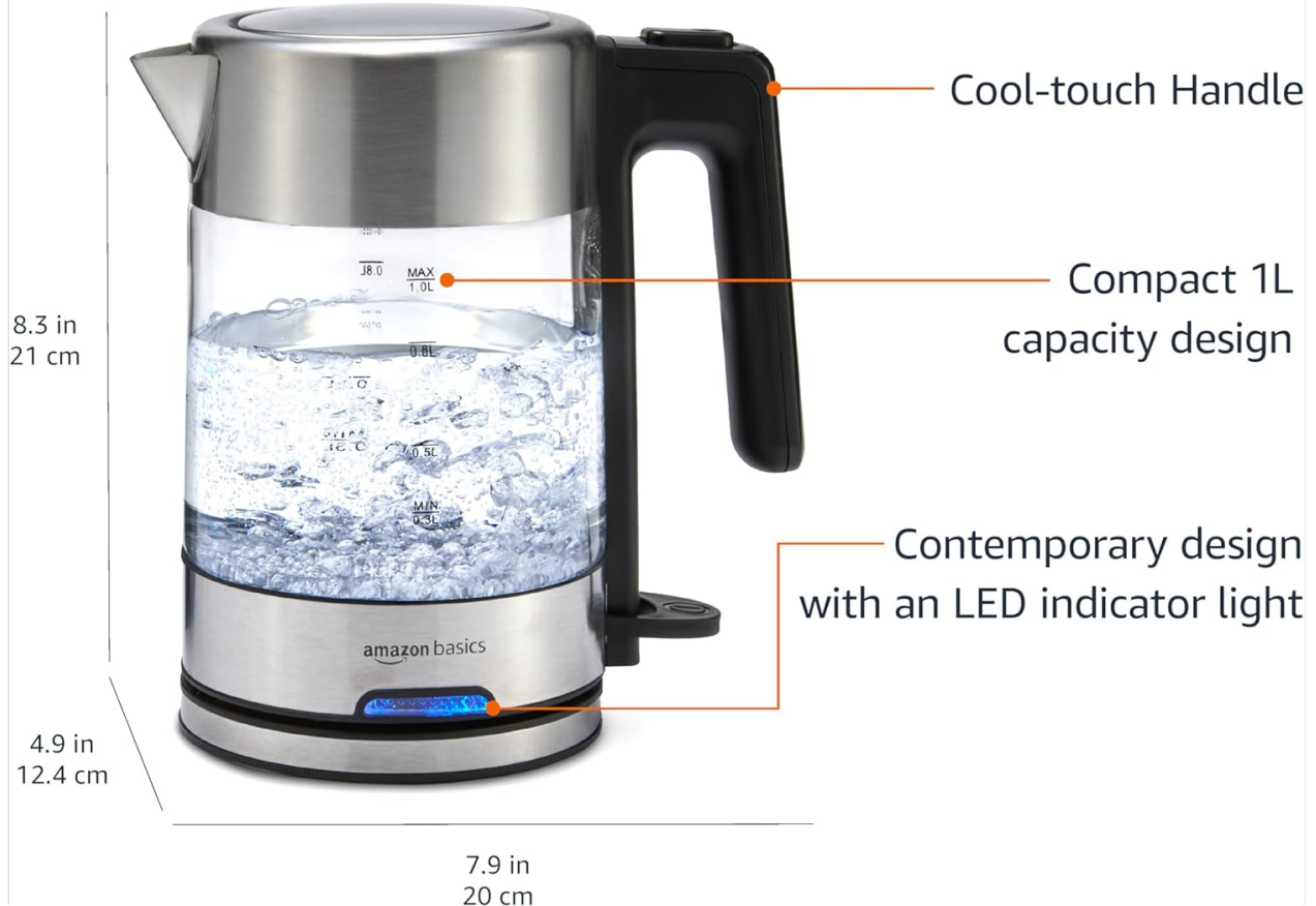
Image: Diagram illustrating the kettle's compact 1L capacity, cool-touch handle, contemporary design, and LED indicator light, along with its dimensions (8.3 inches height, 4.9 inches width, 7.9 inches length).