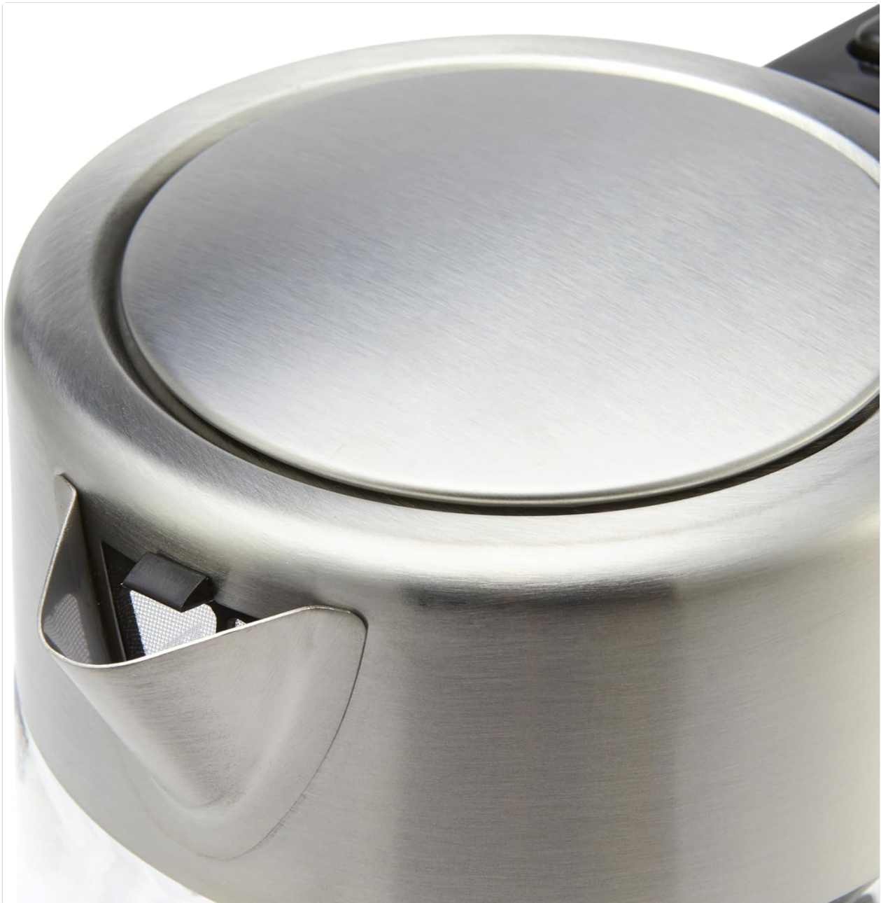
Image: A close-up view of the kettle's lid and spout area, highlighting the integrated removable filter for easy cleaning and maintenance.