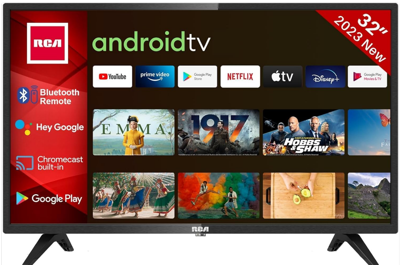
Image: The RCA RS32H2 Android Smart TV, showcasing its sleek design and the intuitive Android TV home screen with various streaming app icons.

Thank you for choosing the RCA RS32H2 Android Smart TV. This television combines advanced display technology with the versatility of the Android operating system, offering a seamless entertainment experience. This manual will guide you through the setup, operation, and maintenance of your new TV.