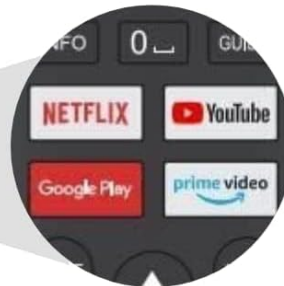
Image: The RCA remote control, featuring dedicated buttons for popular streaming services and a prominent Google Assistant button for voice commands.