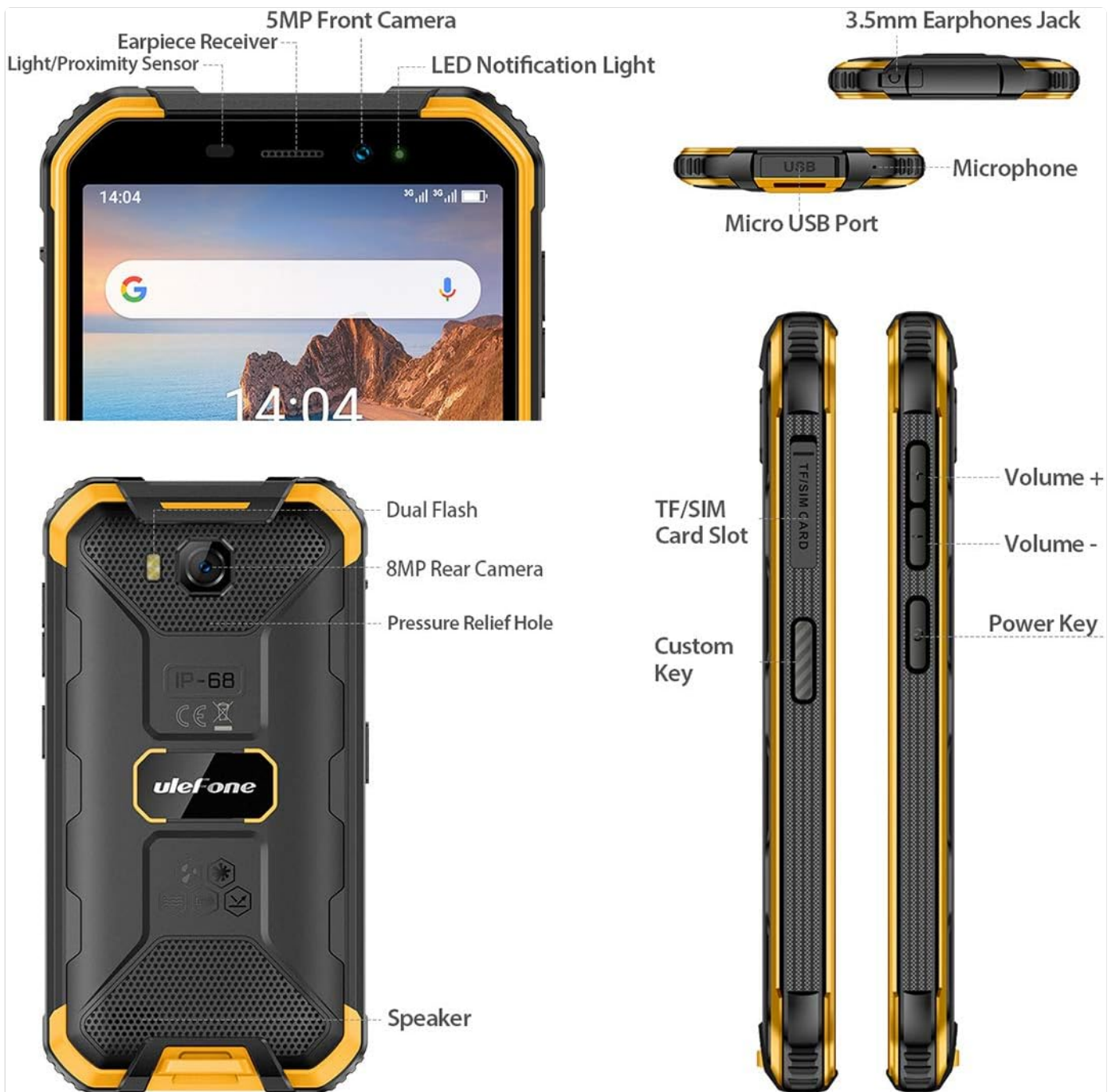
Figure 4: Device Layout

This diagram provides a detailed overview of the Ulefone Armor X6's physical features, including the 5MP front camera, earpiece receiver, LED notification light, light/proximity sensor, 3.5mm earphone jack, Micro USB port, microphone, dual flash, 8MP rear camera, pressure relief hole, speaker, TF/SIM card slot, custom key, volume buttons, and power key.