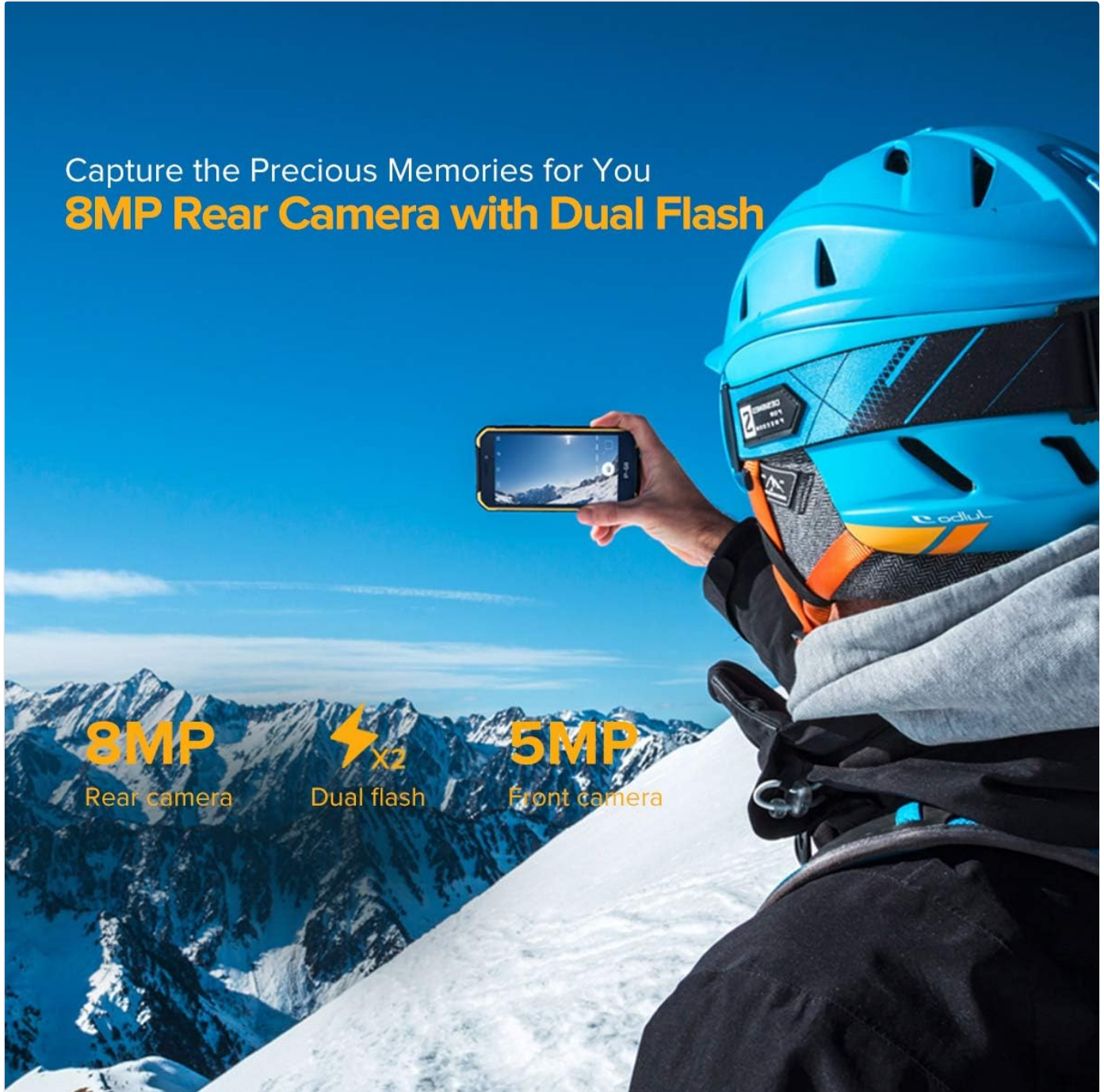
Figure 5: Camera Features

This image highlights the camera capabilities of the Ulefone Armor X6, showing an 8MP rear camera with dual flash and a 5MP front camera, emphasizing its ability to capture memories.