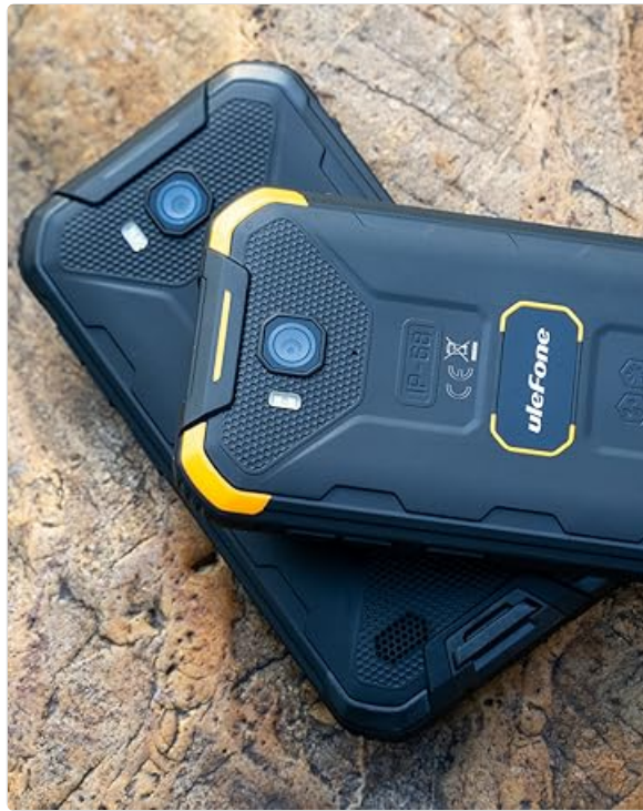
Figure 7: 360° Full Protection

This image highlights the 360-degree full protection feature of the Ulefone Armor X6, showing how its design provides superb durability against impacts and environmental elements.