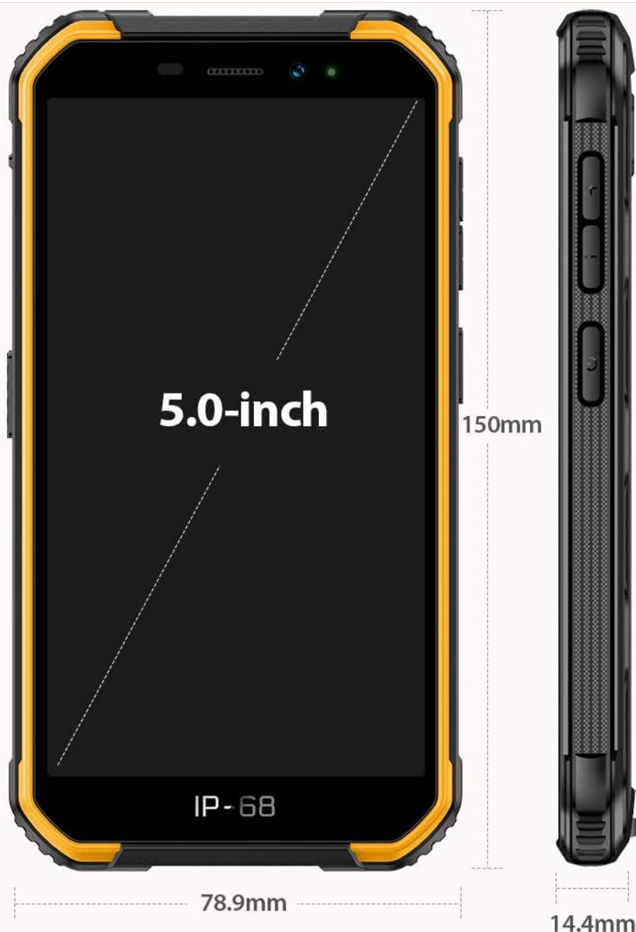
Figure 8: Product Dimensions

Height: 150mm Width: 78.9mm Thickness: 14.4mm