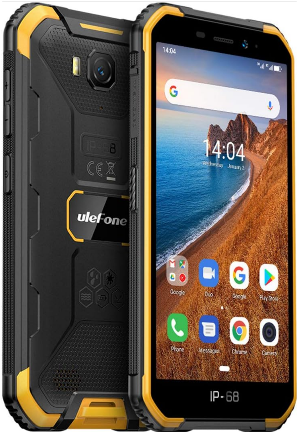
Figure 1: Ulefone Armor X6 Rugged Smartphone

The image displays the Ulefone Armor X6 rugged smartphone from both front and back angles. The front shows the display with app icons, while the back highlights its textured, durable casing and camera module. The phone features a black body with yellow accents, emphasizing its robust design.