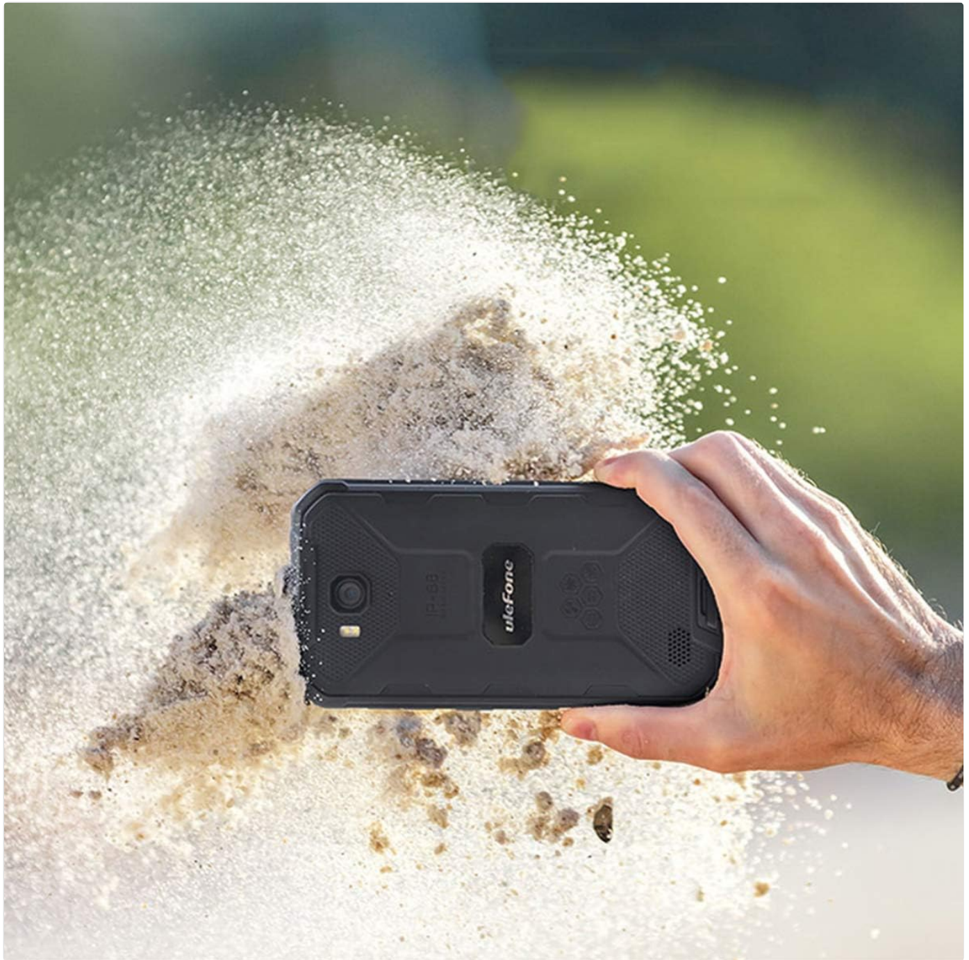
Figure 6: Rugged Durability

This image shows the Ulefone Armor X6 being held while sand is being kicked up around it, illustrating its robust and durable design, capable of withstanding harsh environments like dusty or sandy conditions.