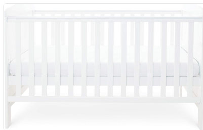
Image: Cot bed with mattress base in the middle position.