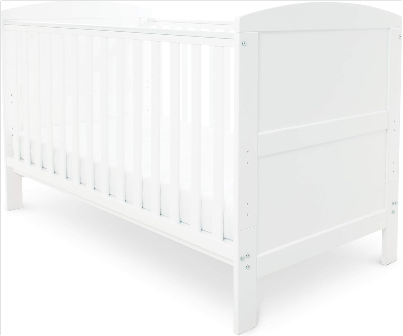
Image: Side view of the Ickle Bubba Coleby Classic Cot Bed, showing the assembled frame.

Align the holes on the cot side rails (B) with the pre-drilled holes on the cot end panels (A). Secure using the provided bolts and barrel nuts from the hardware pack (E). Ensure the teething rails (D) are facing upwards and inwards.