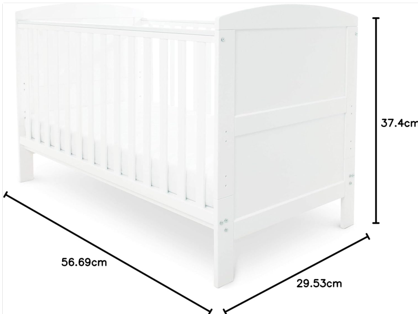
Image: Diagram showing the dimensions of the Ickle Bubba Coleby Classic Cot Bed.