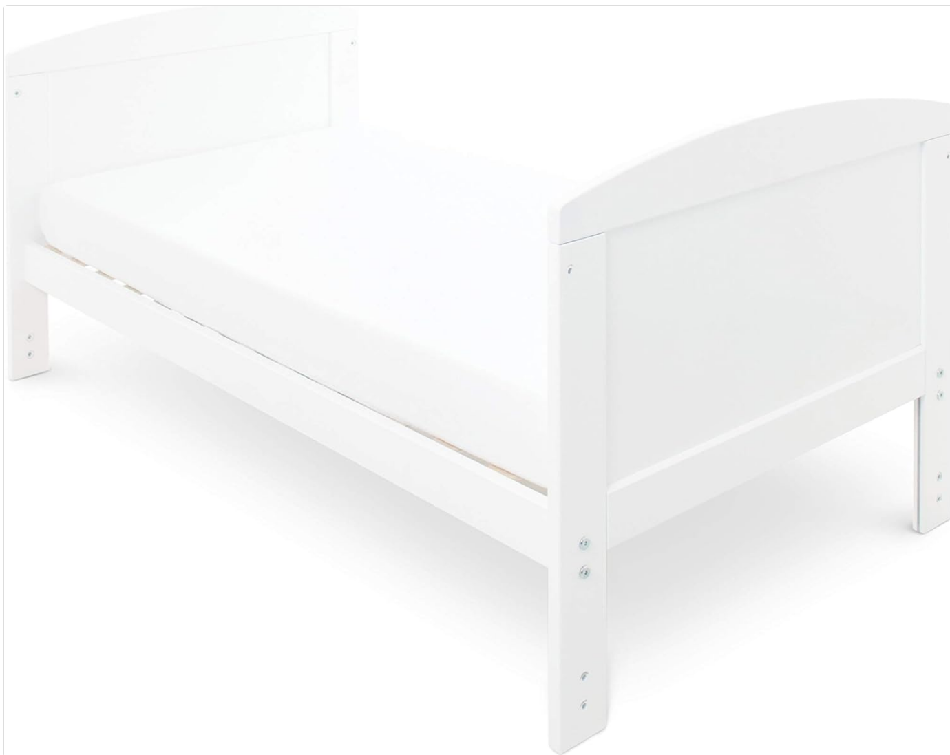
Image: The Ickle Bubba Coleby Classic Cot Bed converted into a toddler bed.