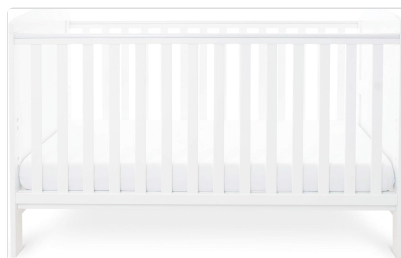
Image: Cot bed with mattress base in the lowest position.