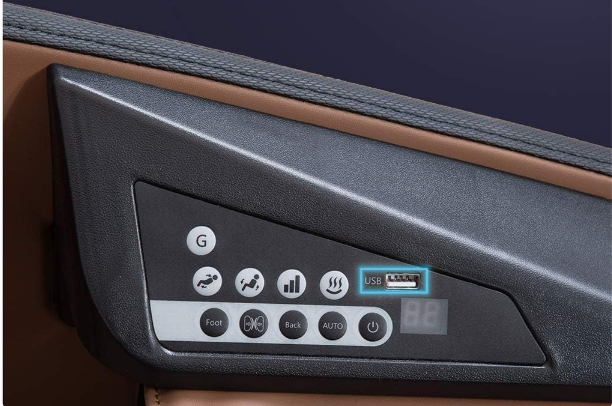
Image: A detailed view of the control panel, showing various buttons for massage functions and the integrated USB charging port.

The control panel allows you to select different massage modes, adjust intensity, and activate specific features. A convenient USB charging port is also available on the control panel to charge your electronic devices during your massage.