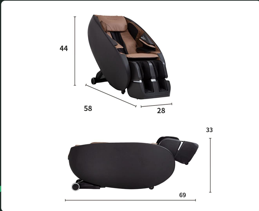
Image: A diagram illustrating the dimensions of the massage chair in both upright and reclined positions, measured in inches.