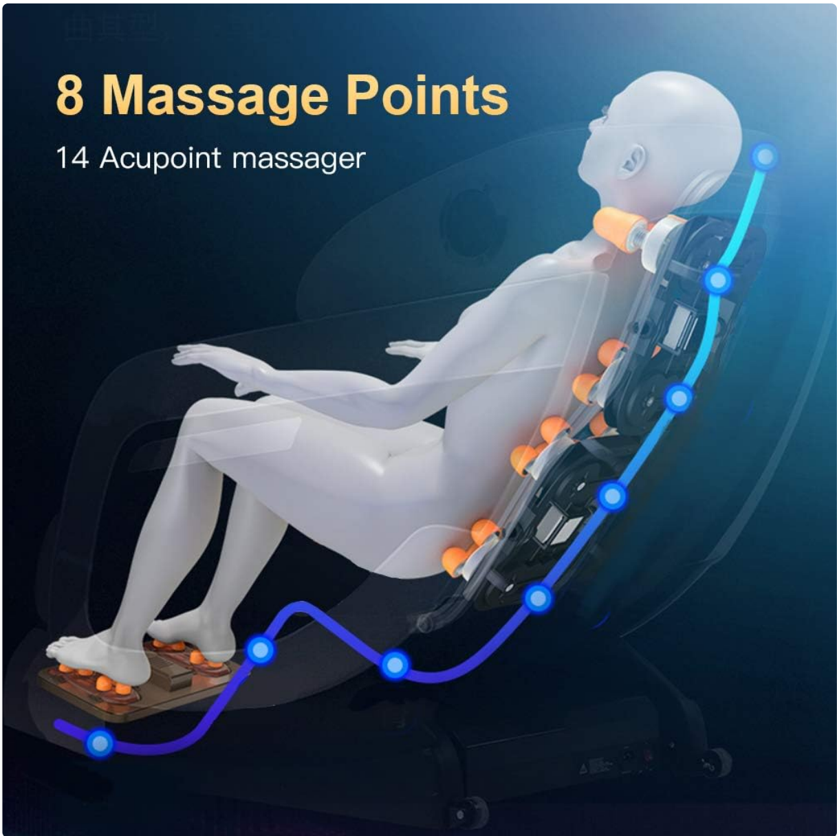
Image: The BestMassage Shiatsu Massage Chair, showcasing its design and presence in a home environment.