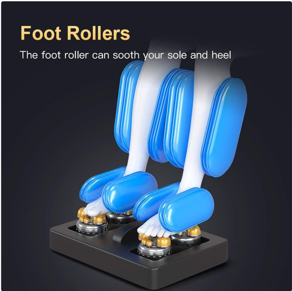
Image: A detailed view of the foot rollers designed to massage the soles and heels of the feet.

The foot roller can sooth your sole and heel