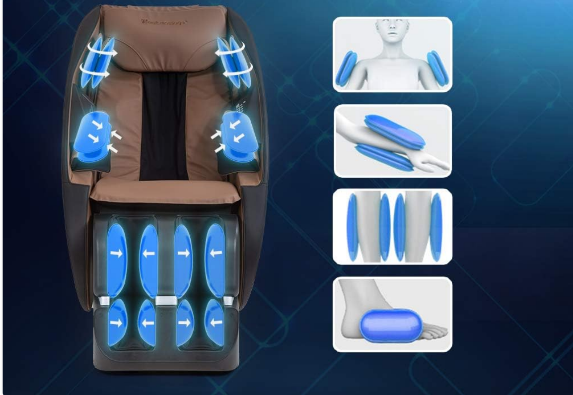
Image: A visual representation of the 8 massage points and 14 acupoint massagers integrated into the chair's backrest and footrest.