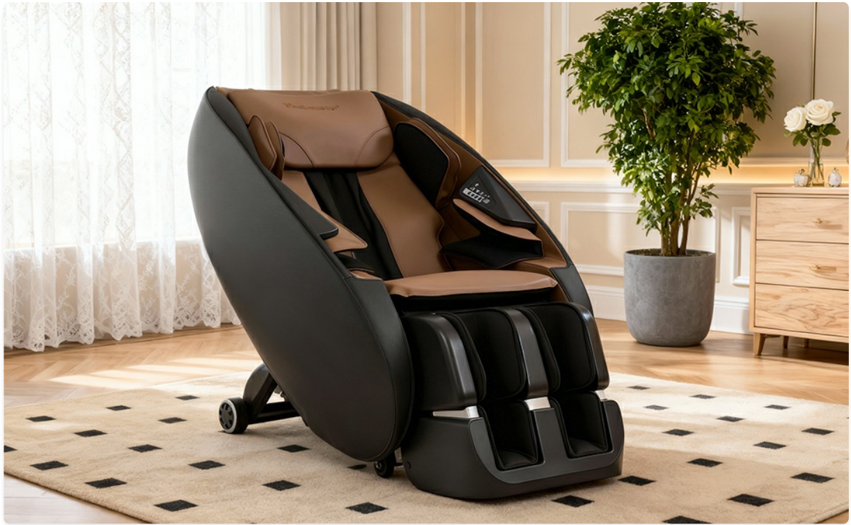
Image: An overview of the chair's features, including air pressure massage, zero gravity mode, massage techniques, waist heating, massage programs, and foot rollers.