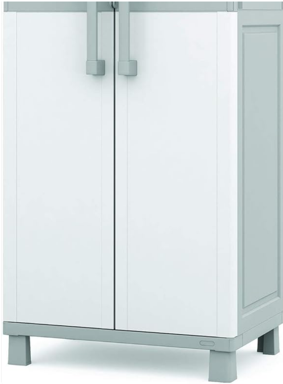
Figure 1: Front view of the Keter Storage Cabinet.