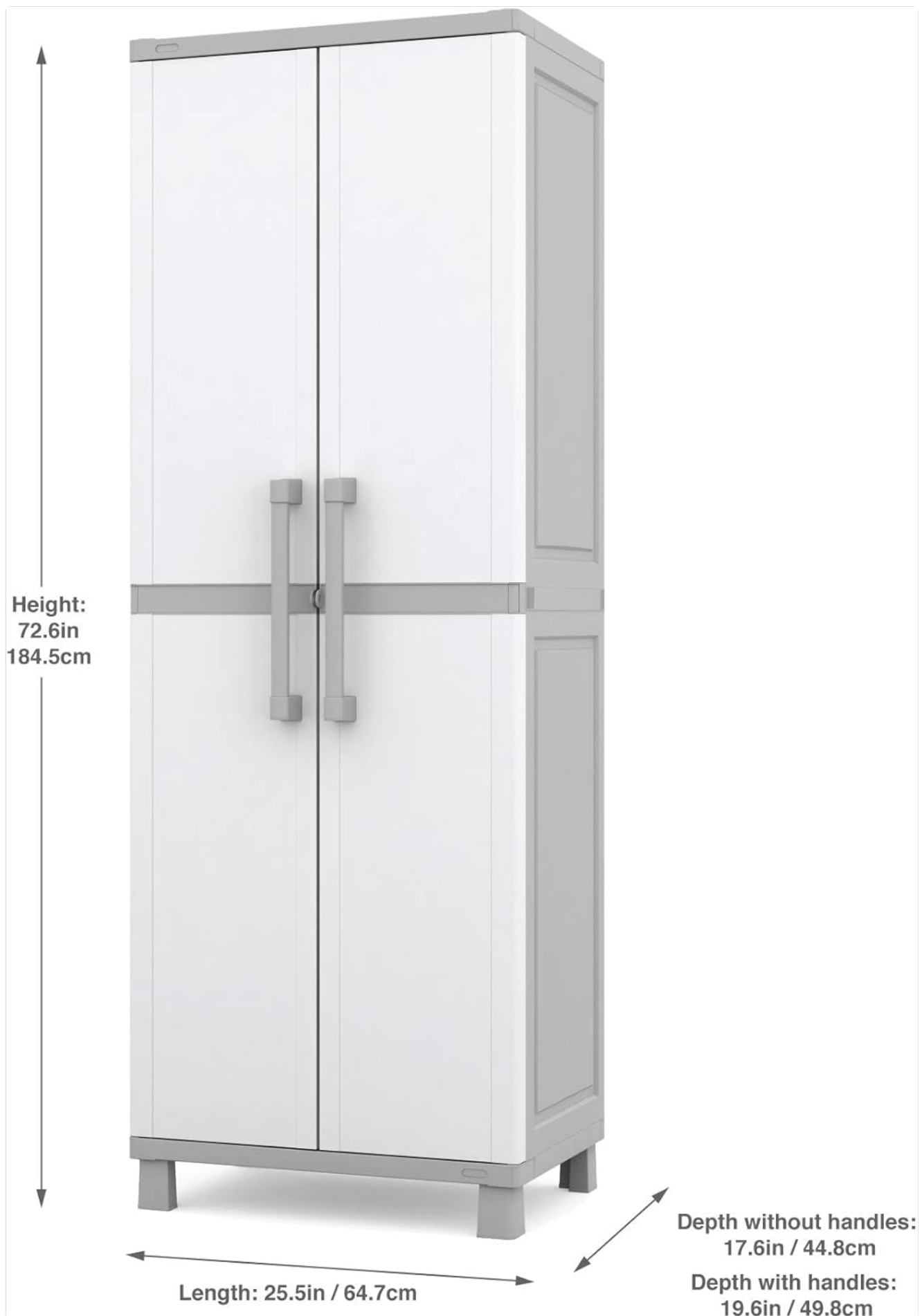
Figure 2: Keter Storage Cabinet with detailed dimensions.