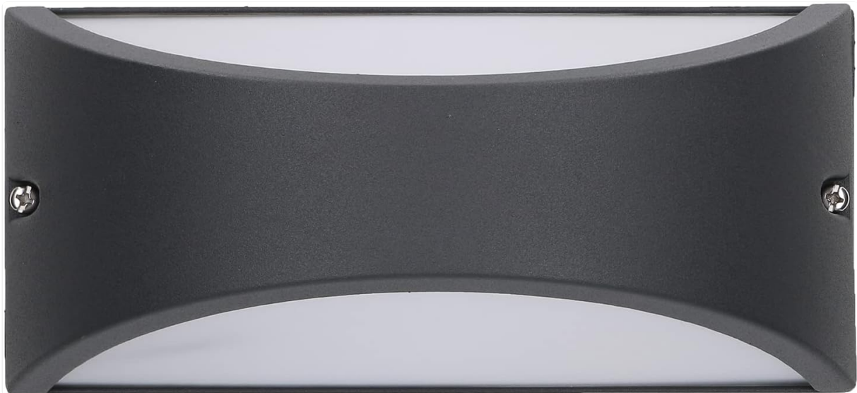
The rear side of the FORLIGHT Kapa LED outdoor wall light, displaying the mounting holes and internal wiring access points for installation.