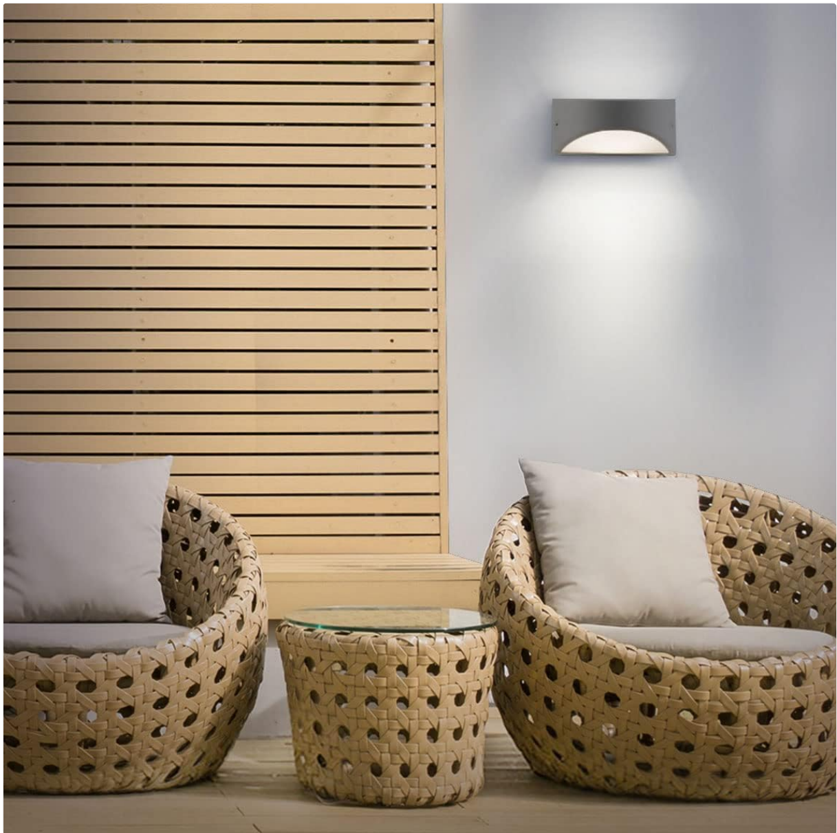
Front view of the FORLIGHT Kapa LED outdoor wall light, showcasing its sleek urban grey finish and curved light emission design.