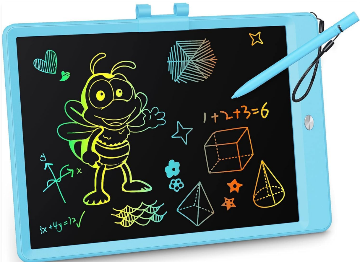
Image: KOKODI 10-inch LCD Writing Tablet in blue, displaying a vibrant drawing of a bee and various shapes, highlighting its colorful display capabilities.

Thank you for choosing the KOKODI LCD Writing Tablet. This device offers a paperless, mess-free solution for drawing, writing, and learning. Designed with eye protection technology, it is suitable for extended use. This manual provides essential information for setting up, operating, and maintaining your tablet.