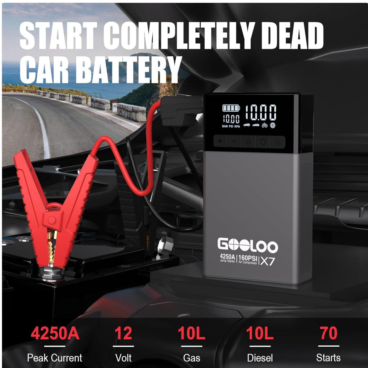
Figure 6: Jump Starting a Completely Dead Car Battery