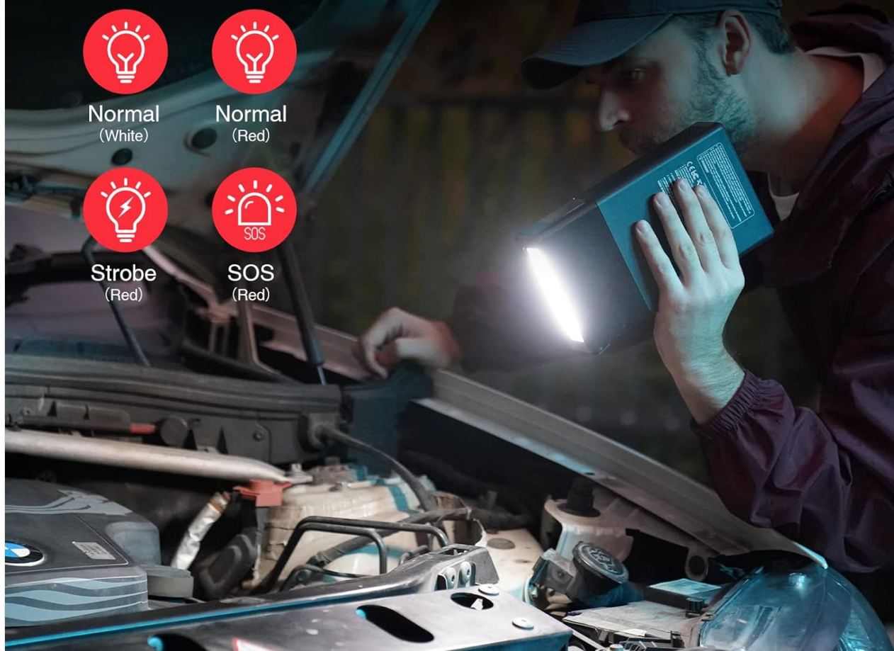
Figure 10: 400 Lumen Torch with 4 Modes