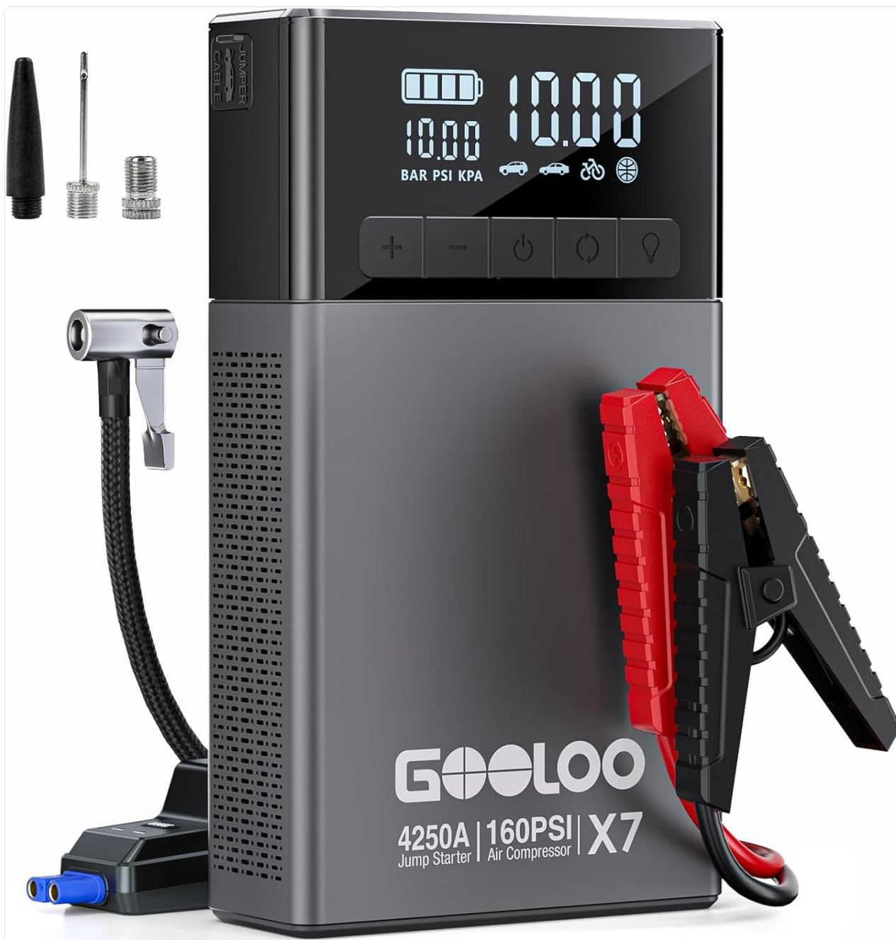
Figure 1: GOOLOO X7 Jump Starter with Air Compressor