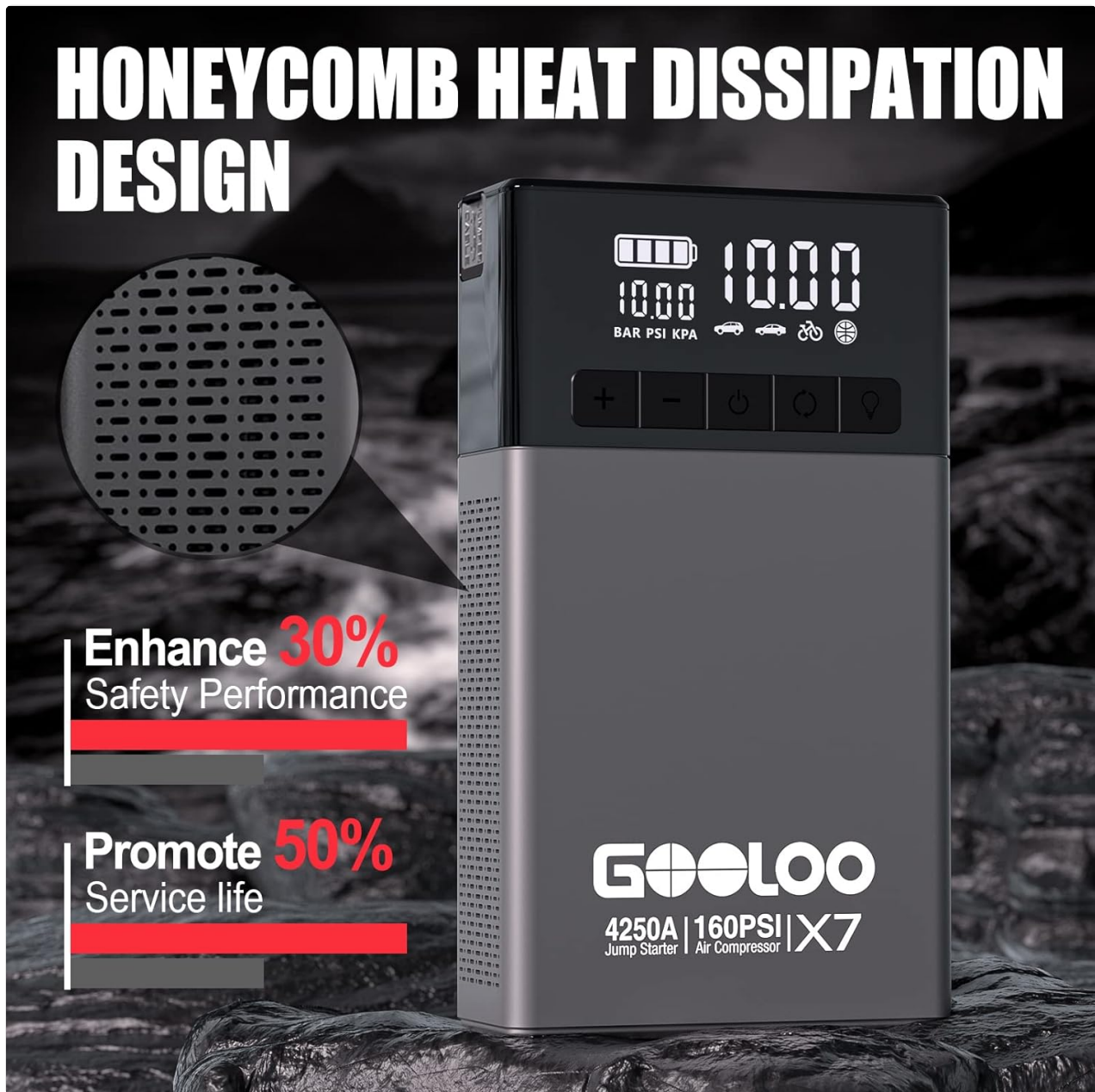
Figure 14: Honeycomb Heat Dissipation Design