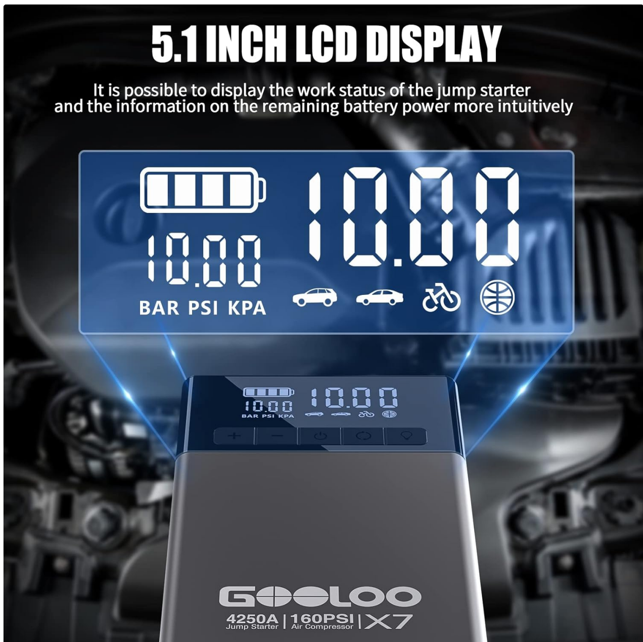
Figure 4: 5.1-inch Intelligent LCD Display