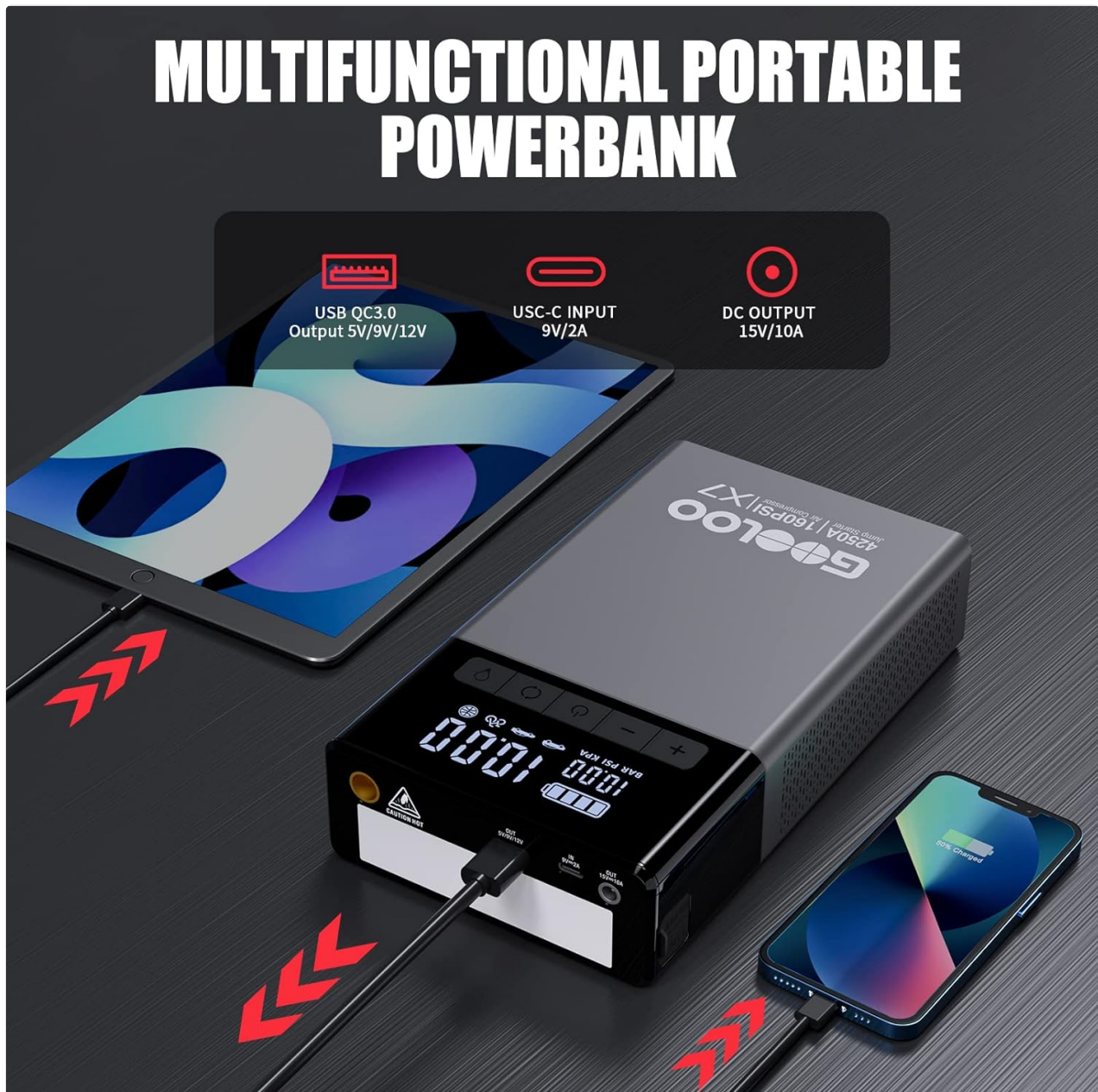
Figure 9: Multifunctional Portable Powerbank