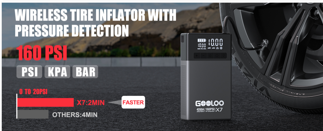
Figure 7: Easy Operation, Fast Inflation