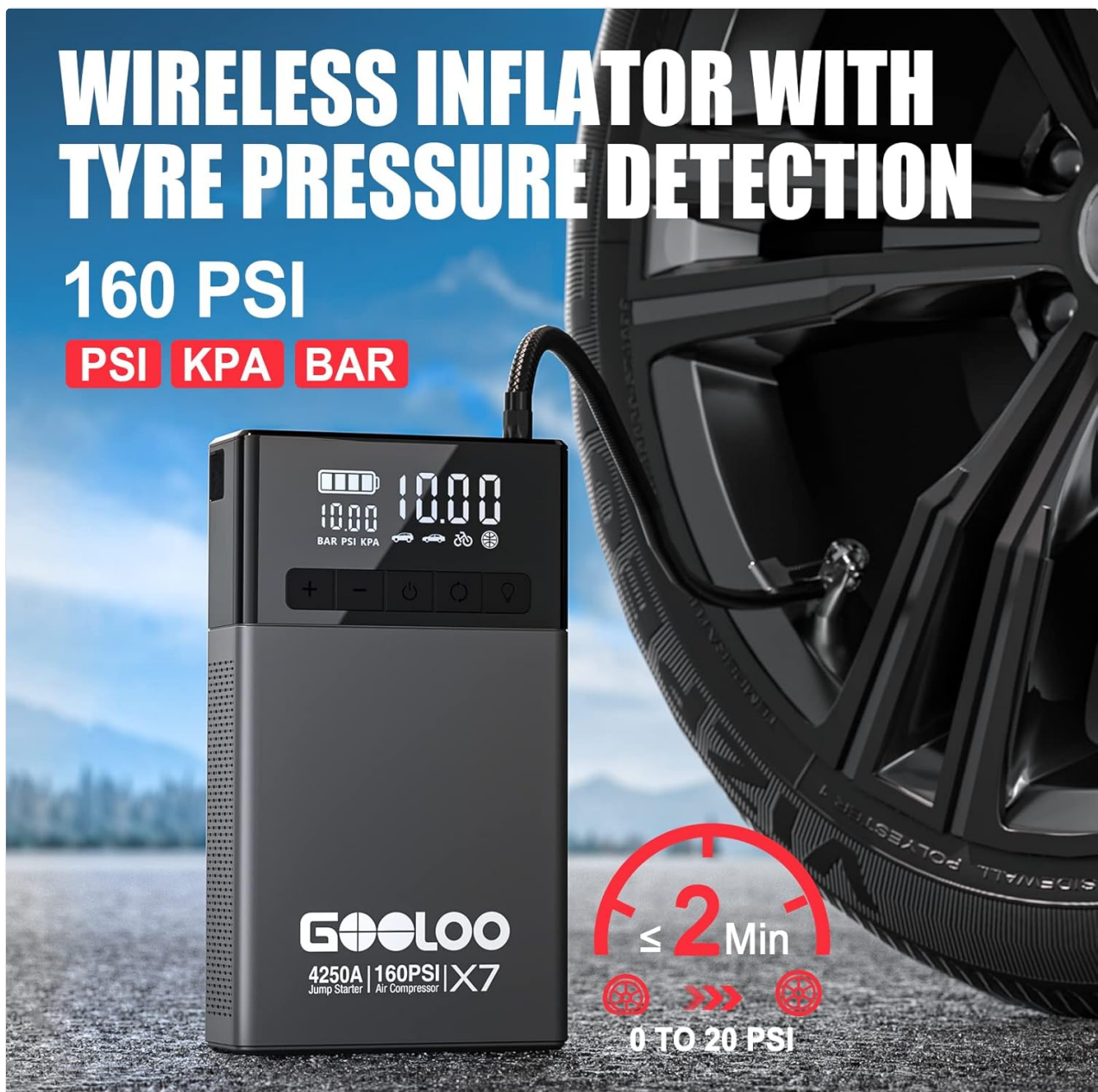
Figure 8: Wireless Inflator with Tyre Pressure Detection