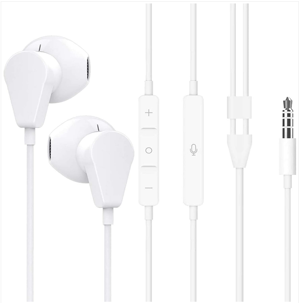
Image 1: Overview of the GEEKRIA EJL21-01 Wired Earbuds, showing the earbuds, inline remote control, and 3.5mm jack.