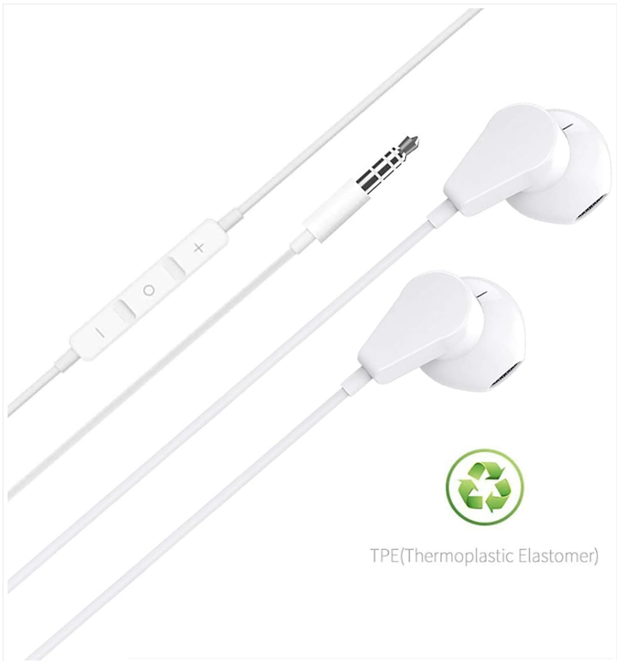
Image 2: Close-up of the earbuds, highlighting the Thermoplastic Elastomer (TPE) material used for durability and flexibility.

Video 1: Official GEEKRIA video demonstrating the features and use of the Wired Gaming Earphones.