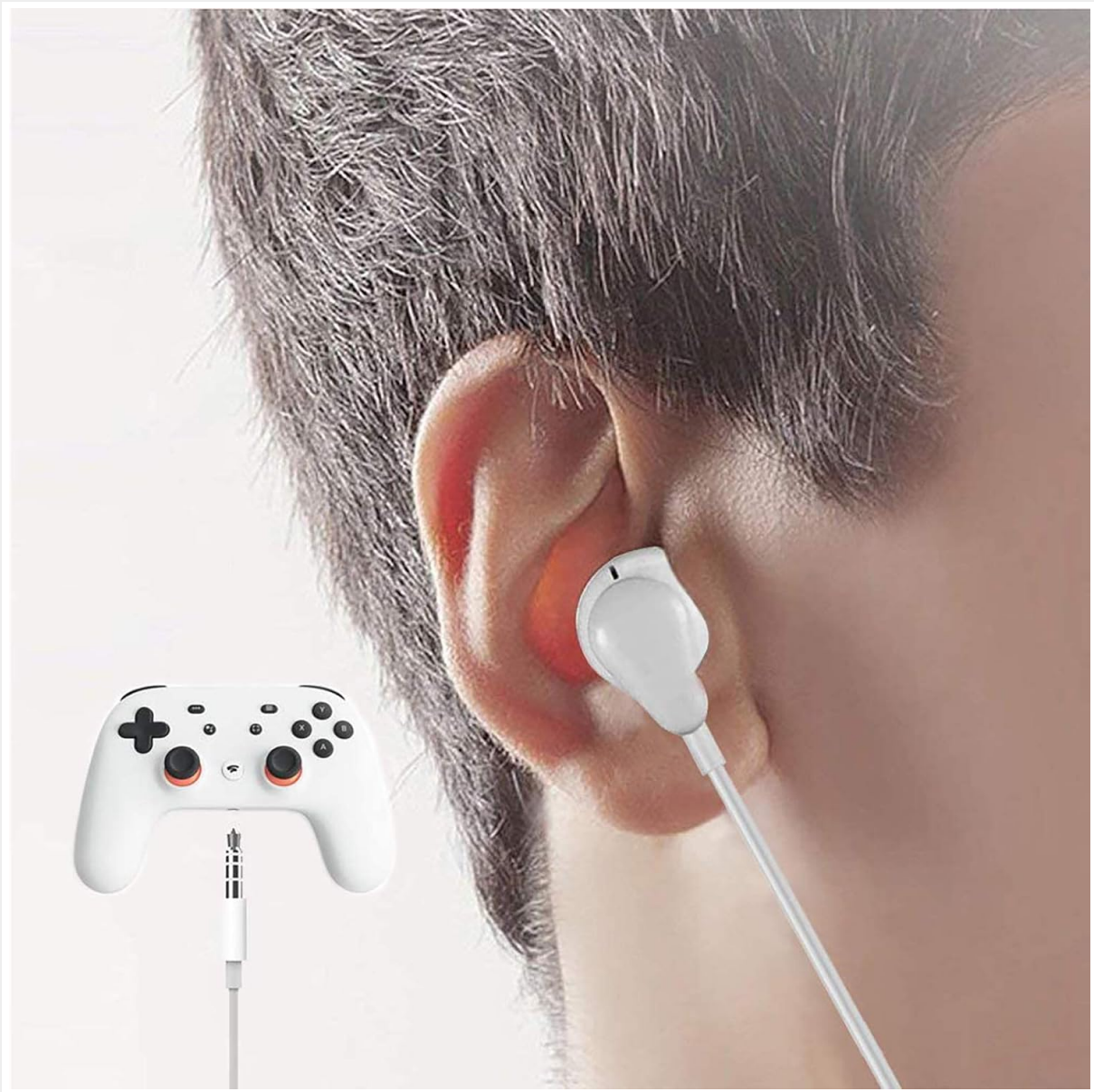
Image 3: Proper placement of the earbud in the ear and connection to a gaming controller.