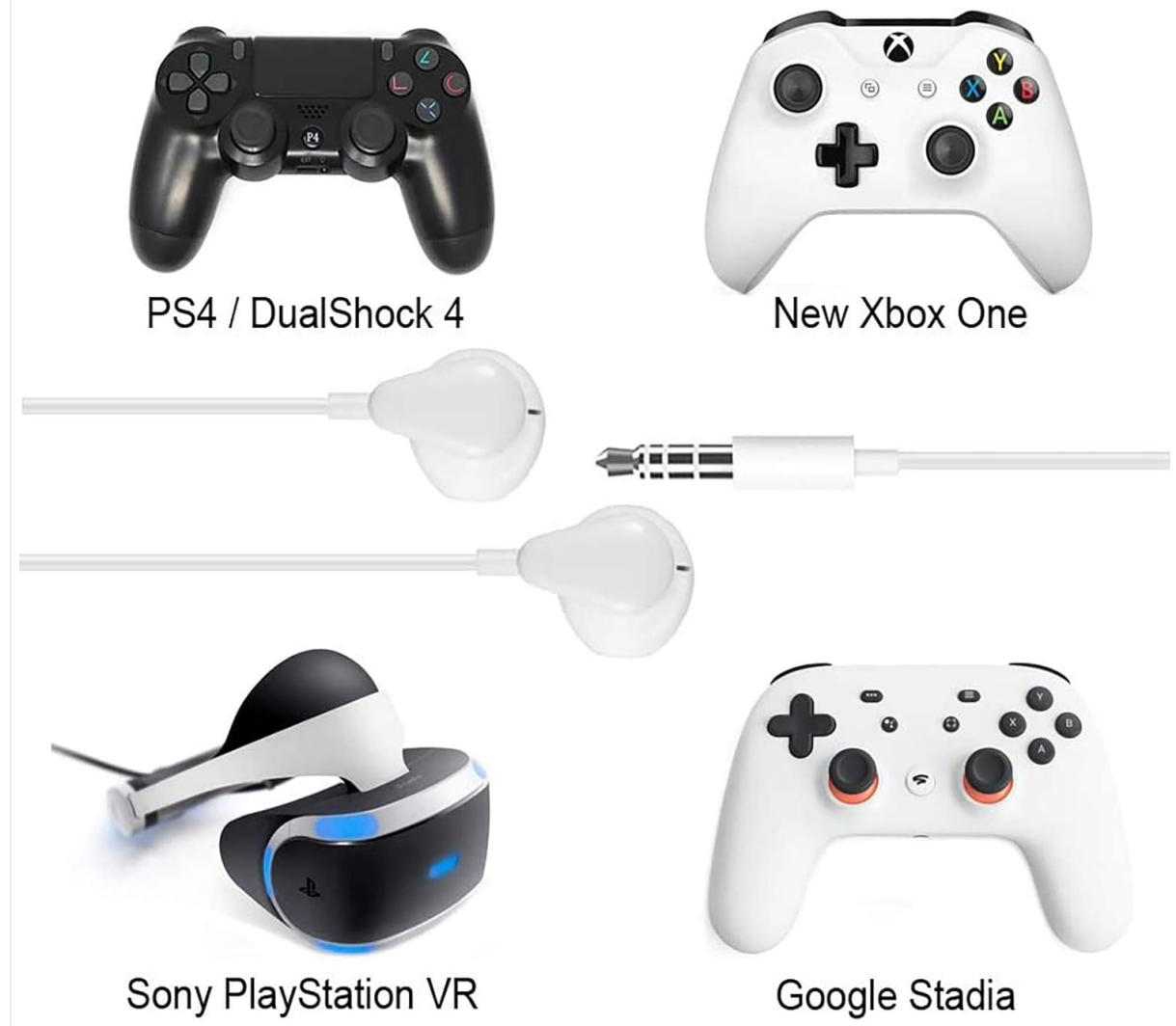
Image 5: Visual representation of device compatibility, including various gaming controllers and VR headsets.