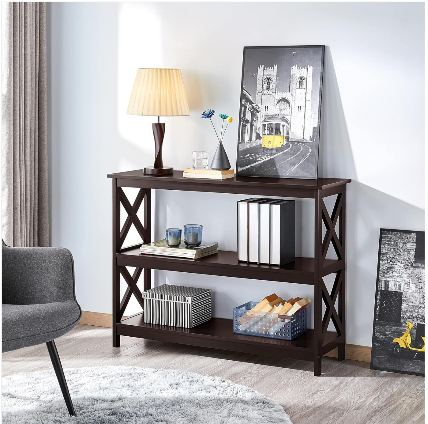
Image: The console table positioned in a living room, demonstrating its use as a sofa table with a lamp and various decorative objects.