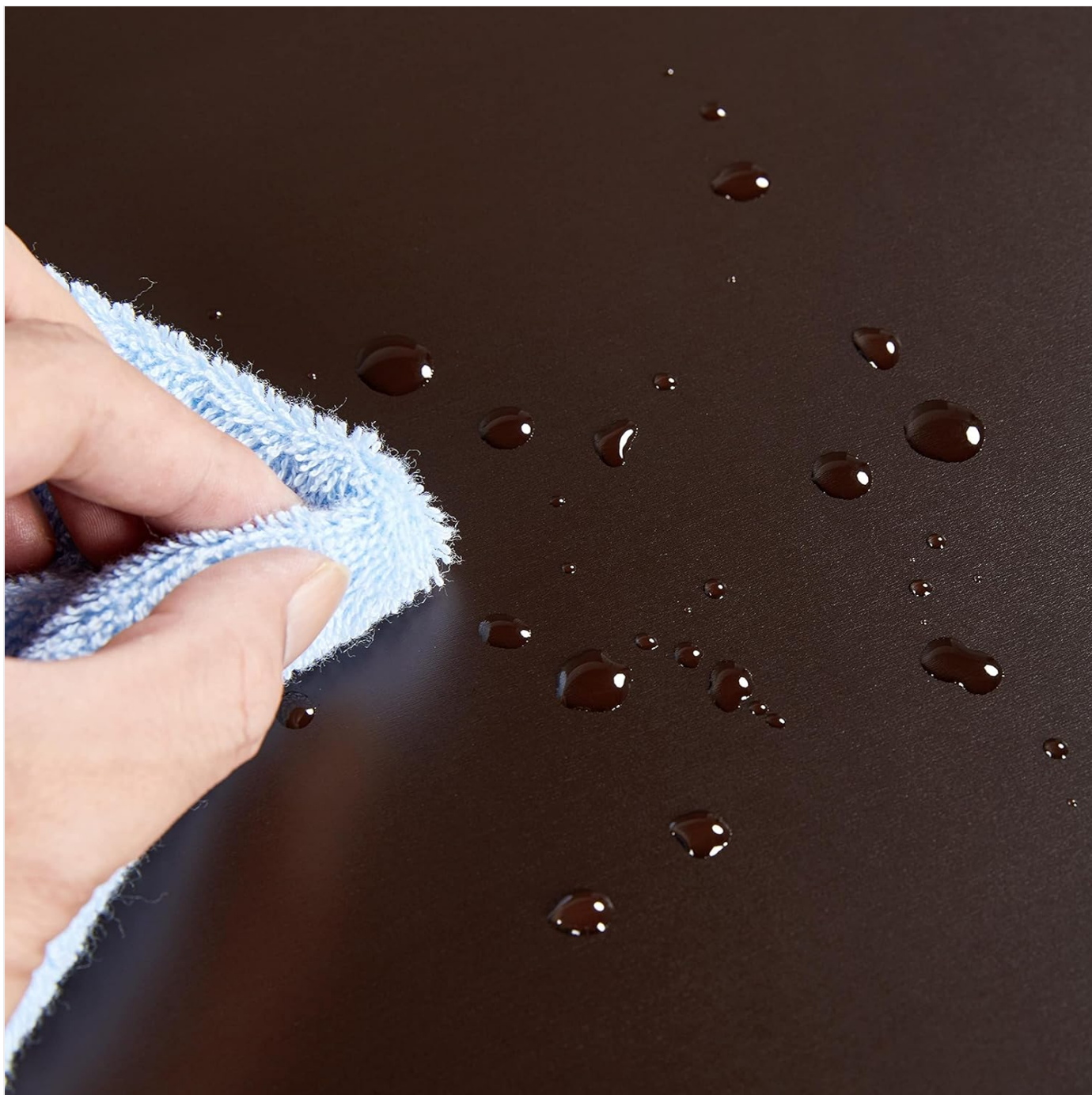
Image: A close-up of the table's surface being wiped clean, illustrating its easy-to-clean, dirt-proof coating.