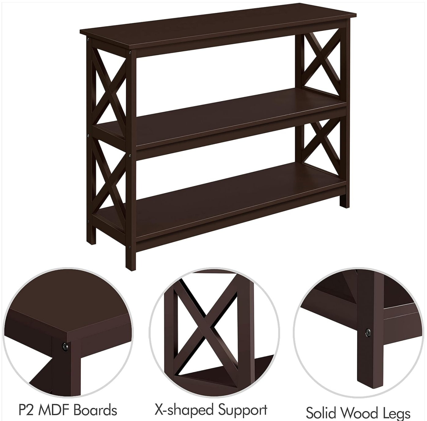
Image: Detailed view of the table's construction, showing the P2 MDF material, the X-shaped side supports for stability, and the solid wood legs.