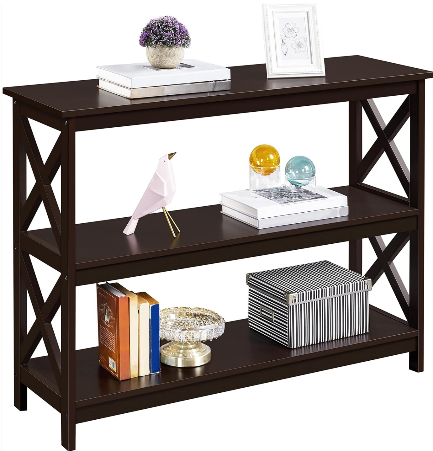
Image: The Yaheetech Console Table in Espresso, showcasing its three storage shelves and X-shaped side supports, adorned with decorative items.