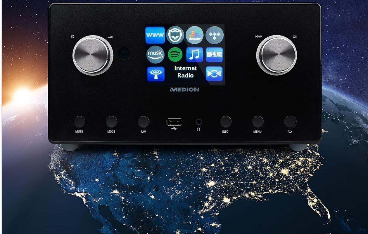
Image: The MEDION P85295 Internet Radio positioned on a stylized globe, emphasizing its capability to receive over 25,000 internet radio stations worldwide and digital radio reception with DAB+.