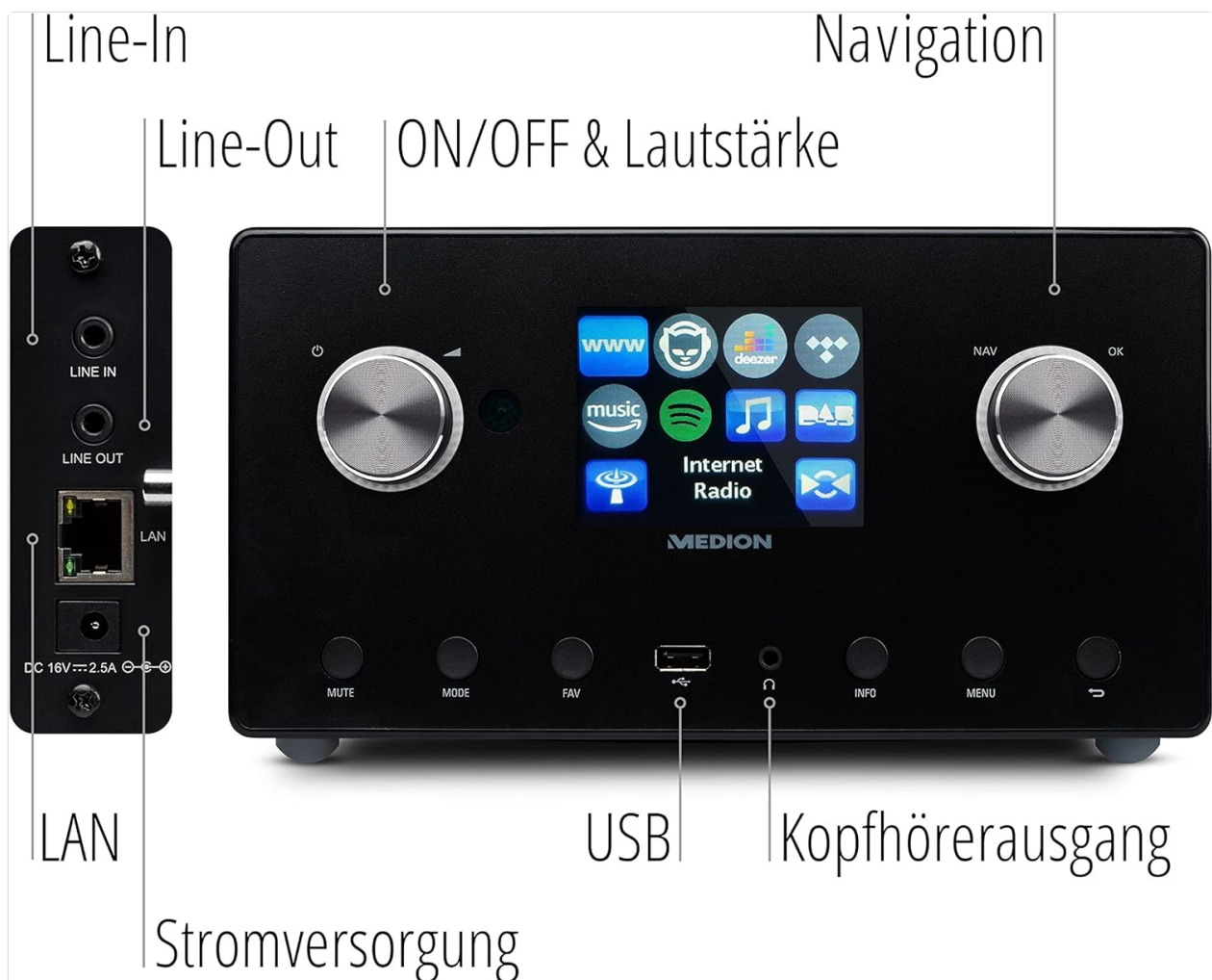
Image: A detailed view of the rear panel of the MEDION P85295 Internet Radio, with various ports clearly labeled. From top to bottom on the left side, there are Line-In and Line-Out jacks, followed by a LAN port and the DC 18V power input. On the front panel, below the display, a USB port and a headphone output are also indicated.