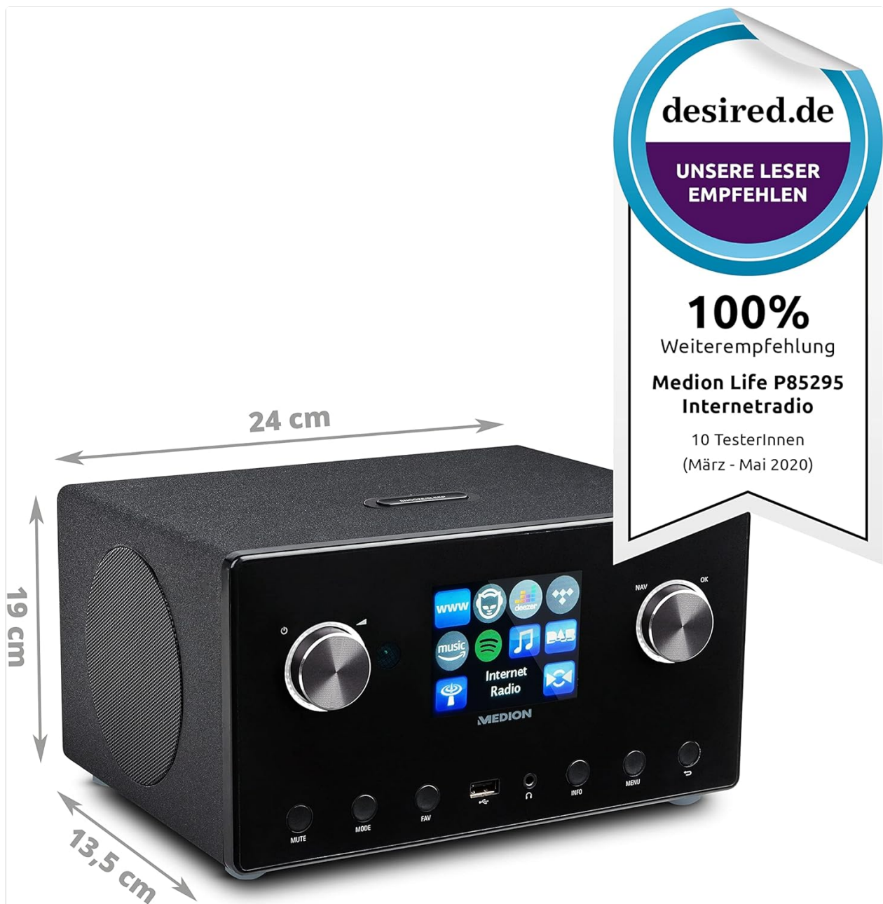
Image: The MEDION P85295 Internet Radio shown with its physical dimensions: 24 cm in length, 13.5 cm in width, and 19 cm in height, providing a clear understanding of its size.