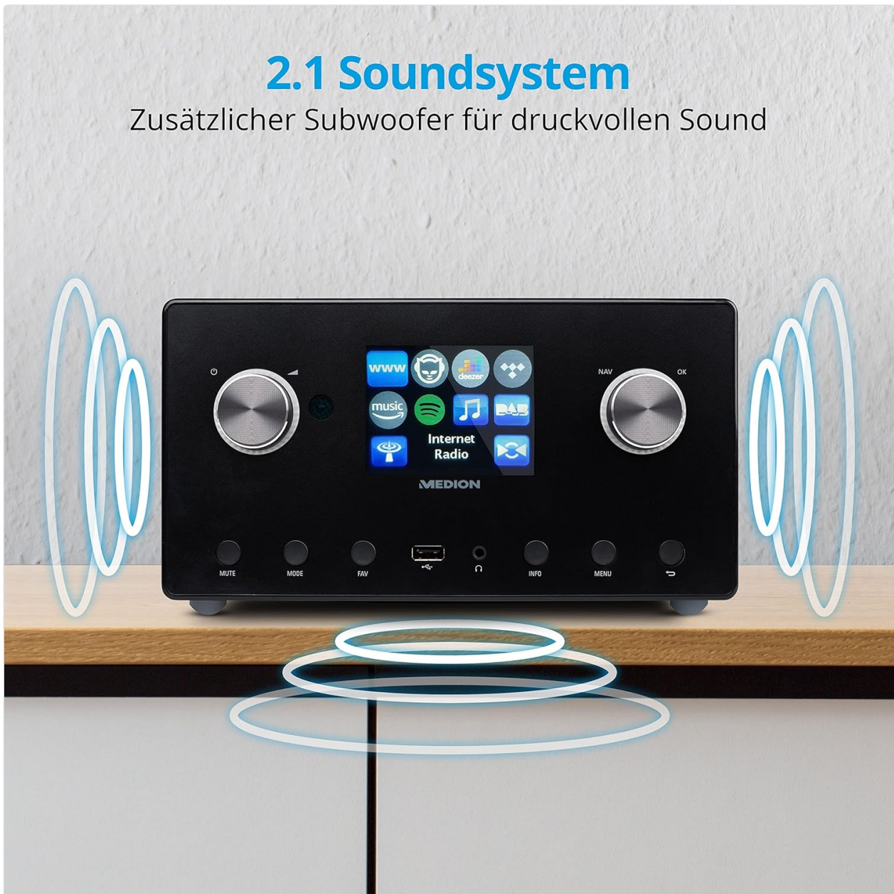
Image: A diagram showing the MEDION P85295 Internet Radio with sound waves emanating from its sides and bottom, illustrating its 2.1 sound system and the additional subwoofer for powerful sound.

Zusätzlicher Subwoofer für druckvollen Sound