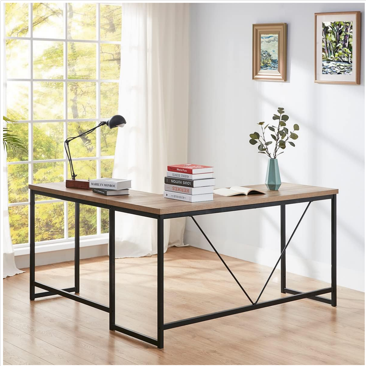
Image: The HSH L-Shaped Computer Desk, showcasing its design and ample workspace in a modern office environment.