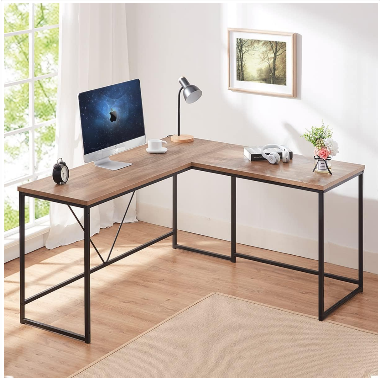
Image: The desk set up with a computer, demonstrating its functionality as a spacious workstation.