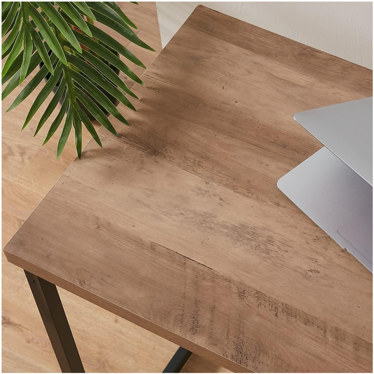
Image: A close-up of the desk's rustic oak tabletop, highlighting the wood grain finish.