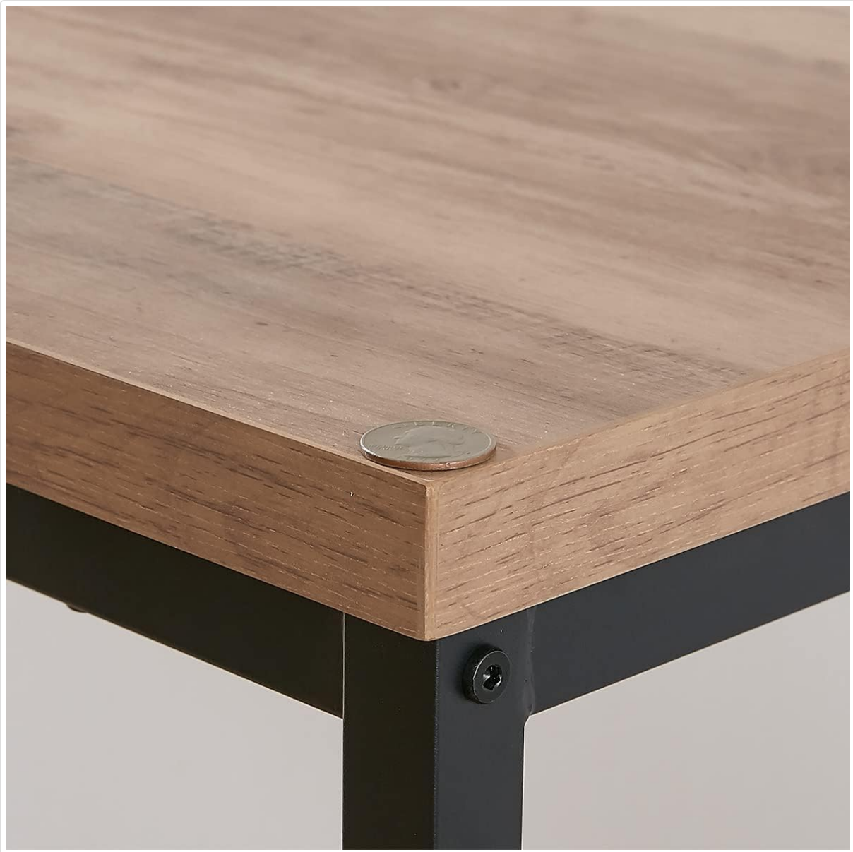
Image: Close-up of the desk's thickened tabletop, indicating its robust build quality.