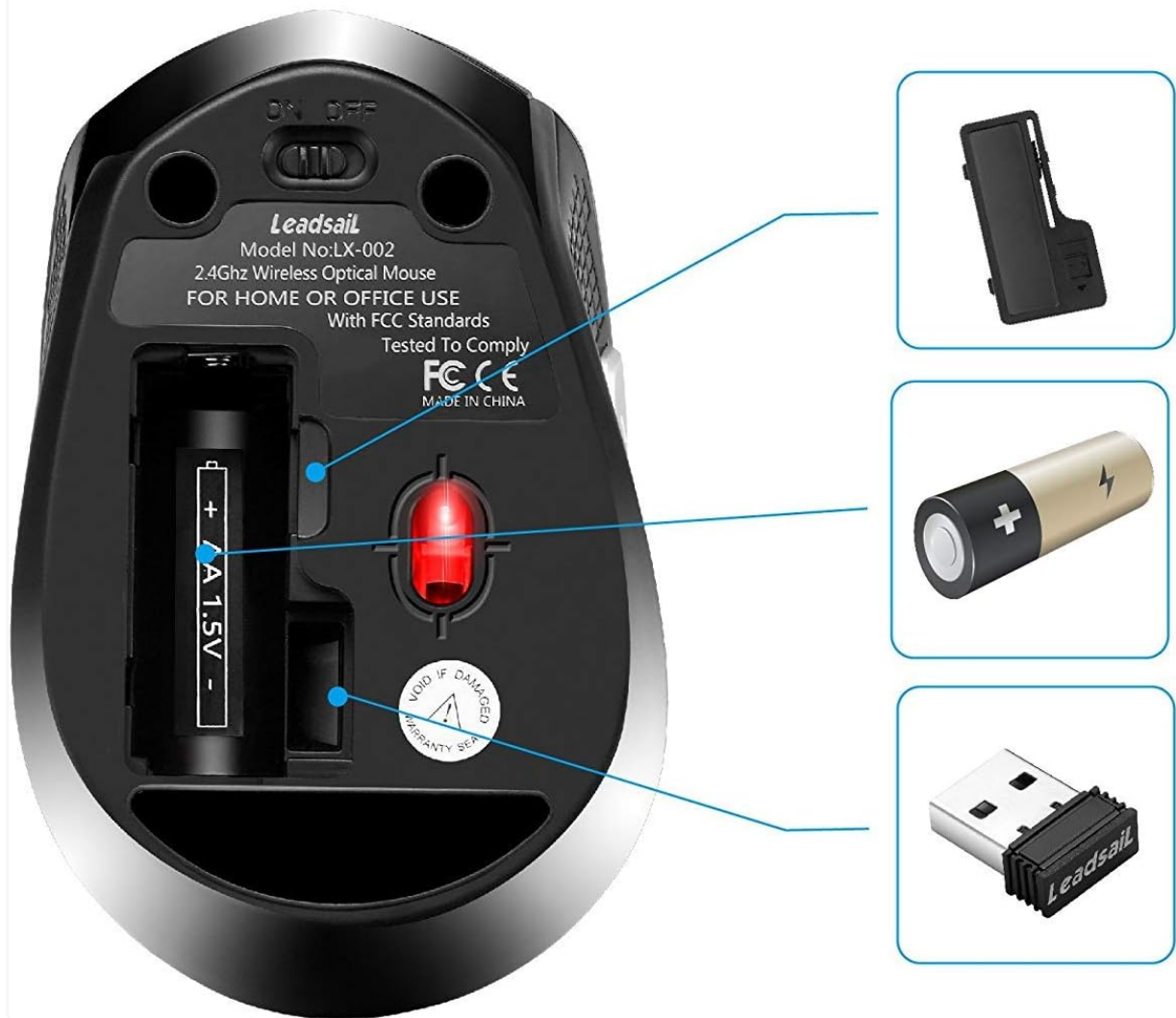
Image 4.1: Illustration showing the battery compartment for a single AA battery and the storage slot for the Nano USB receiver on the underside of the mouse.

Your browser does not support the video tag.