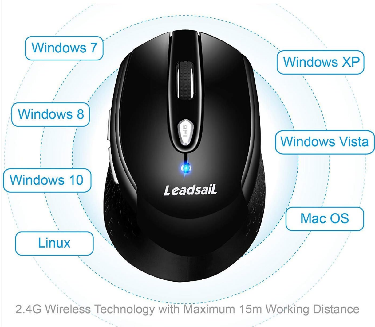
Image 6.1: Diagram showing the Leadsail mouse compatible with Windows 7, Windows 8, Windows 10, Linux, Mac OS, Windows XP, and Windows Vista.