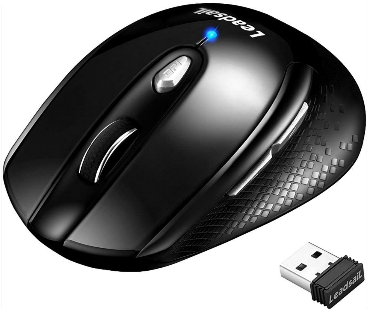
Image 1.1: Leadsail Wireless Laptop Mouse LX-002, a sleek black mouse with a silver scroll wheel and DPI button.