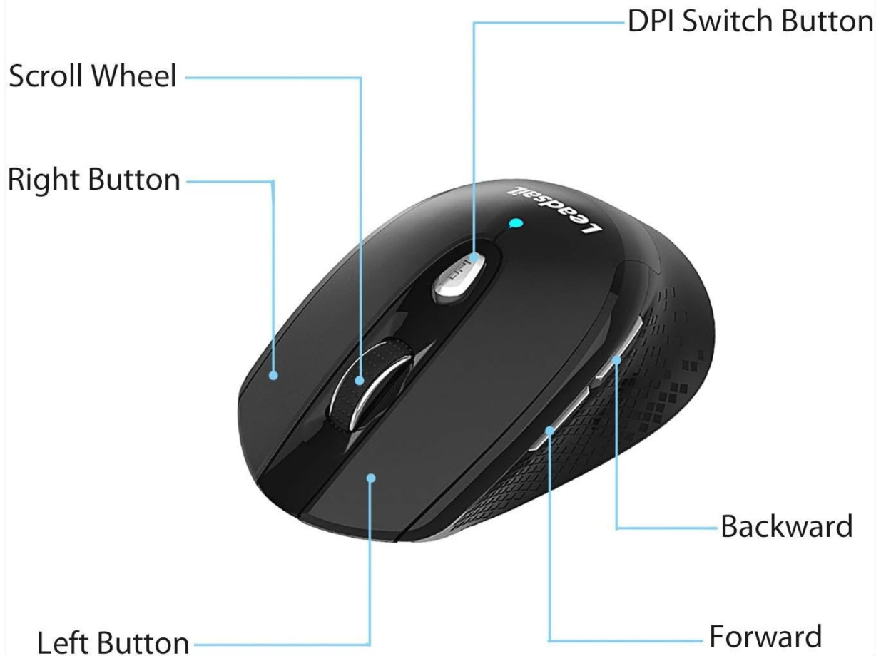
Image 3.1: Diagram illustrating the six buttons on the Leadsail Wireless Mouse: DPI Switch Button, Scroll Wheel, Right Button, Left Button, Backward Button, and Forward Button.