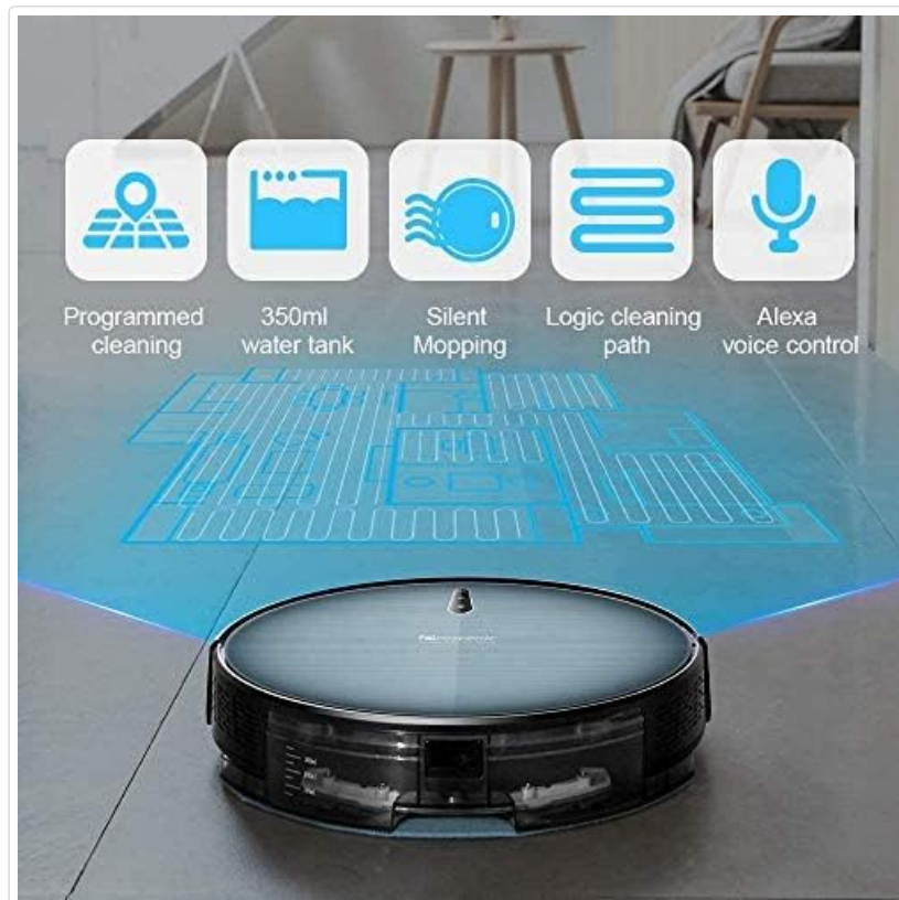
Image: Visual representation of key features including programmed cleaning, 350ml water tank, silent mopping, logical cleaning path, and Alexa voice control.