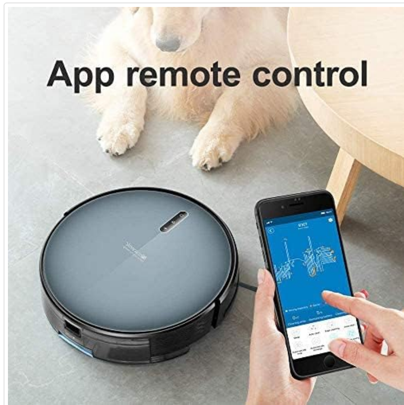
Image: The Proscenic 830T Robot Vacuum Cleaner being controlled remotely via the ProscenicHome smartphone application.