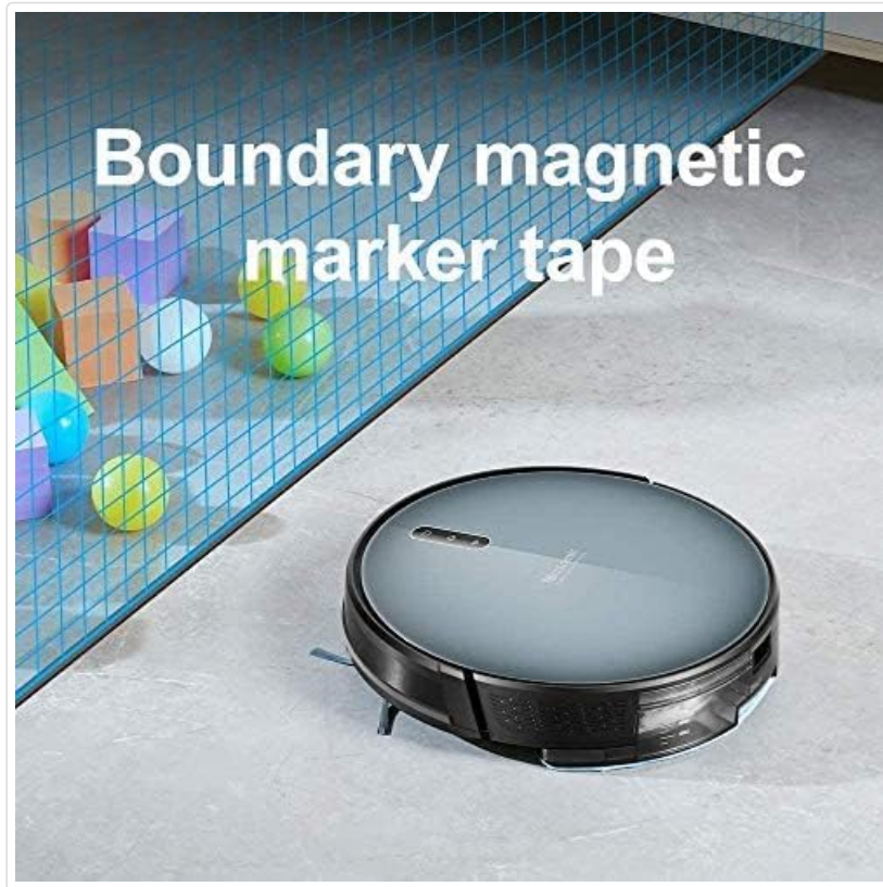
Image: The robot vacuum operating near a magnetic boundary tape, which defines a restricted area.

The included magnetic tape can be used to create virtual boundaries, preventing the robot from entering specific areas. Place the tape flat on the floor in areas you wish to restrict.