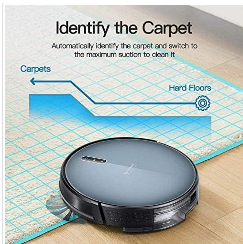
Image: The robot vacuum transitioning from a hard floor to a carpet, with an arrow indicating increased suction for carpet cleaning.

The 830T automatically detects carpets. When a carpet is identified, the robot will increase its suction power to the maximum setting for a deeper clean. It will return to normal suction on hard floors.