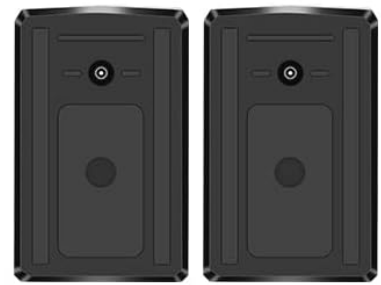
2x 2400mAh Batteries