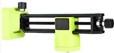
Multifunction Magnetic Bracket