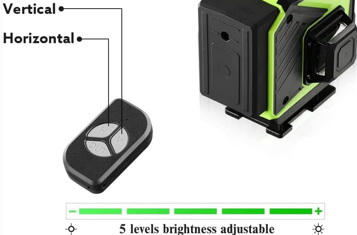
Image: Wireless remote control and brightness adjustment features.

You can switch the mode or adjustable brightness through the control panel, or remote control the laser level, so that you can release your hands while working.