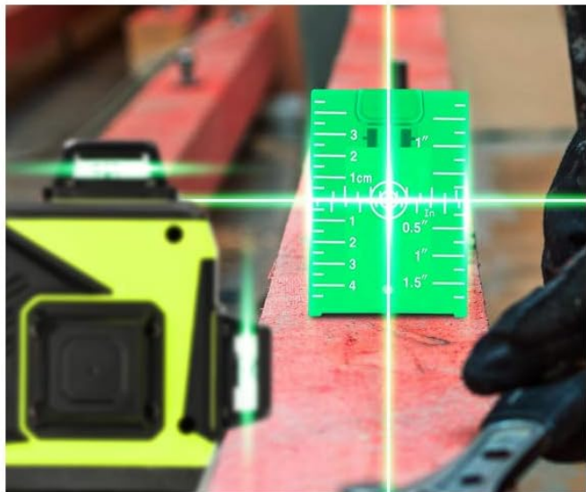
Image: Self-leveling and manual/tilt mode functionality.

Your browser does not support the video tag.