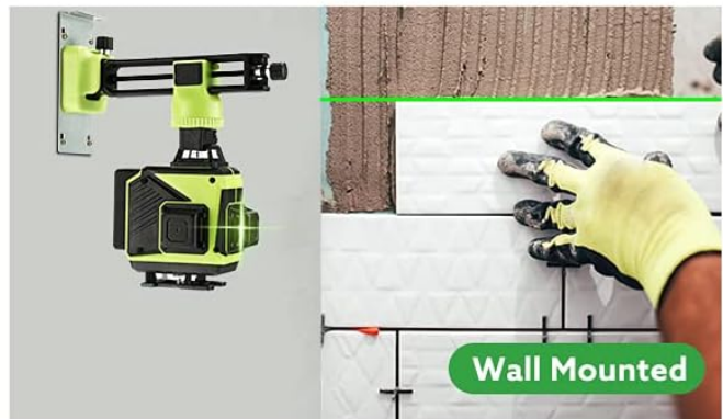
Image: Demonstrating multiple fixing methods for the laser level.