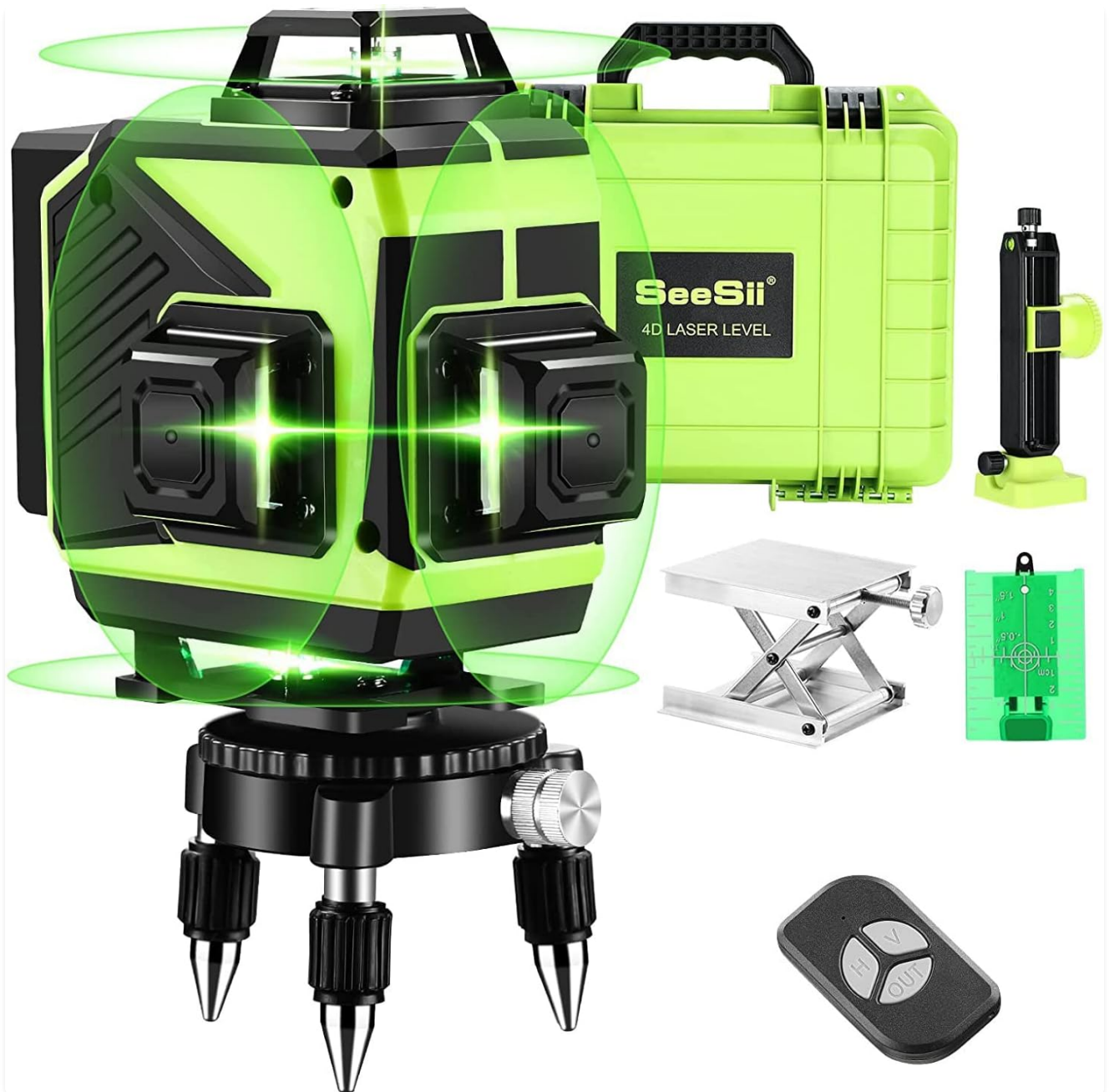
Image: Seesii 4D Laser Level with its complete set of accessories.