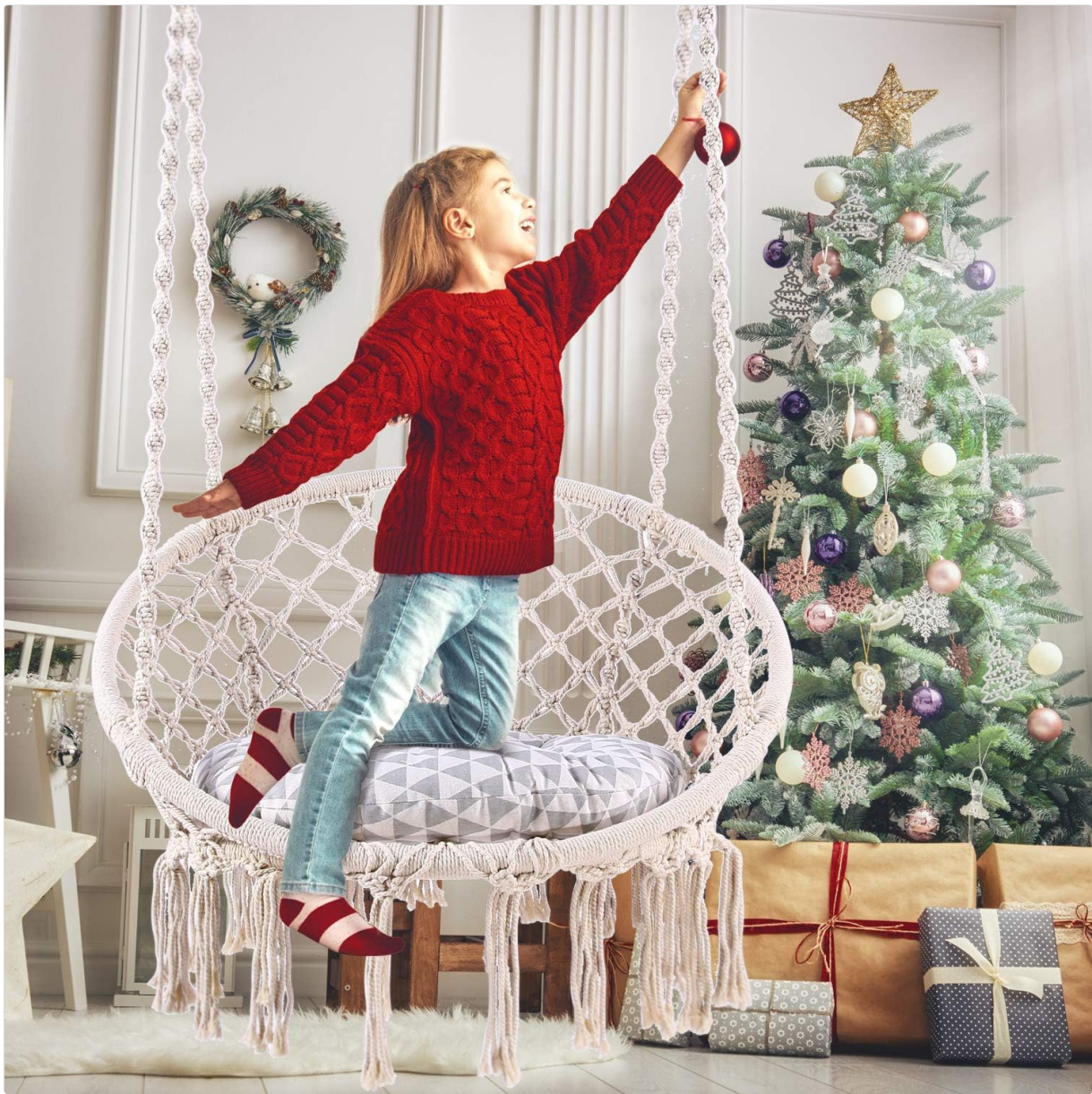
Image: A young girl in a red sweater and jeans is shown happily sitting in the Ohuhu Hammock Chair, which is suspended indoors. She is reaching upwards, illustrating the comfortable and playful use of the chair.