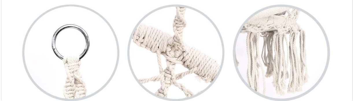
Image: Close-up view of the hammock chair's details, showing the sturdy hanging ring, the intricate braided cotton rope, and the decorative tassels at the bottom. A cushion is also visible within the chair.