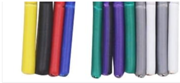
Image: A detailed view of the EASWEL Wire Harness, highlighting the distinct colors of each wire for easy identification during installation.