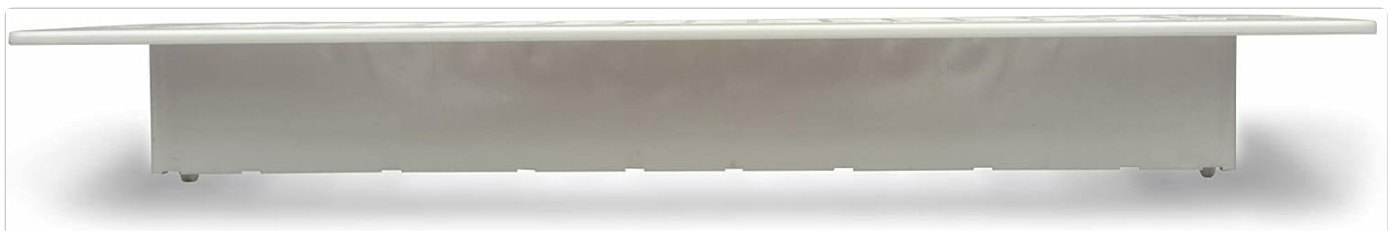
Image 3.1: Side profile of the Thetford RV Camper Floor Register Vent. This view illustrates the depth of the vent and its flange, which sits on the floor surface.