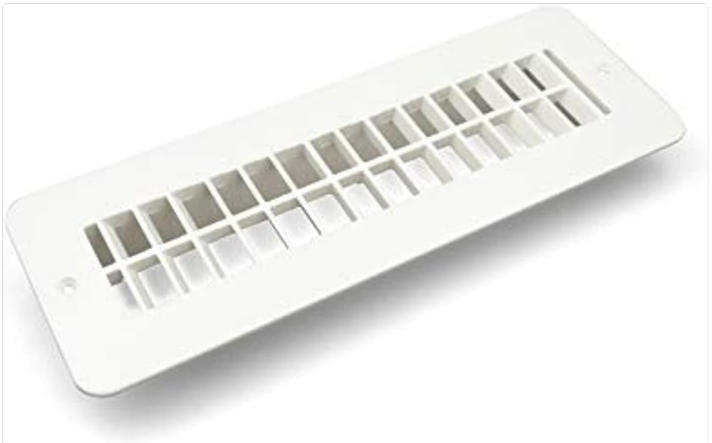
Image 1.1: Top view of the Thetford RV Camper Floor Register Vent (PN 94256). This image shows the rectangular vent with multiple slats for airflow and screw holes for mounting.

This manual provides instructions for the installation and maintenance of the Thetford RV Camper Floor Register Vent, model PN 94256. This vent is designed for recreational vehicles and campers, providing airflow without a damper mechanism. It features a durable construction suitable for RV environments.