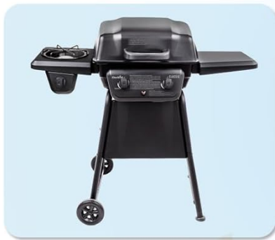
Charbroil Classic 280 2-Burner Gas Grill