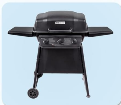
Charbroil American Gourmet 2/3 Burner