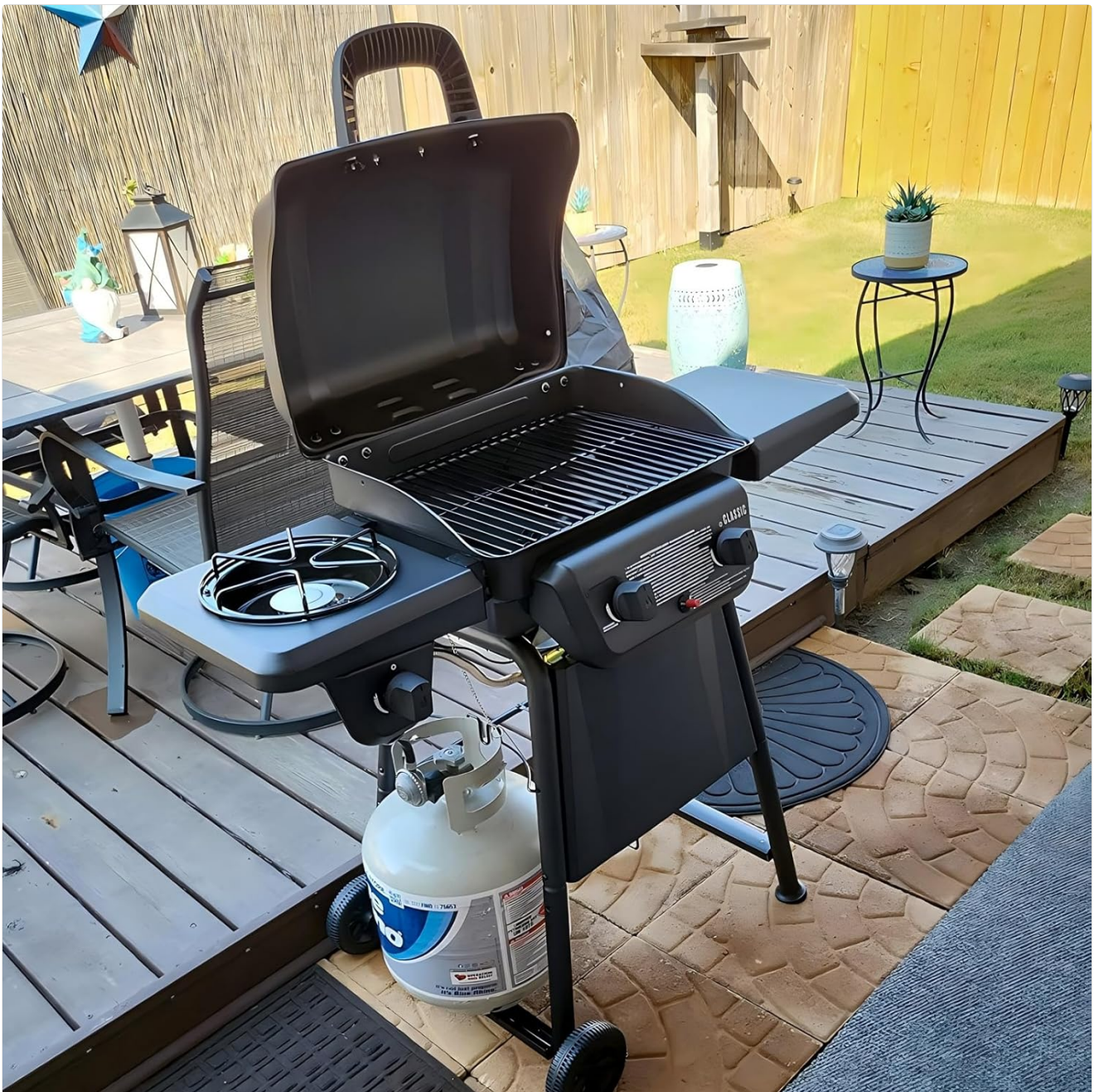
Image: A Charbroil Classic grill with new replacement parts installed, shown in an outdoor setting, ready for use.