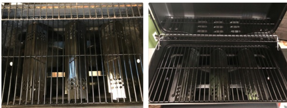
Image: Left: Interior view of a grill with new burners and heat tents installed. Right: Interior view of a grill with all new parts installed and cooking grates in place.