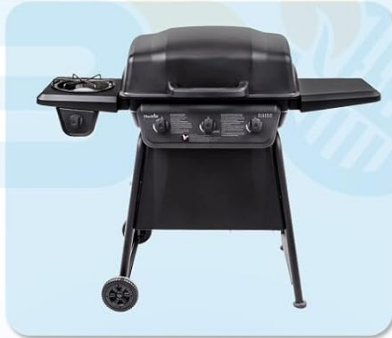
Charbroil Classic 360 3-Burner Gas Grill