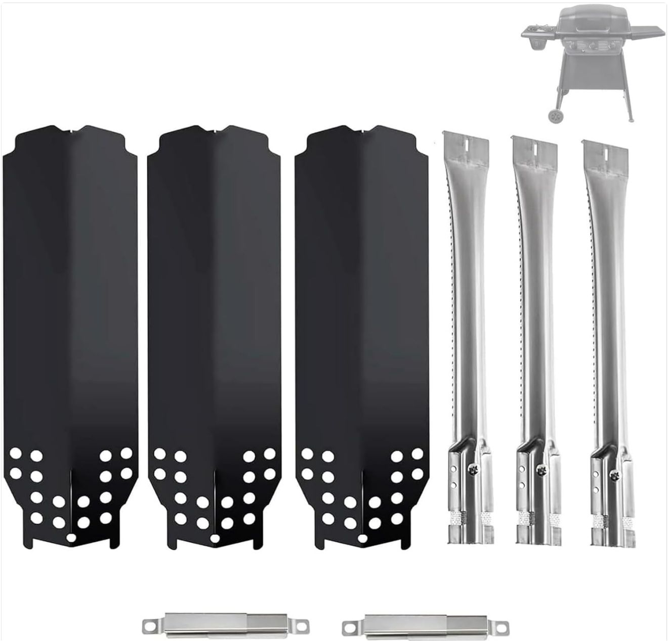
Image: Complete kit of BBQration grill replacement parts, including three heat tents, three burners, and two adjustable crossover tubes.