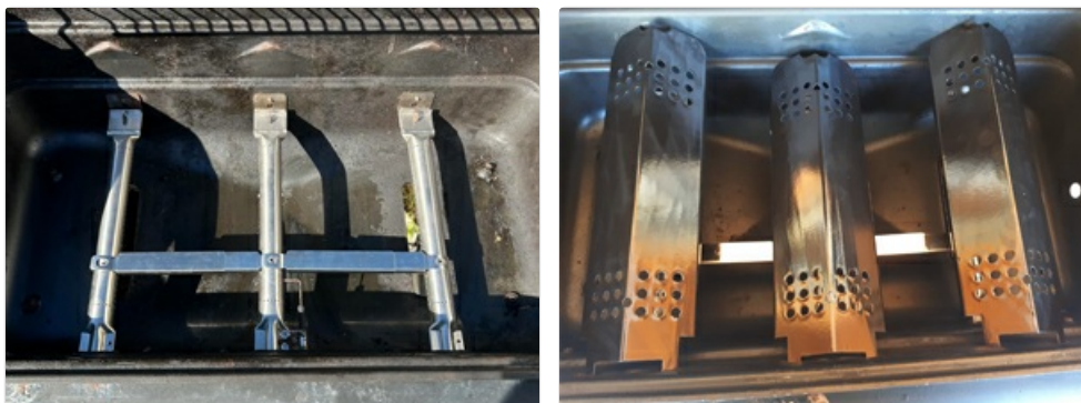
Image: Left: View of new burners correctly installed within the grill firebox. Right: View of new heat tents placed over the burners, ready for cooking grates.