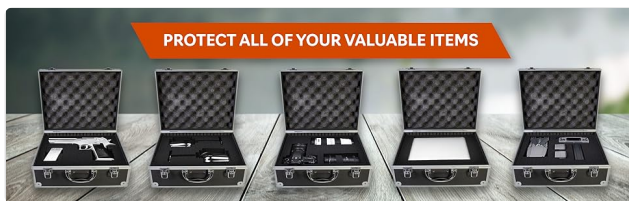
Image 2.2: Examples of valuable items protected within Zeikos cases.