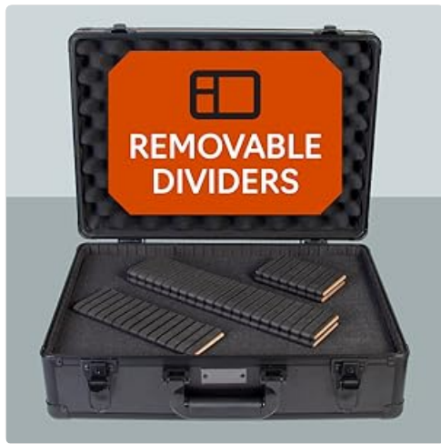
Image 2.1: Illustration of the multi-layered protection offered by the case.