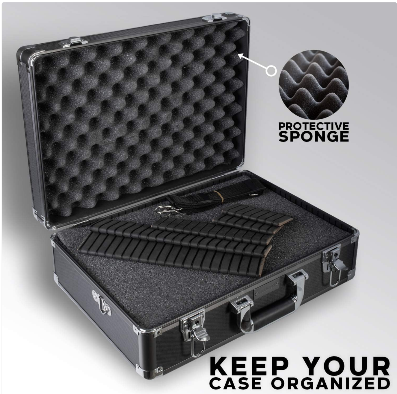
Image 1.1: The Zeikos ZE-HC36 case open, showcasing its protective foam interior.