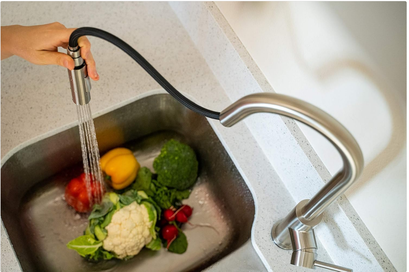
Image Description: A hand holds the pull-down sprayer of the faucet, directing a spray of water over various vegetables in a kitchen sink. The sprayer hose is extended, showcasing its flexibility and the spray function.