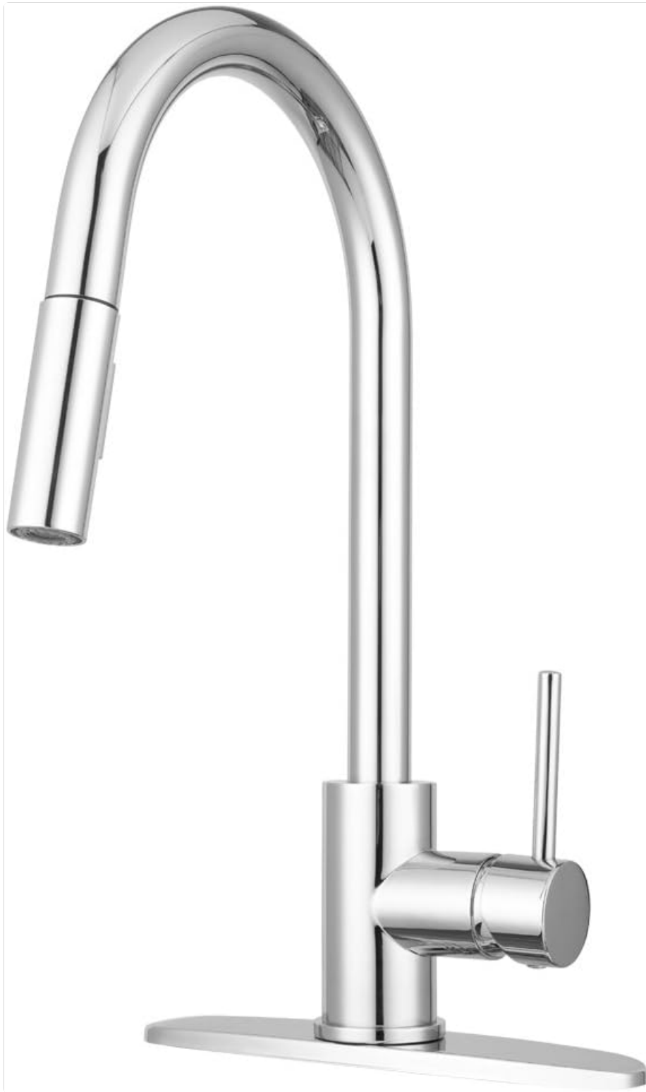
Image Description: The Dura Faucet RV Streamline kitchen faucet in polished chrome, shown installed with its optional deck plate on a sink surface. The single handle is visible on the right side of the base.