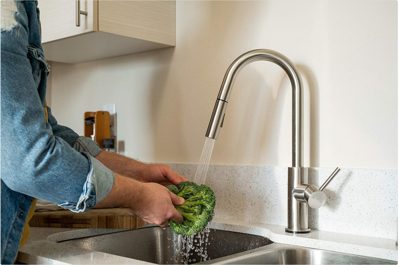
Image Description: A person's hands are shown washing broccoli under the faucet, which is in a brushed satin nickel finish. The water is flowing from the faucet's pull-down sprayer in a steady stream, illustrating the faucet's operational use in a kitchen setting.

3. Swivel Function: The faucet spout can swivel 360 degrees to provide maximum coverage and flexibility within your sink area.