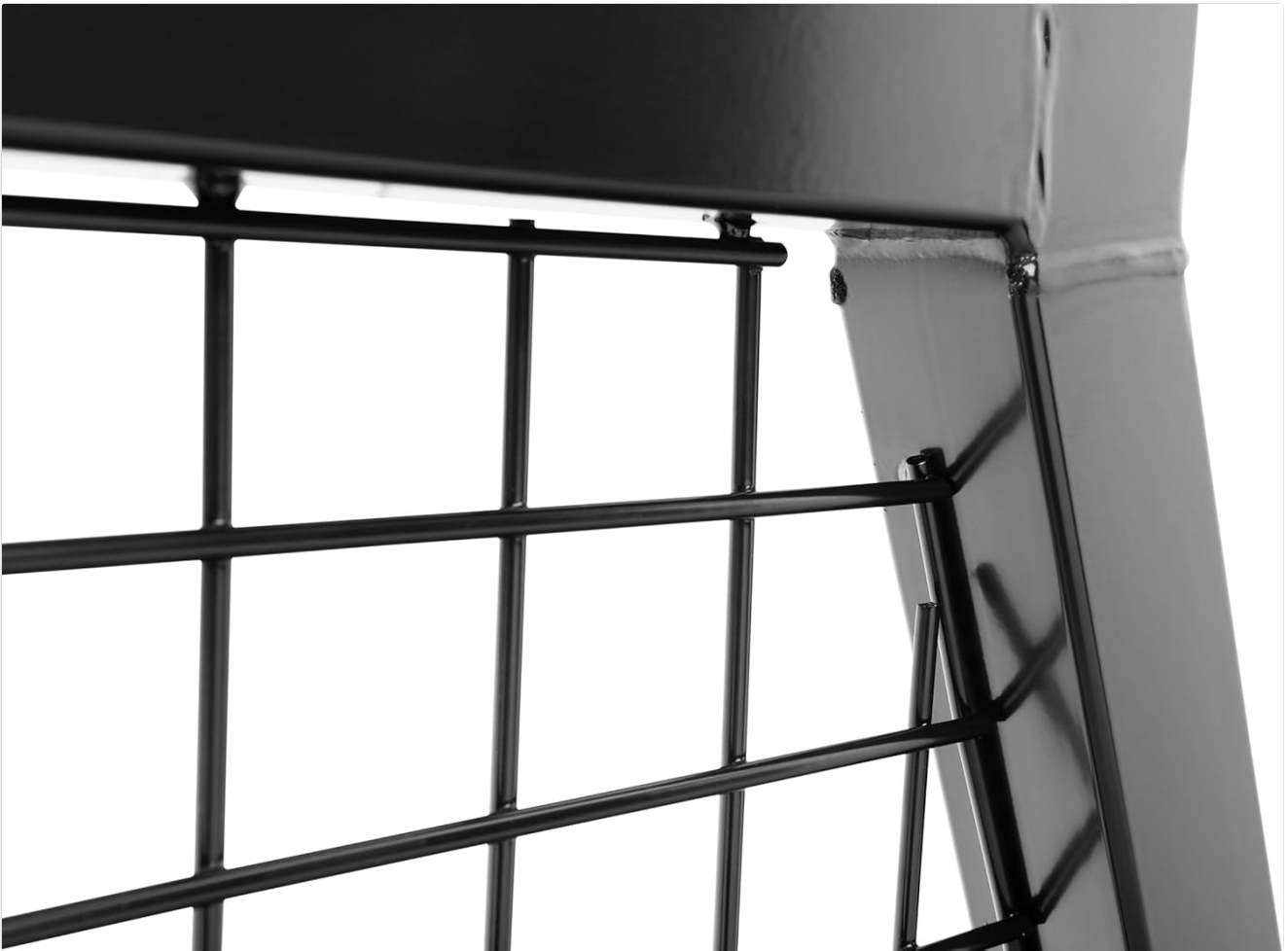
Figure 1.2: Close-up view detailing the robust frame and wire mesh construction.