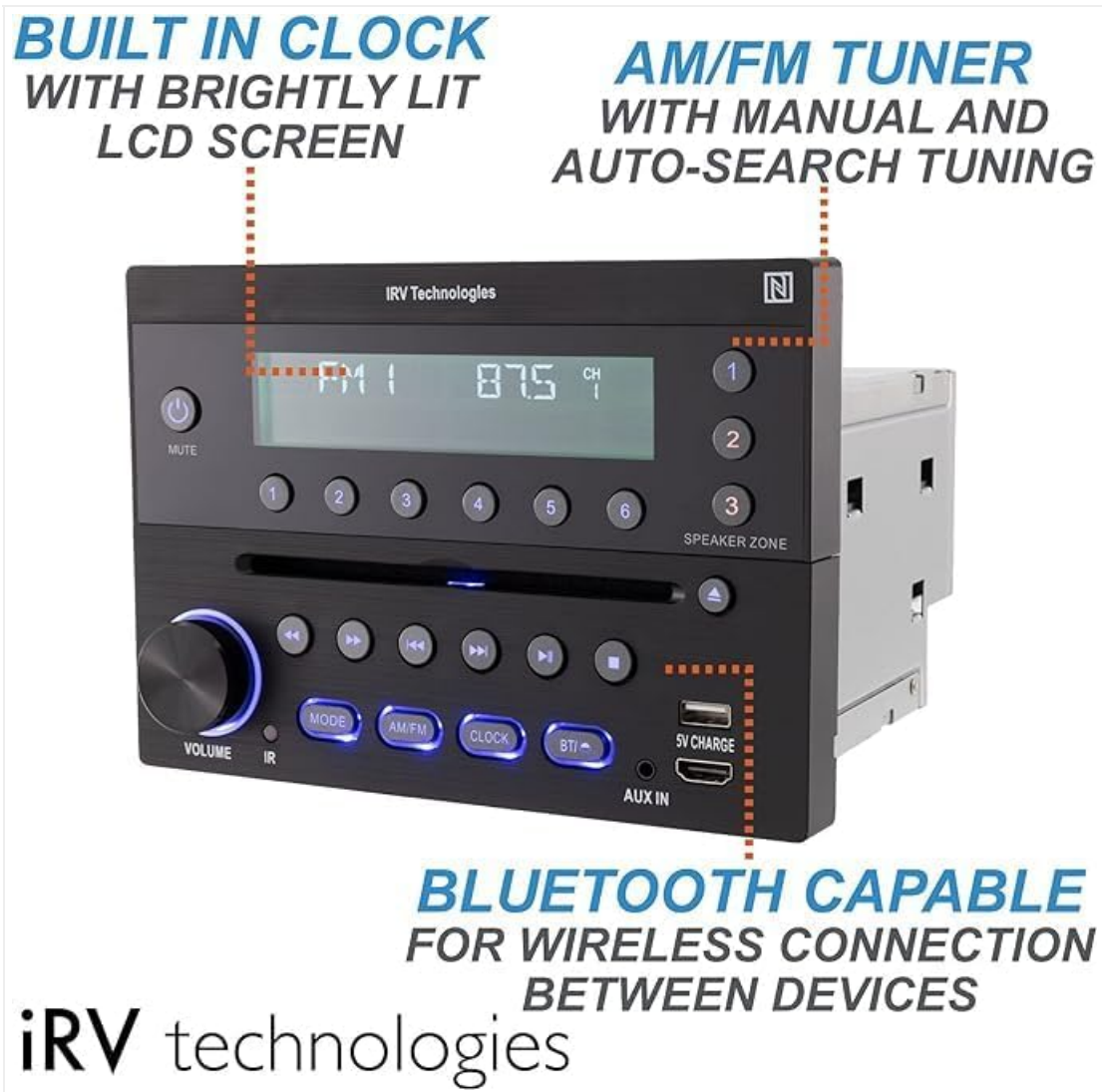
Figure 5: Front panel of the iRV32V2, illustrating key features such as the built-in clock, AM/FM tuner, and Bluetooth controls.