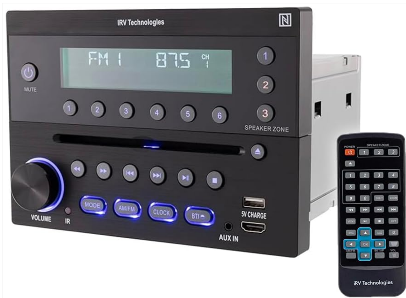
Figure 1: iRV32V2 RV Stereo with its remote control, showcasing the main unit and its dedicated remote for convenient operation.