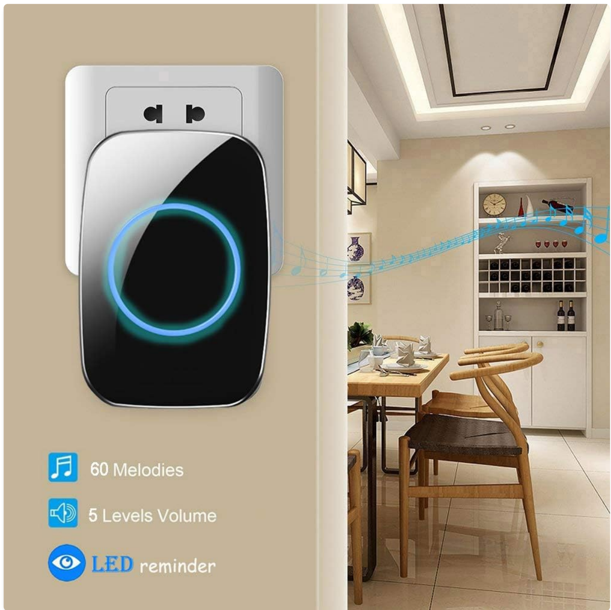
The doorbell receiver plugged into an electrical outlet.