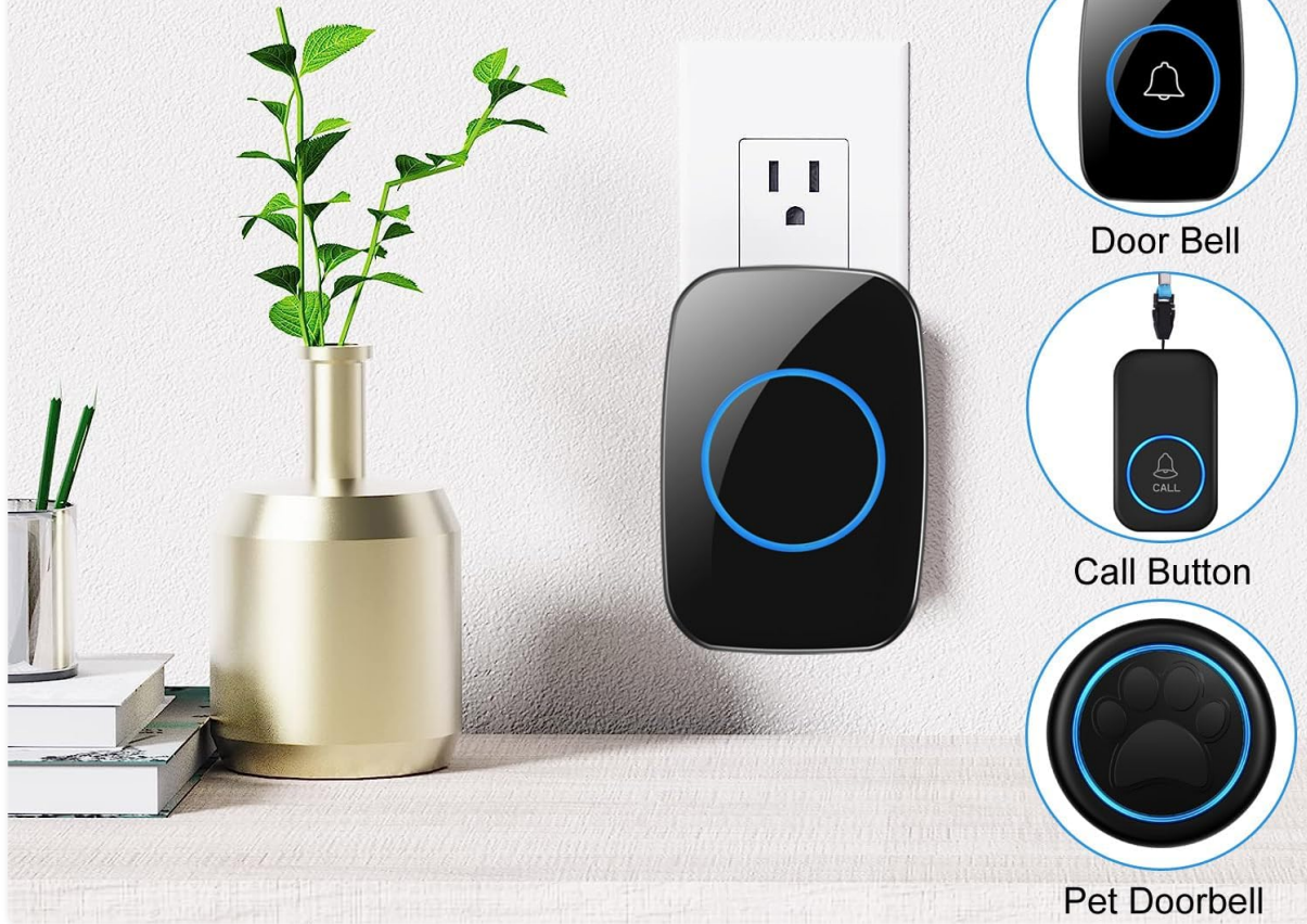
Image: The doorbell's IP44 waterproof rating for various weather conditions.

All FullHouse-branded transmitters and receivers can be paired with each other, and each transmitter can be set to a different tone.