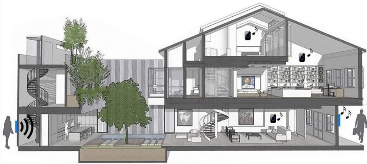
Image: The doorbell system's ability to distinguish between front and rear doors.