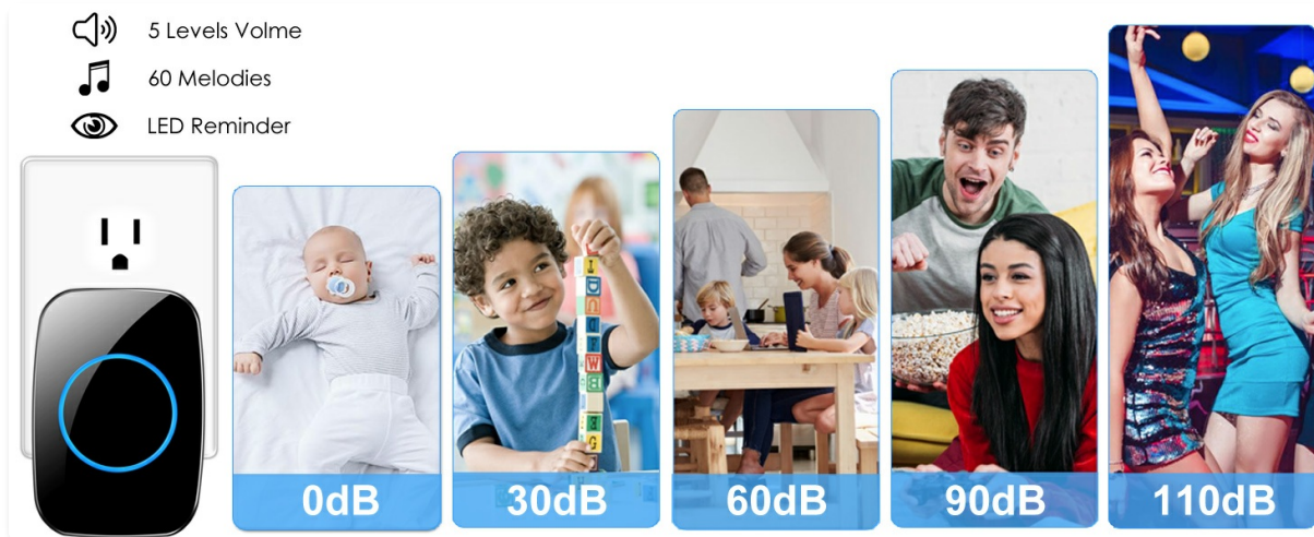
Image: Visual representation of the 5 volume levels available on the receiver.