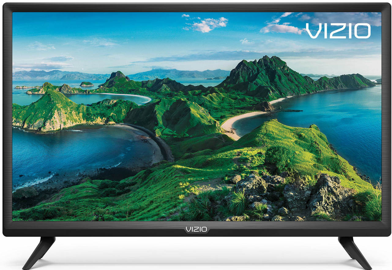
Image: VIZIO D32f-G1 32-inch Smart TV on a media console.