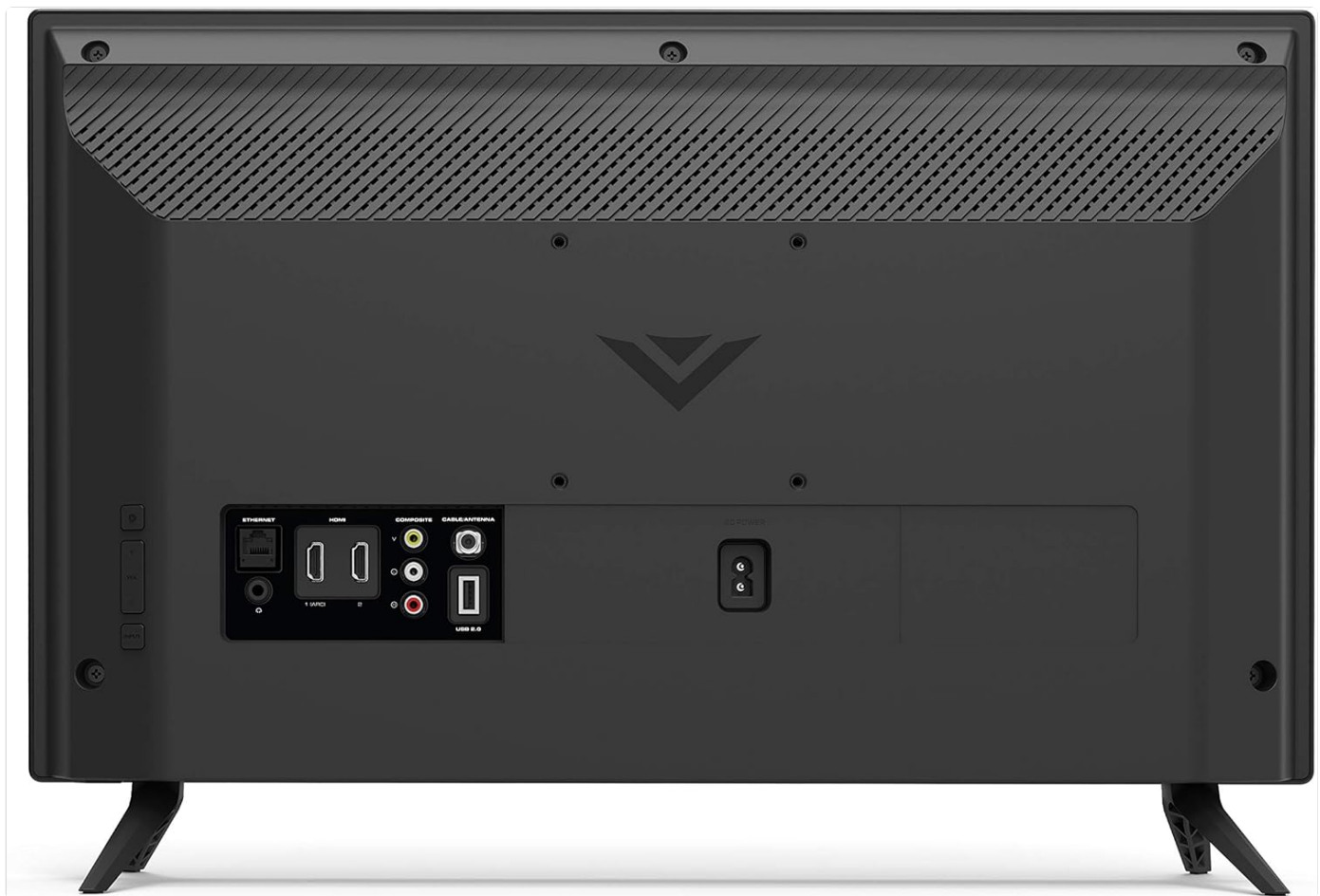
Image: Rear panel connectivity ports.