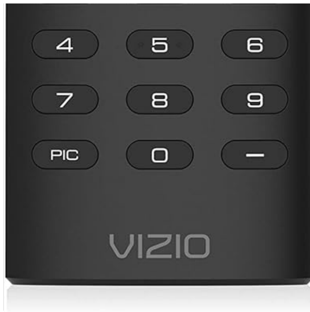
Image: VIZIO Smart TV Remote Control.