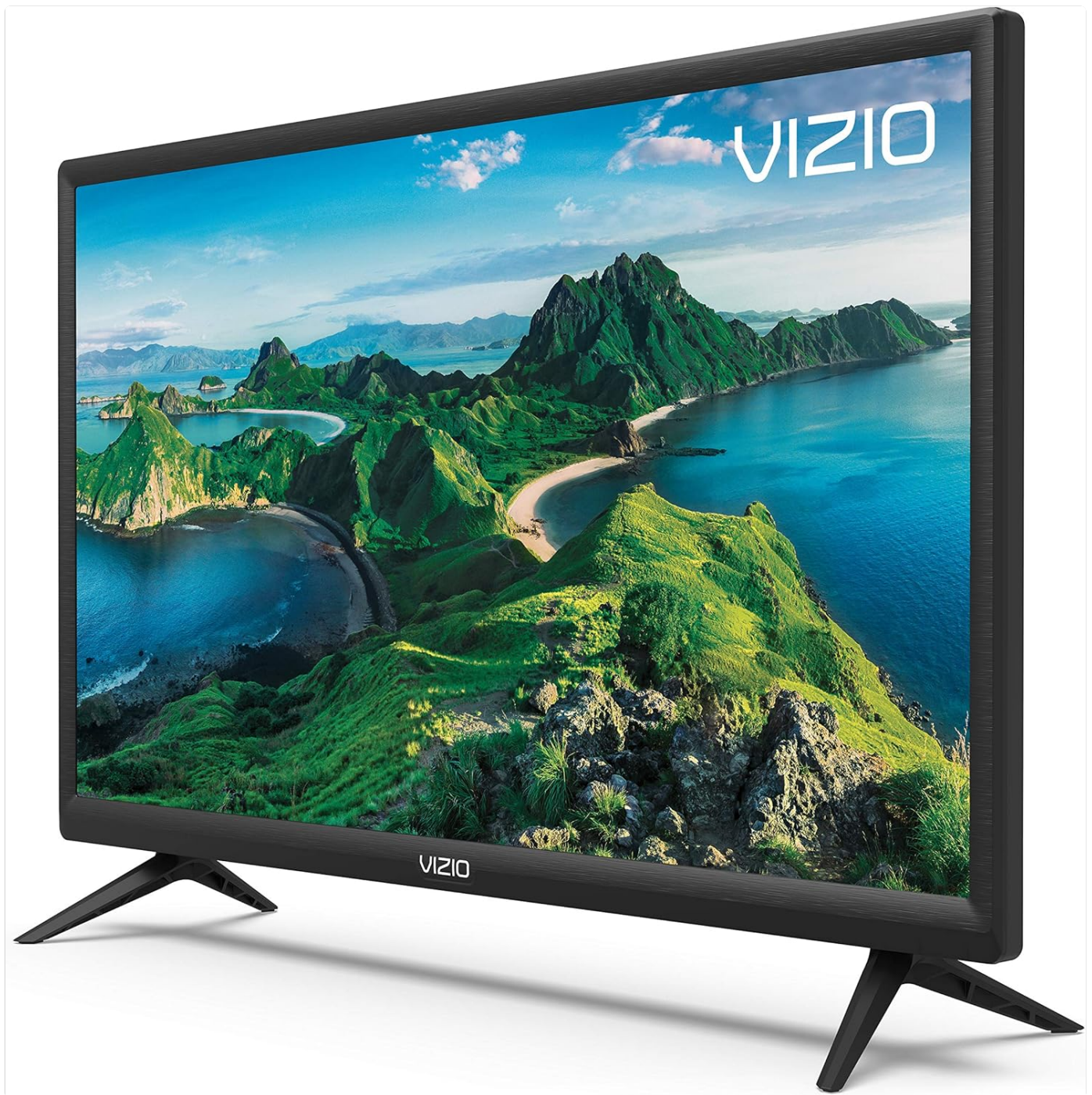
Image: VIZIO D32f-G1 TV with stand attached.