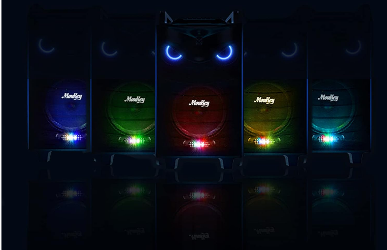
Image: The speaker displaying its dynamic colorful lights and distinctive owl-eye lights, designed to create a disco atmosphere.

Dynamic colorful lights and owl-eye lights bring a disco atmosphere to your party, more entertaining