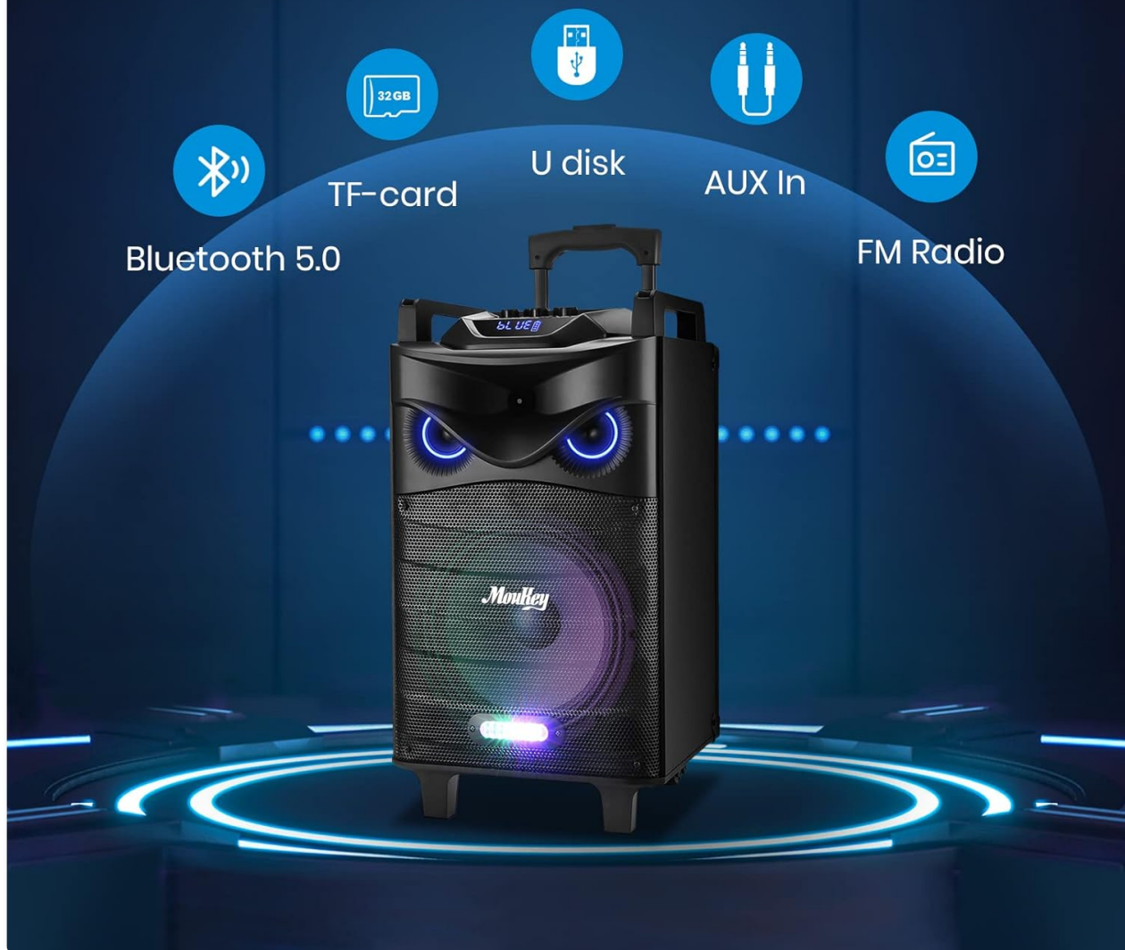
Image: A visual representation of the various connectivity options available, including Bluetooth 5.0, TF card, USB disk, AUX In, and FM Radio, highlighting the machine's versatility.