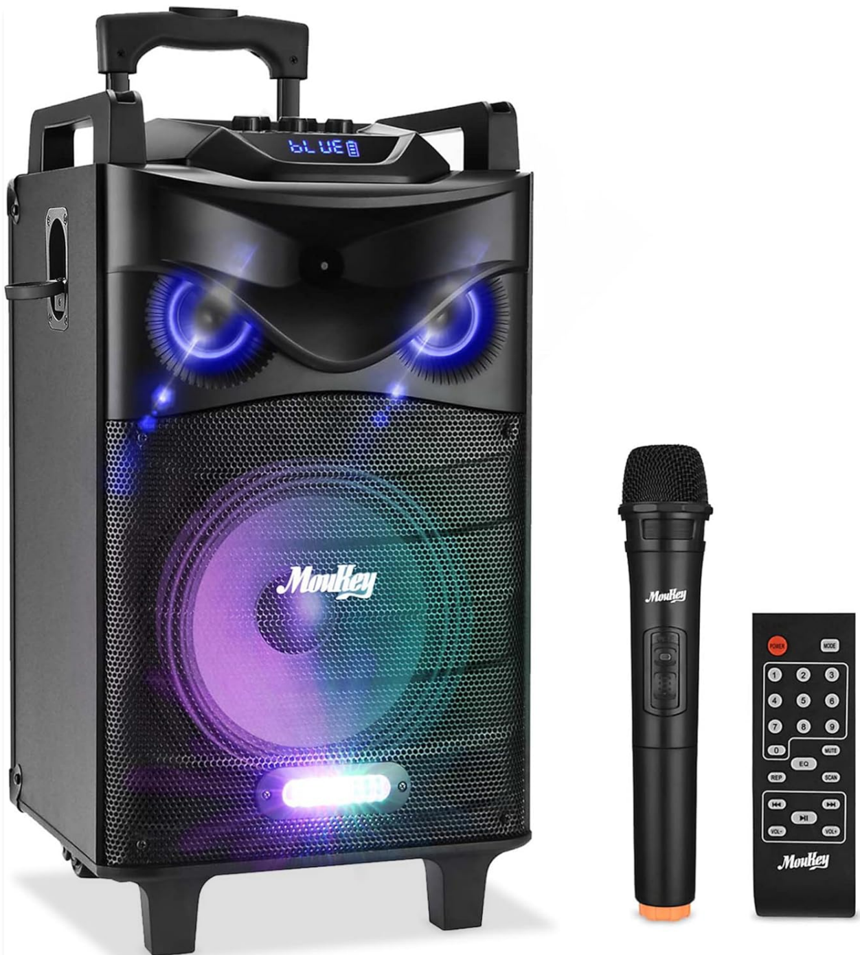
Image: Moukey Karaoke Machine MTs10-1, showcasing the main unit, wireless microphone, and remote control.