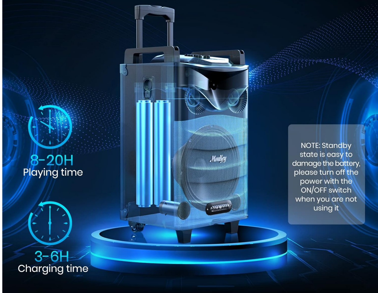
Image: A transparent view of the speaker showing its internal rechargeable battery, with indicators for 8-20 hours playing time and 3-6 hours charging time. A note advises turning off the power when not in use to prevent battery damage.

Rechargeable battery, plays it anytime, anywhere