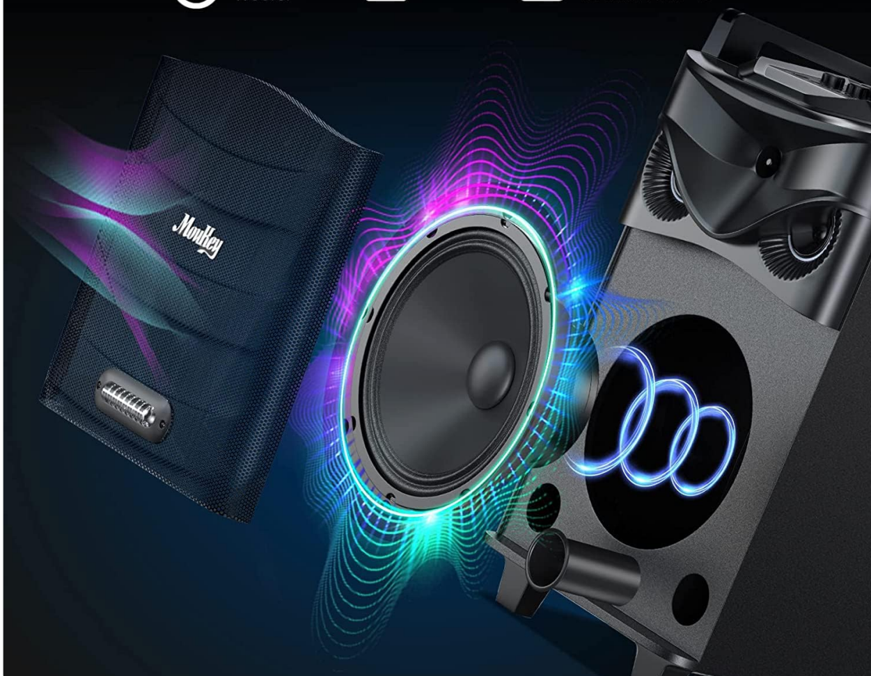
Image: An illustration detailing the speaker's components, including a 10-inch woofer and 3-inch tweeter, designed for powerful stereo sound and bass boost.