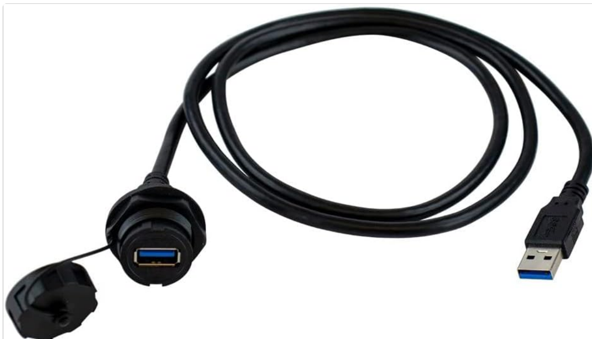
Image 1: The Sea-Dog 426509-1 USB Extension Cord, showing the male USB-A connector, the 9-foot cable, and the female USB-A port with its attached protective cap.

The Sea-Dog 426509-1 is a 9-foot (2.74 meter) male-to-female USB extension cord designed to extend the reach of your USB connections. It supports 2.4A power delivery and is suitable for connecting various USB devices. A key feature is its IP67 waterproof rating, making it suitable for both indoor and outdoor applications, especially in marine or damp environments. It also includes a protective cap for the female USB port when not in use.